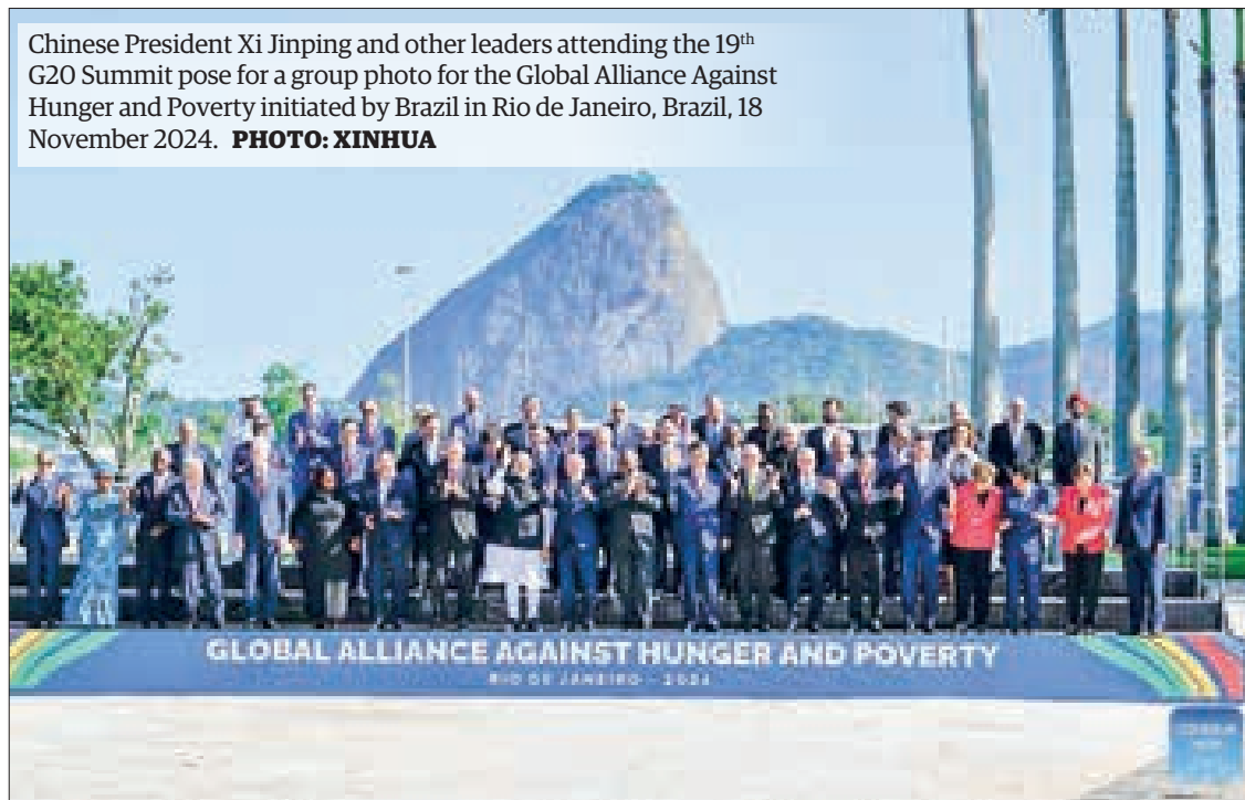
Chinese President Xi Jinping and other leaders attending the 19 th G20 Summit pose for a group photo for the Global Alliance Against Hunger and Poverty initiated by Brazil in Rio de Janeiro, Brazil, 18 November 2024.

G20 leaders reaffirmed their strong commitment to multilateralism and pledged to reform the global governance system, according to the G20 Rio de Janeiro Leaders' Declaration released on Tuesday.