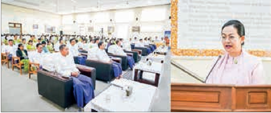
Union Minister Dr Thet Thet Khine opens the Chinese Language HSK-II training yesterday.

THE Ministry of Hotels and Tourism launched the Chinese language HSK-II training in Nay Pyi Taw yesterday.