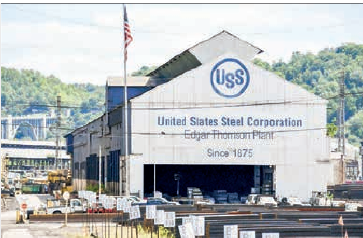
File photo taken 2 September 2024, shows United States Steel Corp's Edgar Thomson Plant in Braddock, near Pittsburgh, in Pennsylvania.

emphasized that the Japanese company has no intention to reduce US Steel's output capacity and said there is a lot of misinformation circulating regarding its takeover plan.