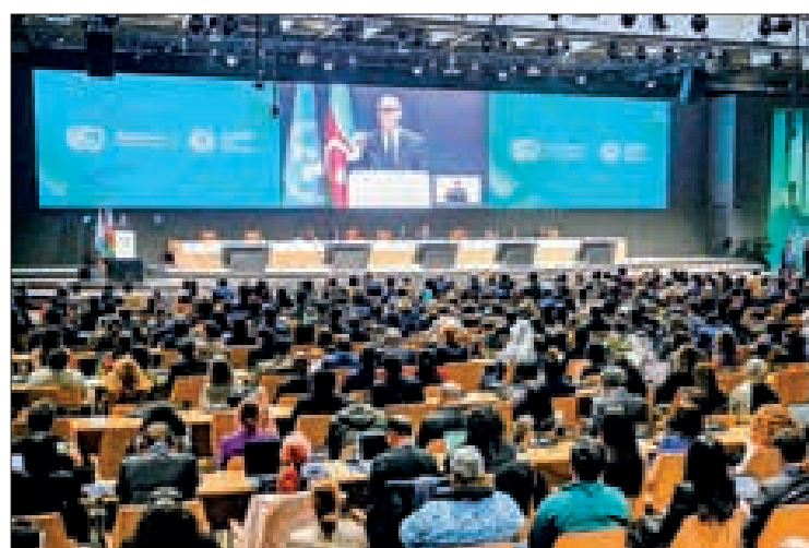
UN climate chief Simon Stiell delivers a speech during the opening of the 2024 United Nations Climate Change Conference (COP29) in Baku on 11 November 2024.

"G20 delegations now have their marching orders for here in Baku," UN climate chief Simon Stiell said in a statement.