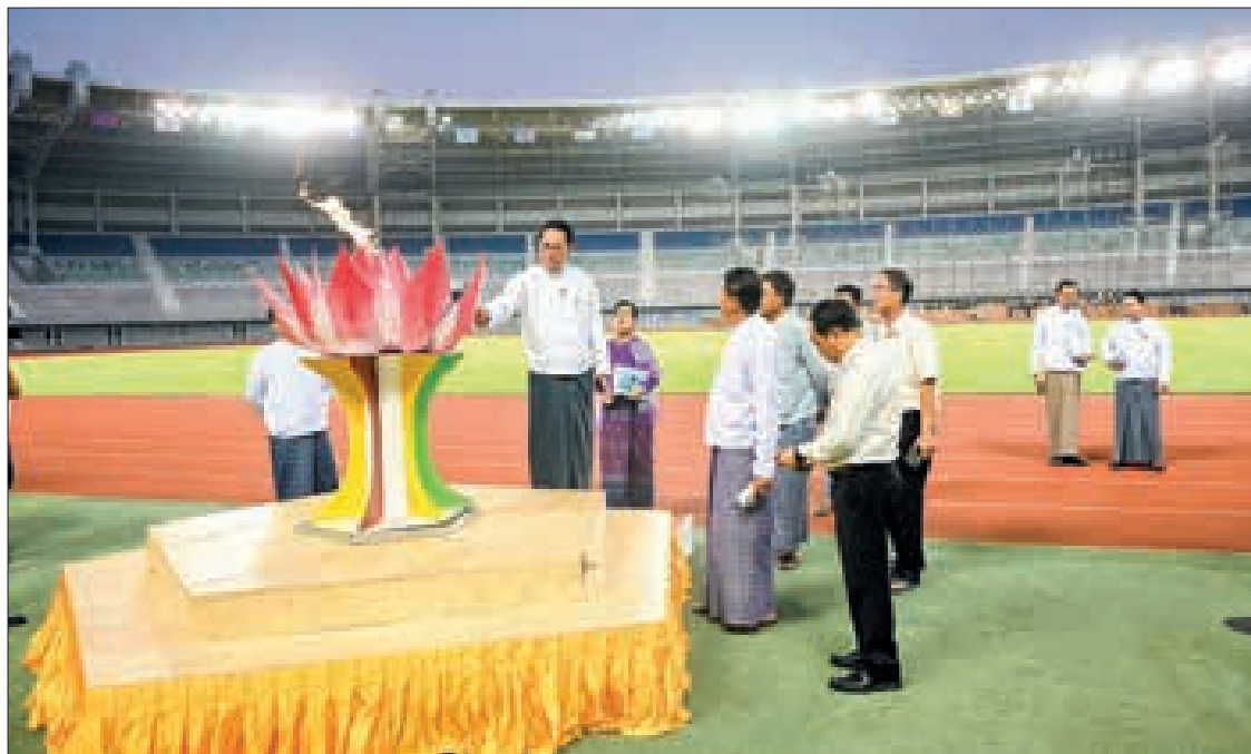
Union Minister U Maung Maung Ohn, Union Minister U Min Thein Zan, deputy ministers, and officials view the opening and closing venues for the Fifth National Sports Festival yesterday.

ion Minister U Maung Maung Ohn provided proper instructions to complete preparedness in time and report to officials on difficulties and urged for active participation as it is a national-level occasion.