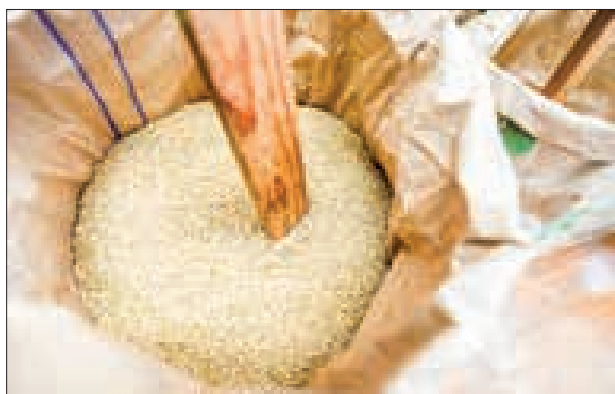
Photo taken on 18 October 2024 shows newly harvested rice in Tokyo, as wholesale rice prices hit their highest level in 31 years.

The transaction price of unpolished rice harvested this year, which could affect retail prices, rose 57 per cent from a year earlier to 23,820 yen ($154) per 60 kilograms, the highest