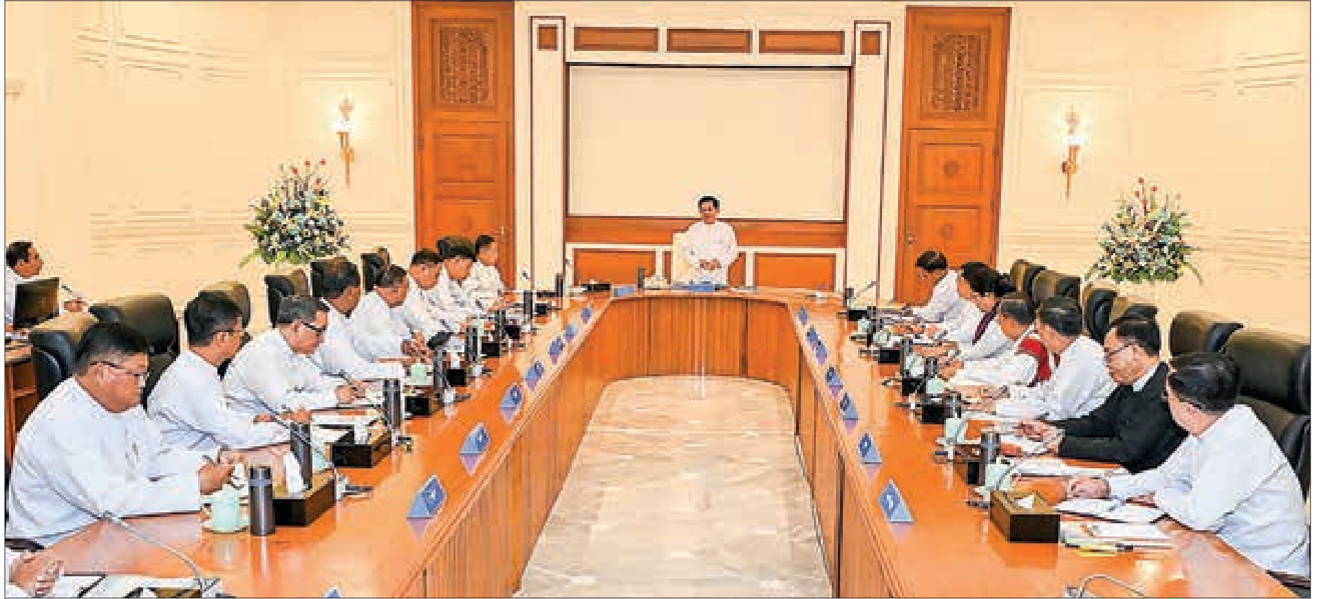
State Administration Council Chairman Prime Minister Senior General Min Aung Hlaing addresses the State Administration Council meeting in Nay Pyi Taw yesterday.

Senior General Min Aung Hlaing recounted that Chinese Premier Mr Li Qiang actively supports for the implementation of the Five-Point Roadmap of the State Administration Council as well as encourages more efforts of Myanmar to initiate political stability of the country and political reform process.