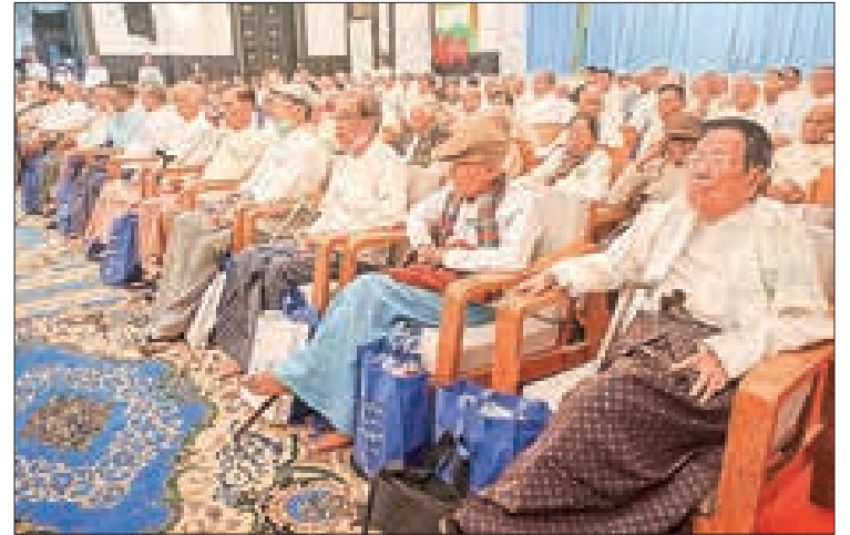
This photo captures senior literary scholars being honoured at the Myanmar Writers Association's annual reverence ceremony in the previous year.

The ceremony coincides with Myanmar Writers Day, typically observed on the first day of Nadaw (the ninth month in the Myanmar calendar). It reflects a long-standing tradition of acknowledging literary scholars who meet specific criteria the association sets. — ASH/KZL