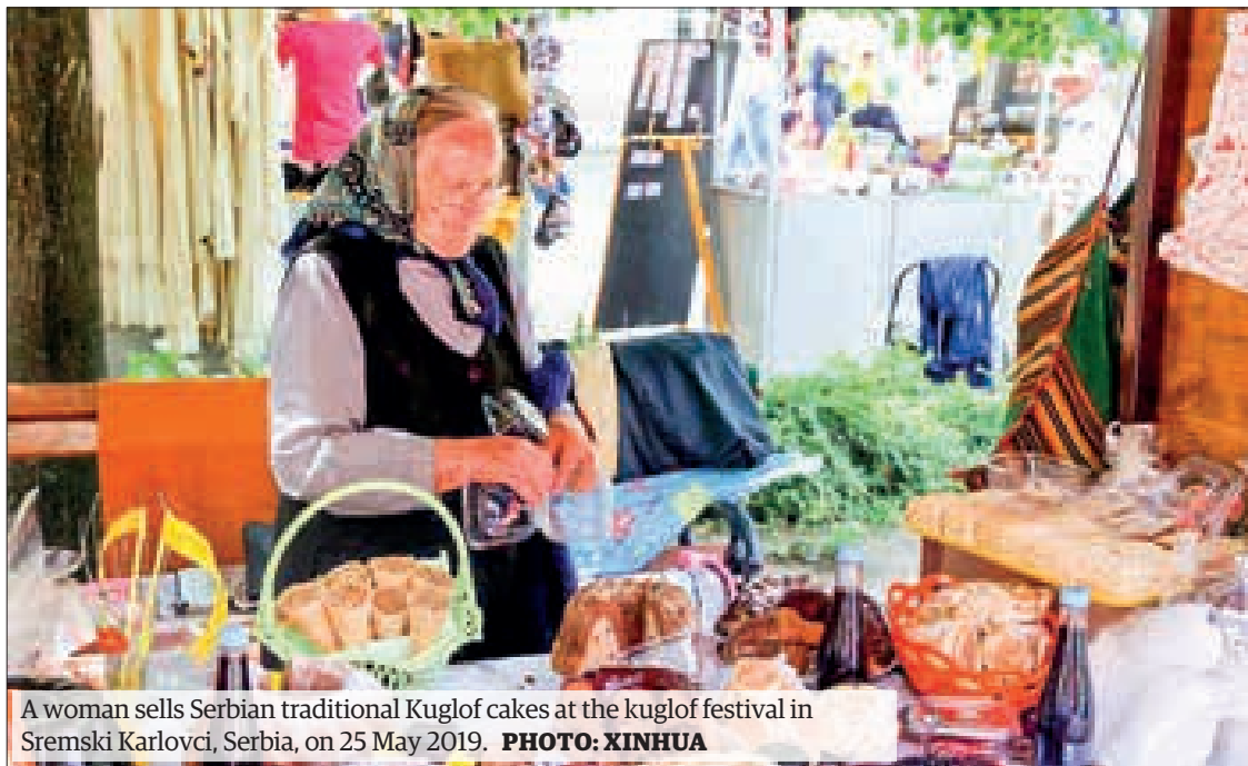
A woman sells Serbian traditional Kuglof cakes at the kuglof festival in Sremski Karlovci, Serbia, on 25 May 2019.

Labovic attributed the growth to such factors as the recent launch of direct flights between Guangzhou and Belgrade, the upcoming connection to Shanghai, visa-free travel,