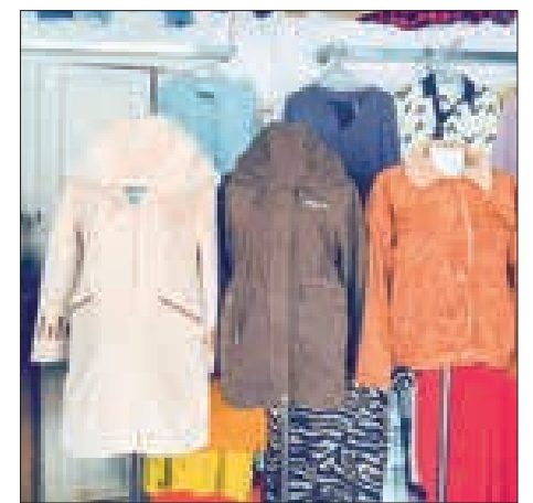
This image captures warm clothes being displayed at the store.

ACCORDING to the garment market, sales of warm clothes may improve in the coming December.