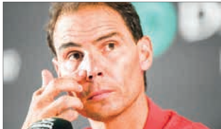
Rafael Nadal of Team Spain gestures during a press conference ahead of the Davis Cup tennis tournament finals, in Fuengirola, near Malaga, on 18 November 2024.

David Ferrer's team face the Netherlands in the quarter-finals on Tuesday, although it is unknown if Nadal will participate in the tie. — AFP