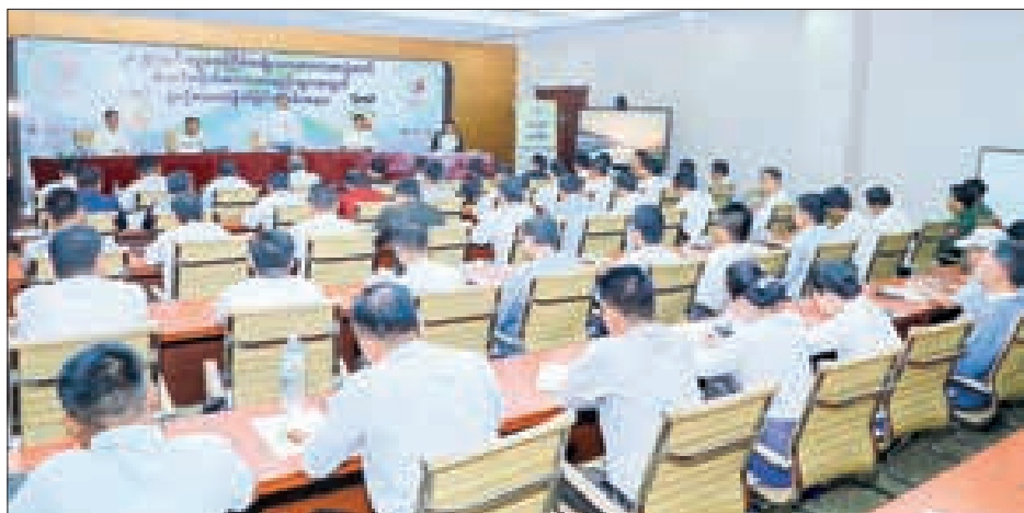
The timetable-drawing event for team sports of the Fifth National Sports Festival in progress yesterday.

Officials emphasized that all teams must comply with the established rules and regulations, which have been pre-approved and distributed to the relevant departments to ensure fair competition. The event was attended by various key