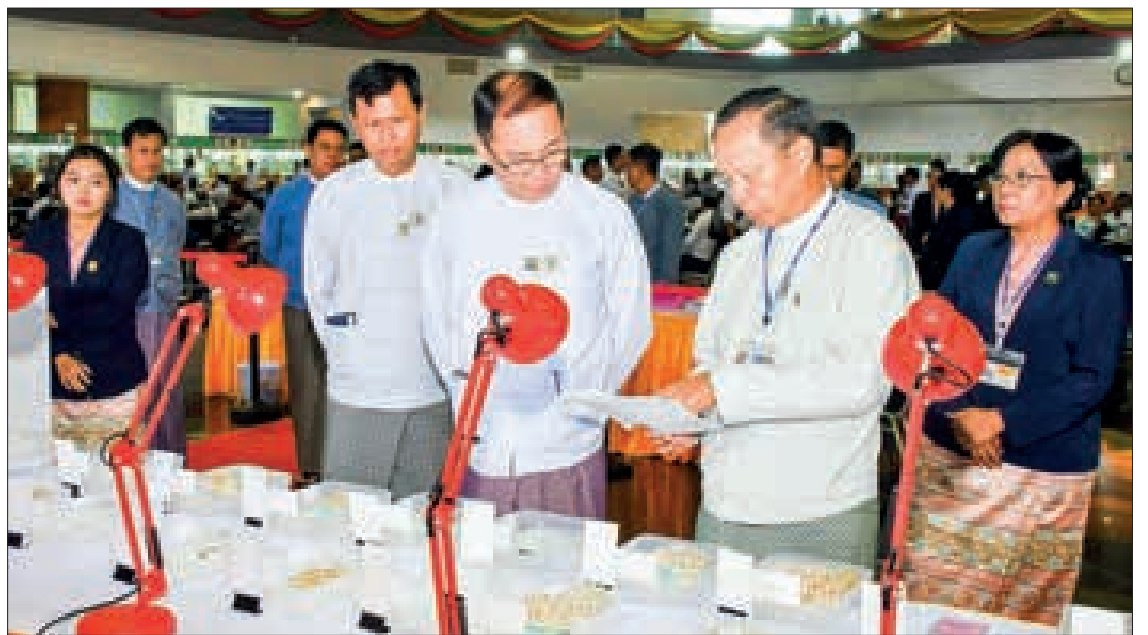
Union Minister U Khin Maung Yi looks into pearl lots on the second-day emporium yesterday.

The emporium will continue at the Mani Yadana Jade Hall between 18 and 27 November, bustling with local and international traders exploring and purchasing various high-value items. Payments are accepted in foreign currencies such as the US dollar, euro, yuan, and baht, as well as Myanmar kyats for domestic traders. — MNA/KZL