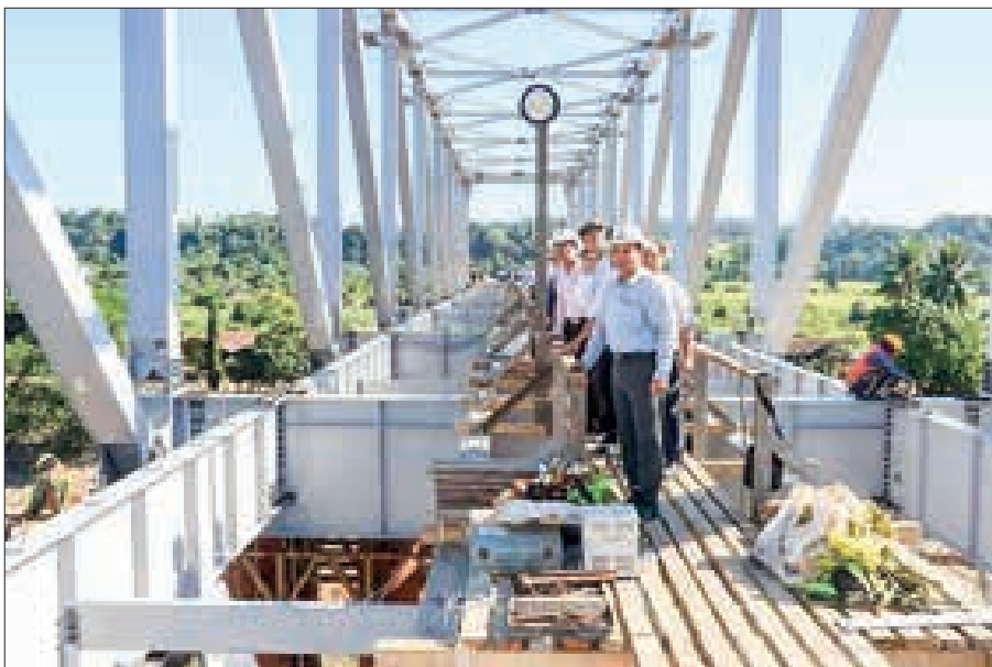
This image depicts officials inspecting the construction site of the Chindwin Bridge (Htamathi).

ACCORDING to the Department of Bridges with the Ministry of Construction, the construction of the Chindwin Bridge (Htamathi), linking Homalin Township in Sagaing Region and Leshe in the Naga Self-Administered Zone, is 70 per cent completed.