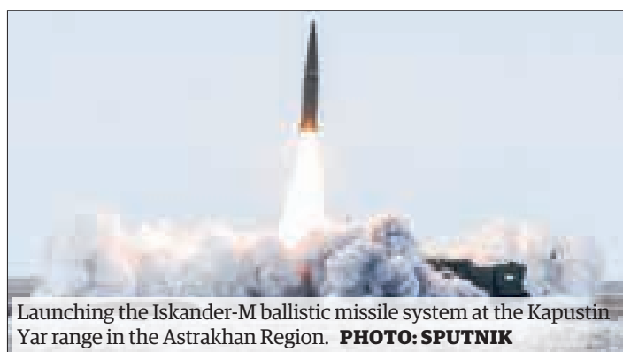
Launching the Iskander-M ballistic missile system at the Kapustin Yar range in the Astrakhan Region.

EARLIER on Tuesday, the official website for legal acts released a decree signed by Russian President Vladimir Putin titled "On Approving the Fundamentals of the State Policy of the Russian Federation on Nuclear Deterrence".