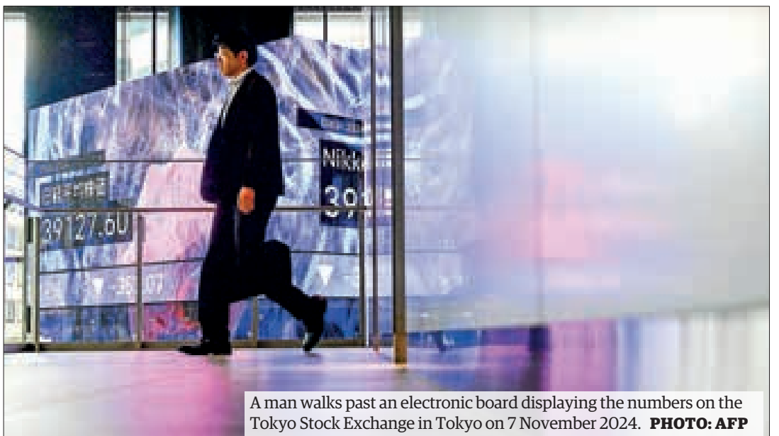
A man walks past an electronic board displaying the numbers on the Tokyo Stock Exchange in Tokyo on 7 November 2024.

Bargain-hunting also lifted the market after recent declines over concerns about President-elect Donald Trump’s proposed policies, such as higher tariffs, but trading remained muted amid a lack of fresh trading cues, brokers said. — Kyodo