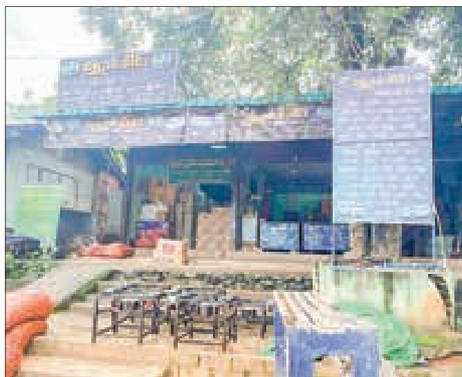
This photo showcases locally produced stoves that can use the utilized engine oil and cooking oil.

It functions by using the utilized engine oil or cooking oil. A small fan is equipped to control the heat level and it can run by a power bank or battery when the electricity is off. — MT/ZS