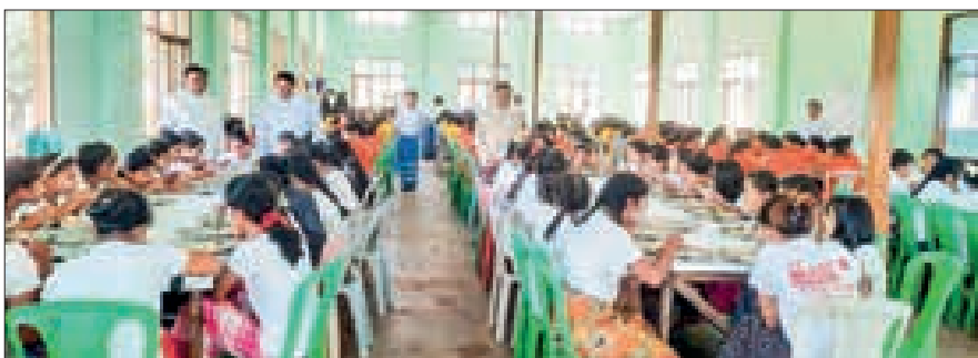
MNHRC Commissioners view round the mess of the centre yesterday.

MNHRC will send recommendations on the findings during the inspection to the relevant departments. — MNHRC