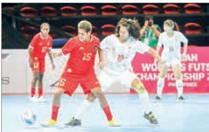
Myanmar and Indonesia compete during their match.

In the Group Stage, Indonesia defeated Myanmar with a seven-goal margin, while Vietnam won 6-1 against the host country the Philippines. This unexpected result left Myanmar's women's futsal team with a diminished chance of qualifying for the third-place play-off. Despite showing good form in earlier matches against Thailand, Vietnam, and the Philippines, the Myanmar team struggled in this match, making errors and suffering from player fatigue after four consecutive days of play. Indonesia scored three goals in the first half and added four more in the second half.