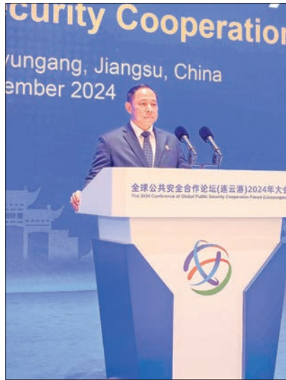
Union Minister Lt-Gen Yar Pyae speaks on the occasion of the 2024 Conference of Global Public Security Forum in China on 9 September.

During the forum, the Union minister discussed the international cooperation to combat prolonged violence and criminal gangs that create conflicts, deepen practical cooperation in the field of law enforcement and fight against