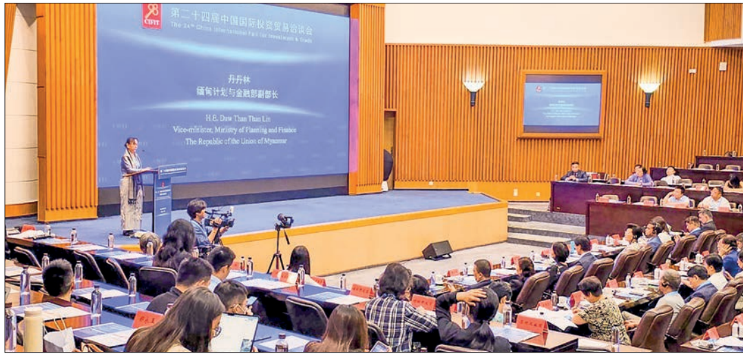
Deputy Minister Daw Than Than Lin participates in the discussion of the 24 th CIFIT and investment conferences in China on 7-11 September.

AT the invitation of the organizing committee of the People's Republic of China's International Trade and Investment Expo, a delegation led by Deputy Minister for Planning and Finance Daw Than Than Lin attended the 24 th China International Fair for Investment and Trade (CIFIT) in Xiamen, China, from 7 to 11 September.