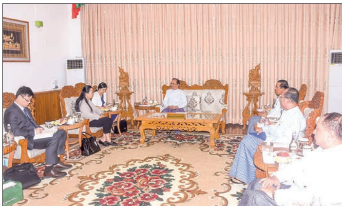
Union Health Minister Dr Thet Khaing Win receives the Chinese ambassador yesterday.

Myanmar-China community. The deputy minister and directors-general, officials from the Ministry of Health and representatives from the Embassy of the People's Republic of China were present at the meeting. — MNA/TS