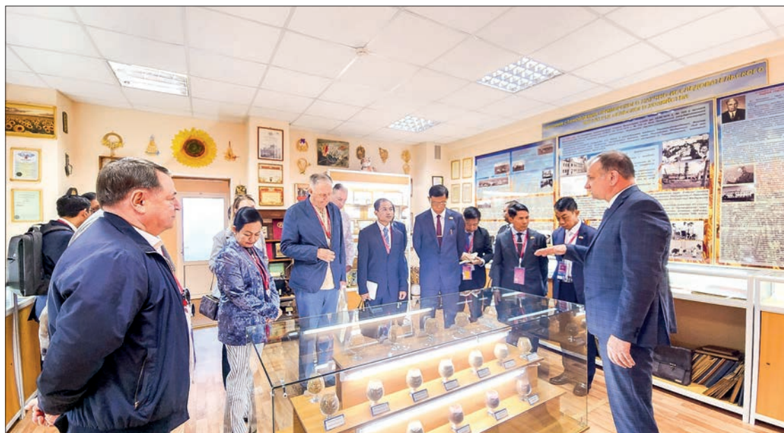
SAC Member Deputy Prime Minister MoTC Union Minister General Mya Tun Oo and Myanmar delegation are seen during their observation tour in Russia.

Union Minister for Hotels and Tourism Dr Thet Thet Khine contributed to the dialogue on New contours of International cooperation during the Russia-ASEAN Business Dialogue on 4 September, while Union Minister for Industry Dr Charlie Than on Experience of Developing Production Chains in The EAEU, SCO and BRICS