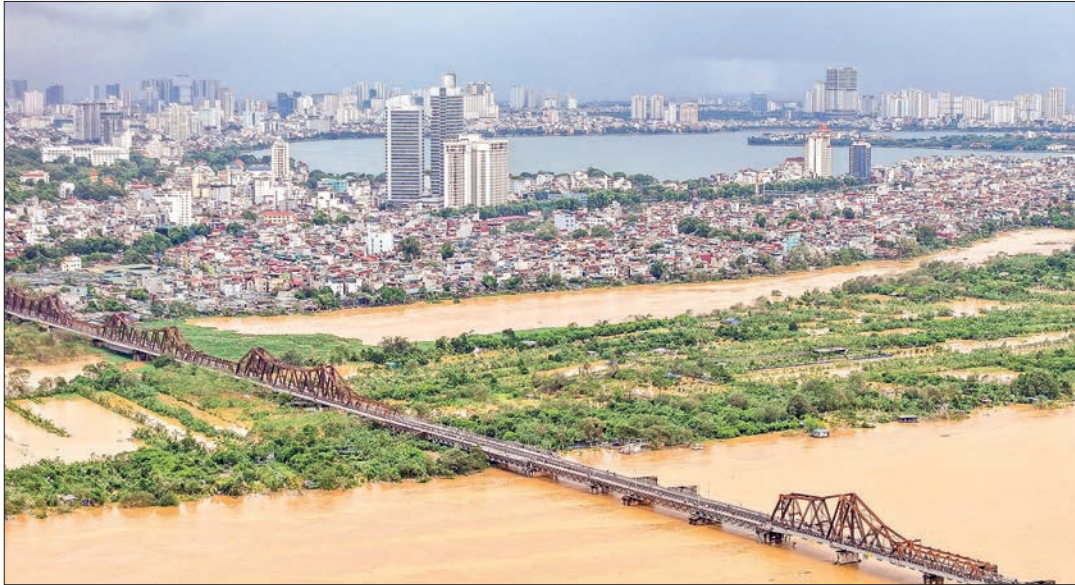
This aerial photo shows the flooded Red River in Hanoi on 10 September 2024 in the aftermath of Typhoon Yagi hitting northern Vietnam.

TENS of thousands of people were forced to flee their homes on Tuesday as massive floods inundated northern Vietnam in the wake of Typhoon Yagi, and the death toll climbed to 82.