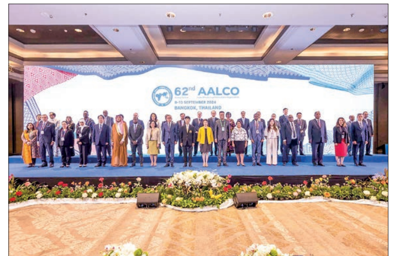
The commemorative group photo of the 62 nd Annual Session of Asian African Legal Consultative Organization in Thailand on 9-13 September.

Moreover, the Myanmar delegation exchanged views on the work plans of the International Law Commission (ILC), the law of the sea, international humanitarian law, environmental protection and sustainable development and international airspace. — MNA/KTZH