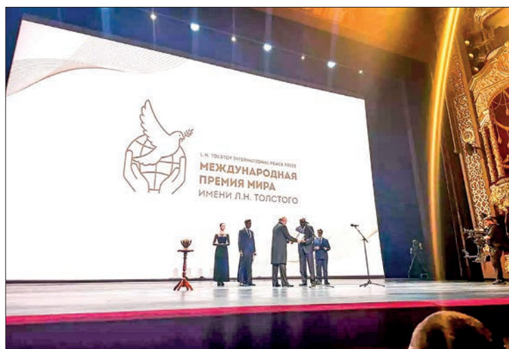
Leo Tolstoy International Peace Prize award ceremony, Moscow, 9 September 2024.

The award was presented by Valery Gergiev, world-famous conductor and chairman of the Leo Tolstoy International Peace Prize jury.