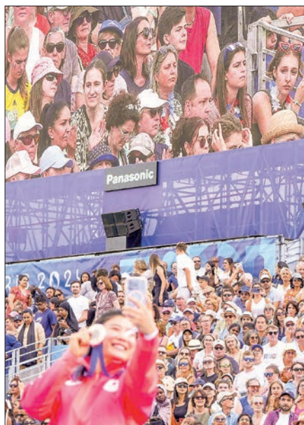
File photo shows a large Panasonic display installed at a Paris Olympics venue in Paris in August 2024.

PANASONIC Holdings Corp said Tuesday it will discontinue its sponsorship agreement with the International Olympic Committee, putting an end to its 37-year marketing tie-up with the event.