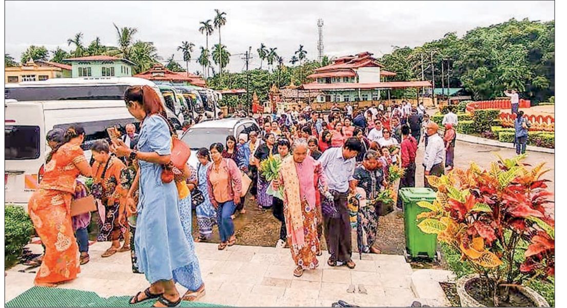
This image shows day-trip visitors.