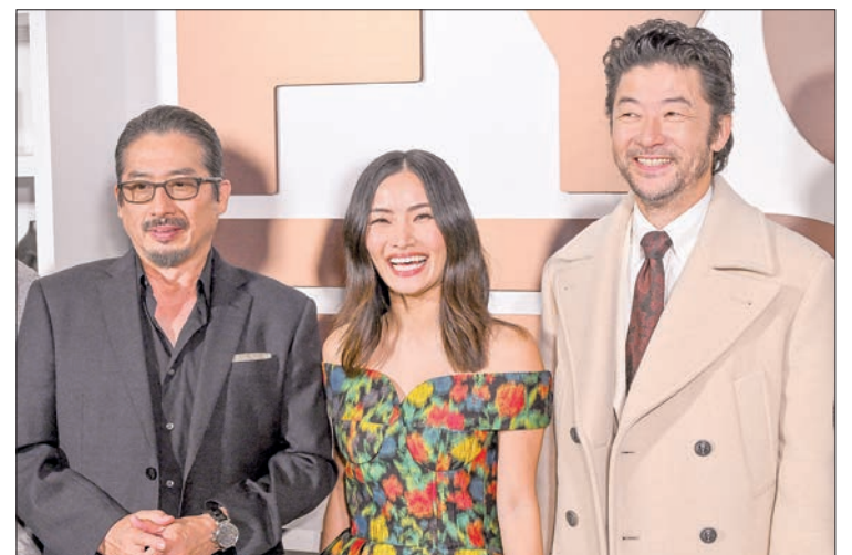
Japanese actor and producer Hiroyuki Sanada (L) with Japanese actors Anna Sawai and Tadanobu Asano (R) attend FX's "Shogun" FYC Event at the Directors Guild of America Theater in Los Angeles, California, on 11 June 2024.

Sanada is nominated for best lead actor for his role as Yoshii Toranaga, a warlord modeled on historical figure Tokugawa Ieyasu. — Kyodo