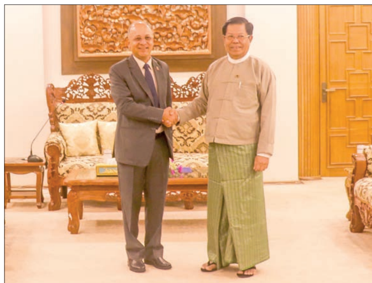
Deputy Prime Minister MoFA Union Minister U Than Swe shakes hands with Nepali Ambassador Mr Harishchandra Ghimire yesterday.

They cordially exchanged views on the promotion of friendly bilateral ties and expansion of cooperation in areas of mutual interest, including trade and investment, culture, tourism and information technology between Myanmar and Nepal. — MNA