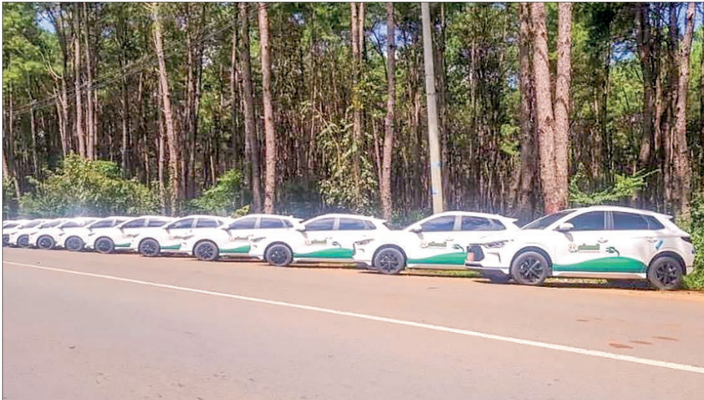
This photo showcases BYD E-2 (2023) electric vehicles being used by the 'Mingalaba' highway service, which operates between Mandalay and PyinOoLwin townships.