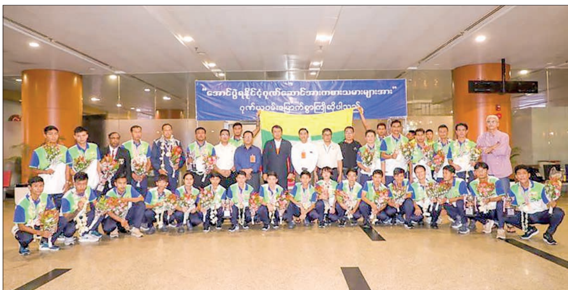
Medallists from the Myanmar Sepak Takraw team pose for the commemorative group photo during the welcoming ceremony yesterday.

The Myanmar team, consisting of six coaches, 12 male players, and 11 female players,