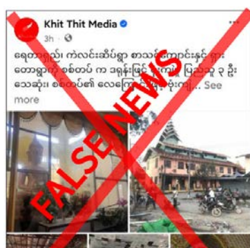
This screenshot reveals misinformation.

However, a security officer from Yedashe confirmed that these claims were untrue, and no such attacks took place. Subversive media outlets reportedly fabricate these false stories. — MNA/TRKM