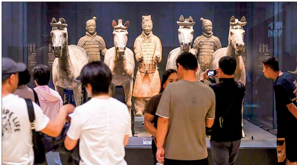
People visit an exhibition, commemorating the 50 th anniversary of the discovery and excavation of the iconic Terracotta Warriors, at the Emperor Qinshihuang's Mausoleum Site Museum in Xi'an, capital of northwest China's Shaanxi Province, 8 September 2024.

The colour of the sleeves, known as Chinese Purple or barium copper silicate, was created chemically via reactions involving azurite, malachite and other elements at 1,000 degrees Celsius, according to Ye Ye, deputy director of the