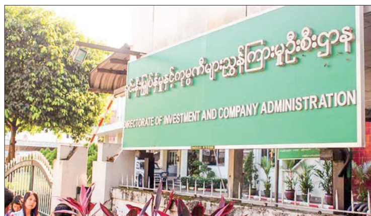
A signage displays the Directorate of Investment and Company Administration (DICA) office.

Under Section 266 (A) of the Myanmar Companies Law 2017, public companies must submit annual returns and financial statements (G-5) simultaneously. All overseas corporations must submit ARs in the pre-