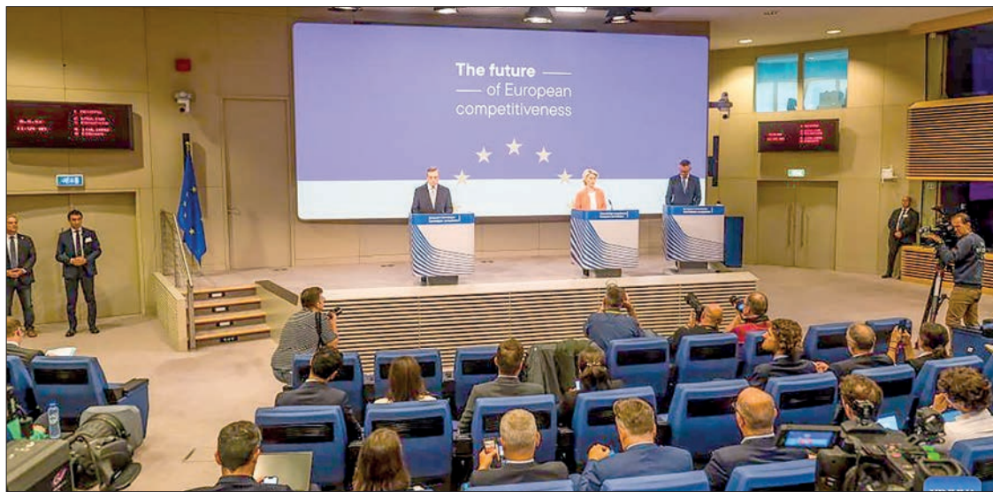
People attend a press conference on the report of the future of European competitiveness in Brussels, Belgium, on 9 September 2024.

debt tools shared between EU member states, and other collaborative strategies to