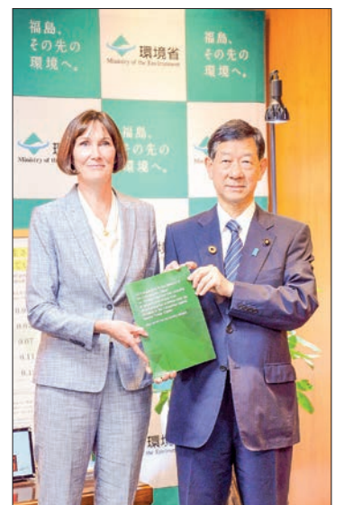
An International Atomic Energy Agency official (L) hands its final expert report on Japan's plan to reuse decontaminated soil following the 2011 Fukushima Daiichi nuclear power plant accident to Japanese Environment Minister Shintaro Ito in Tokyo on 10 September 2024.

Around 14 million cubic metres of low-level radioactive