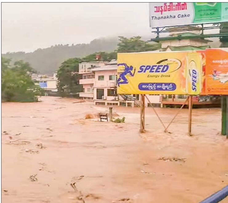
Floodwaters enter Tachilek on the morning of 10 September 2024.

Htun, Makaho Khan, Mekong, and Sansaing (A) and (B), have reported water entering homes and overflowing onto roads. Residents of severely flooded homes are being evacuated by local fire brigade members and social welfare volunteers to safer locations. The Department of Meteorology and Hydrology has issued warnings, urging those living near riverbanks and low-lying areas to remain cautious and prepared. This flooding marks the sixth significant flood in Tachilek in just over a month, with local social welfare groups reporting multiple incidents of rising water levels in August alone. — TWA/KZL