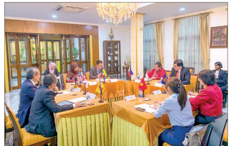
This photo shows the 60 th Heads of Missions Meeting of the ASEAN Dhaka Committee (ADC).

Additionally, the meeting covered topics such as the ASEAN Family Day ASEAN tree-planting initiatives and exchanged views on enhancing relations with the host country, Bangladesh, as well as the regional and internal developments within respective ASEAN nations. — ASH/TMT