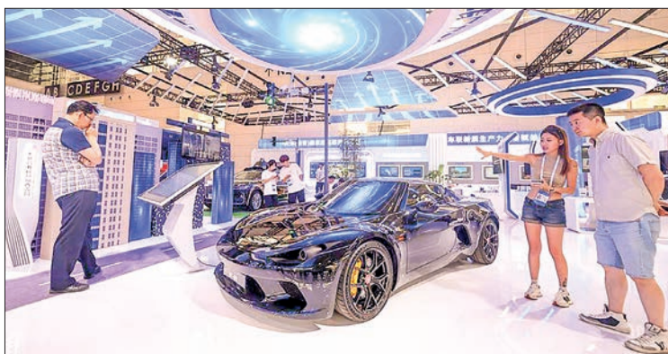
Visitors look at a new-energy sports car displayed at the World Intelligence Expo 2024 in north China's Tianjin, 22 June 2024.

The sales of NEVs stood at 7.04 million units, growing by 30.9 per cent from a year earlier, the data reveals. The market share of NEVs in China reached 37.5 per cent in the period. — Xinhua