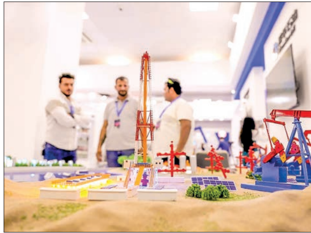
People visit a booth of a Chinese company during an oil expo in Baghdad, Iraq, on 9 September 2024.