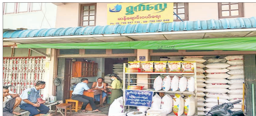
Market inspection in residential wards by the Consumer Affairs Department (Hinthada) and the combined team on 5 September 2024.

THE fair reference rice prices for September for 108 pounds/24 Pyi Shwe Bo Pawsan first grade is set at K150,000 per bag, according to the rice reference prices released by the Consumer Affairs Department, the Ministry of Commerce.