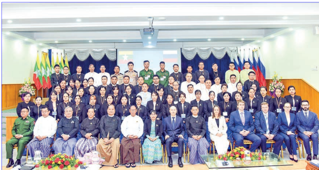
The commemorative group photo of the Legal Lecture of Russian Experts held yesterday in Nay Pyi Taw.