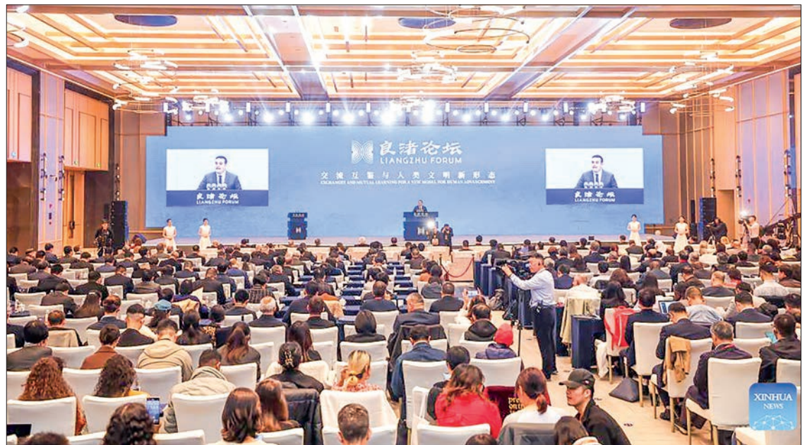
A guest speaks at the opening ceremony of the Second Liangzhu Forum in Hangzhou, east China's Zhejiang Province, 25 November 2024.