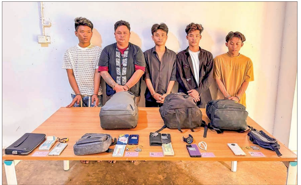
Phone scam offenders arrested with evidence used in fraudulent cases.

In August 2024, they cheated K700,000, K15.7 million in September, K5 million in October,