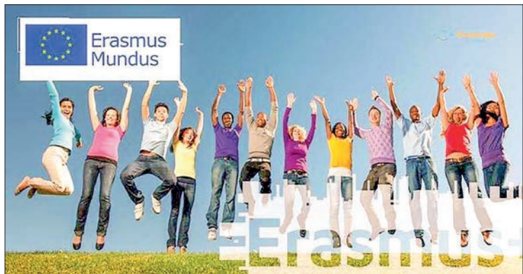
This image showcases the promotional activity of Erasmus Mundus Joint Master Degree.

APPLICATIONS for Erasmus Mundus Joint Master Degree (EMJMD) for the 2024-2025 academic year are welcomed, the Delegation of the European Union to Myanmar announced.