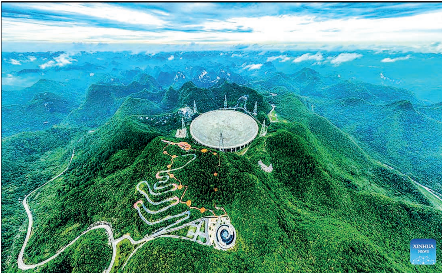
This aerial photo taken on 23 June 2023 shows China's Five-hundred-metre Aperture Spherical Radio Telescope (FAST) in southwest China's Guizhou Province.