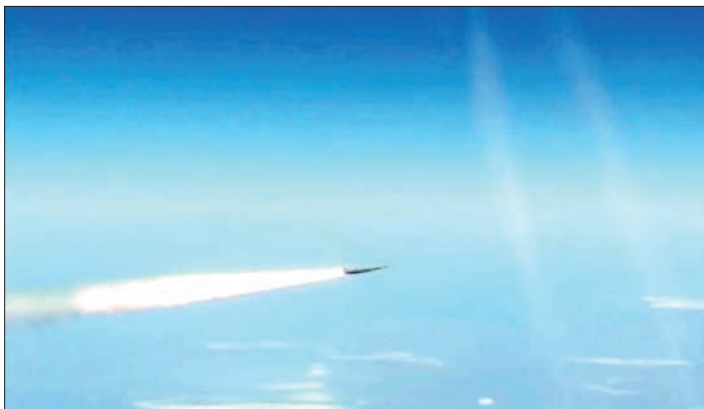
The launch of the Kinzhal air-launched ballistic missile. A screenshot from a video provided by the Russian Defence Ministry. The image is a handout courtesy of a third party.

"Of course, this is one of the options that has also been repeatedly mentioned. The appearance of such US systems in any region of the world will determine our next steps, including in the field of organizing a military and military-technical response," Ryabkov told reporters, answering the question whether Russia is considering the possibility of deploying medium-range and short-range