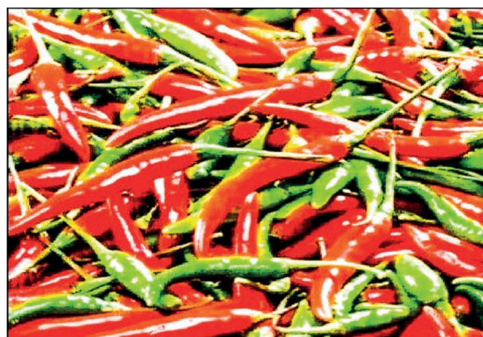
Photos show chilli and ginger in Shan State.