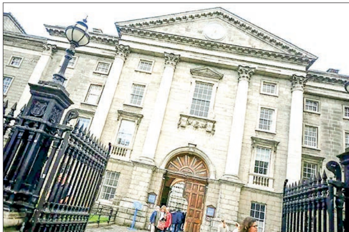
At Trinity College Dublin, young students say they are looking overseas for job opportunities.

Hill is not alone: seven out of 10 people aged between 18 and 24 are considering leaving Ireland due to a lack of professional opportunities, according to a survey by the National Youth Council of Ireland. — AFP