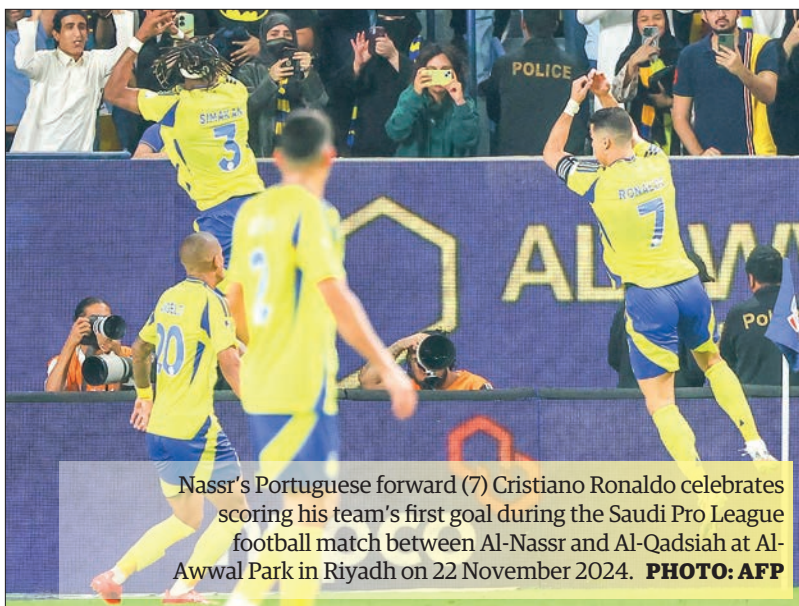
Nassr's Portuguese forward (7) Cristiano Ronaldo celebrates scoring his team's first goal during the Saudi Pro League football match between Al-Nassr and Al-Qadsiah at Al-Awwal Park in Riyadh on 22 November 2024.

However, the Portugal star finally opened the scoring little more than 50 seconds into the second half, when he headed home Sultan Al Ghannam's cross from close range. — AFP