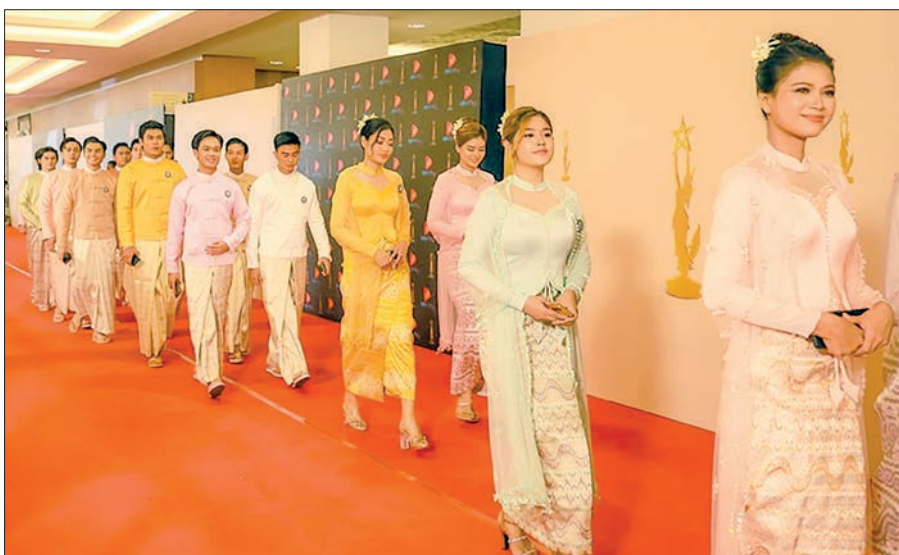
This image captures receptionists in the previous year.

THE Myanmar Motion Pictures Organization (MMPO) has begun inviting applicants to serve as receptionists for the upcoming Myanmar Film