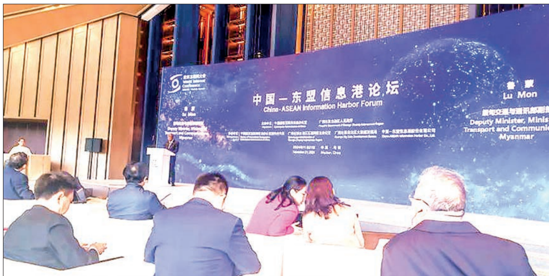
The China-ASEAN Information Harbour Forum in progress on 20-22 November in China.

During the visit, the deputy minister and delegation observed the booths of the Light Internet Expo, and attended the awarding ceremony of global youths, the opening ceremony of Global Elite Training of the World Internet Conference Digital Academy and "Construction of Trustworthy of Artificial Intelligence". — MNA/KTZH