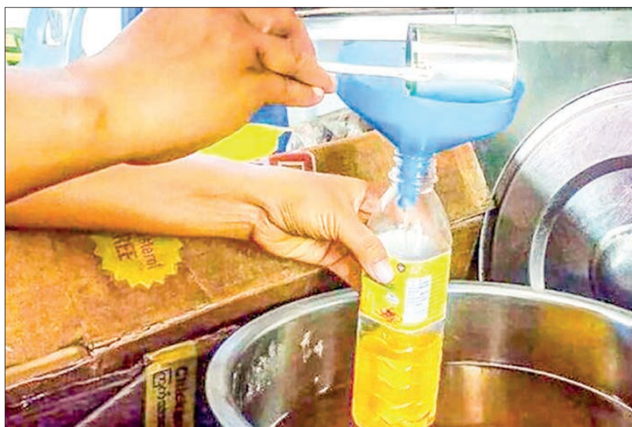
A vendor skilfully siphons cooking oil into a plastic bottle.

The Committee notified that any person who is involved in price gouging and oil storage to attempt market