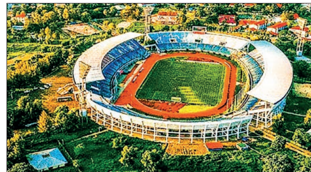
The Thuwunna Youth Training Centre to host Myanmar's home matches in the 2024 ASEAN Cup.

THE venues for the 2024 ASEAN Cup, the premier football tournament in the ASEAN region, have been officially announced. Scheduled from 8 December to 5 January, the competition will feature ten teams divided into two groups. Each team will play four group matches: two at home and two away.