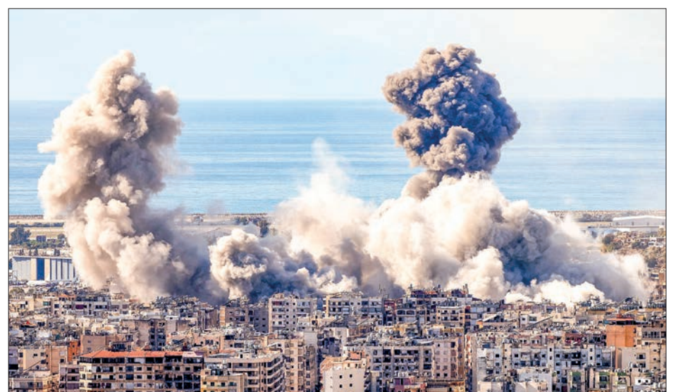
Smoke rises from the site of an Israeli airstrike that targeted Beirut's southern suburbs on 26 November 2024 amid the ongoing war between Israel and Hezbollah. PHOTO: AFP

AFPTV footage showed multiple plumes of smoke rising from the area, a day after the Lebanese health ministry said Israeli air strikes killed 31 people, mostly in southern Lebanon. — AFP