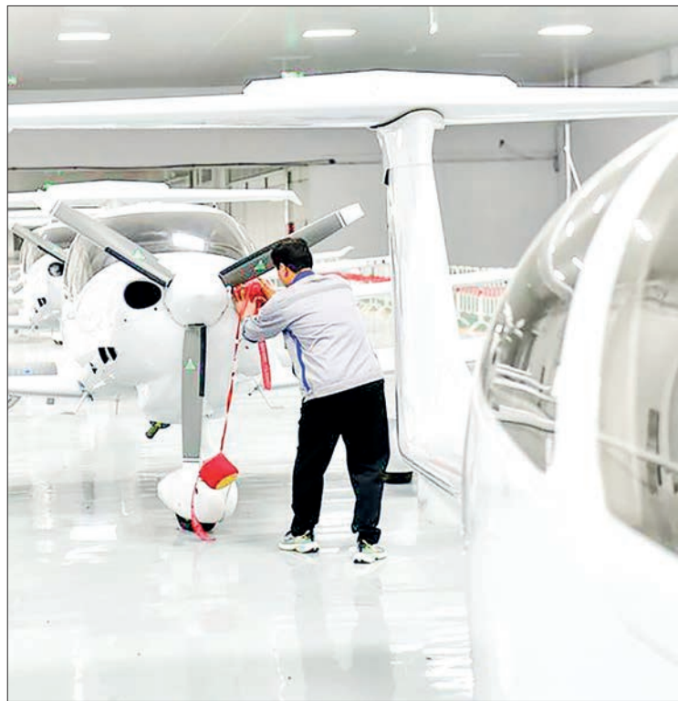
A staff member assembles an aircraft at a hangar of a high-tech industrial park in Binzhou, east China's Shandong Province, 9 October 2024.