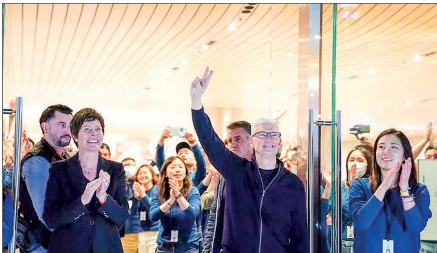
Apple CEO Tim Cook attends the opening of a new flagship Apple store in east China's Shanghai, 21 March 2024.

At the expo's main venue, Cook visited the joint booth of Apple's four Chinese suppliers, which will exhibit components and technologies involv-