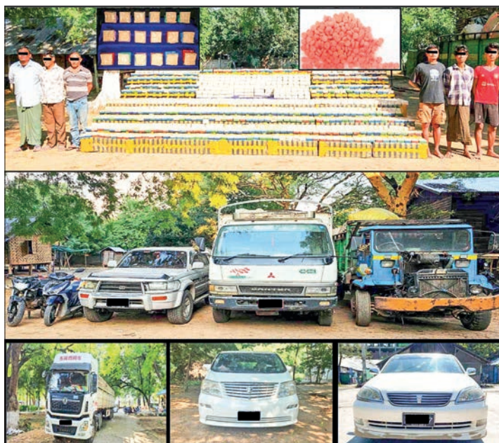
Arrestees are seen alongside confiscated drugs and vehicles.

On 19 November, Thet Wai Aung who instructed the transport of drugs from Yasauk to Ywar Ngan township was ar-