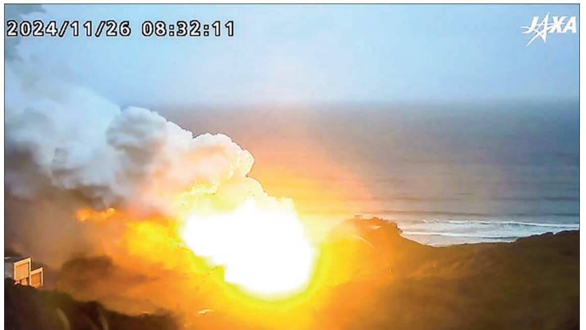
Screenshot from footage of live camera of the Japan Aerospace Exploration Agency shows fire at JAXA's Epsilon small rocket engine test facility at Tanegashima Space Centre in Kagoshima Prefecture on 26 November 2024.

JAXA is developing the Epsilon S as the successor to the current Epsilon series to enhance the country's competitiveness in the growing satellite launch market, but the continuous failures could potentially slow progress. — Kyodo