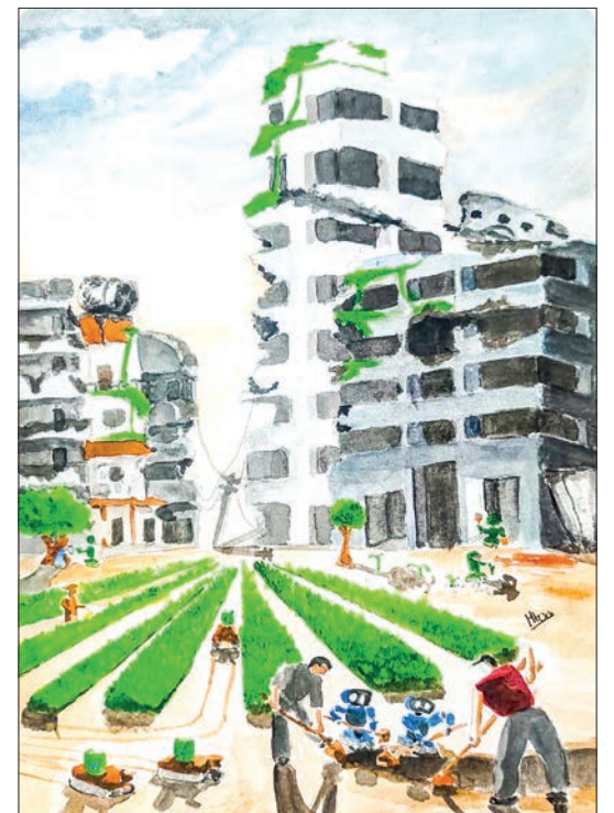
The first prize painting.

Over 52,000 students from 64 countries participated in the competition, divided into three age groups: 4 to 6, 7 to 12, and 13 to 18. Myanmar's students competed in the 7 to 12 and 13 to 18 categories under the supervision of the Myanmar-China Friendship Association