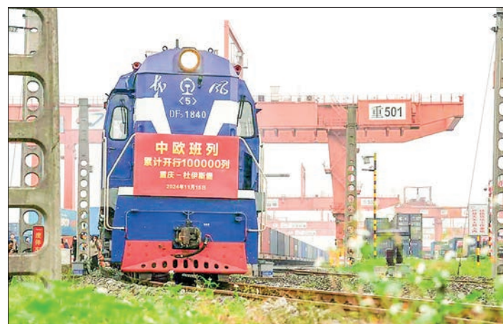
The 100,000 th China-Europe freight train, coded X8083, departs from the Tuanjiecun Station in Chongqing, southwest China, 15 November 2024.

EUROPEAN and Chinese businesses, along with relevant government departments, are preparing a wel-