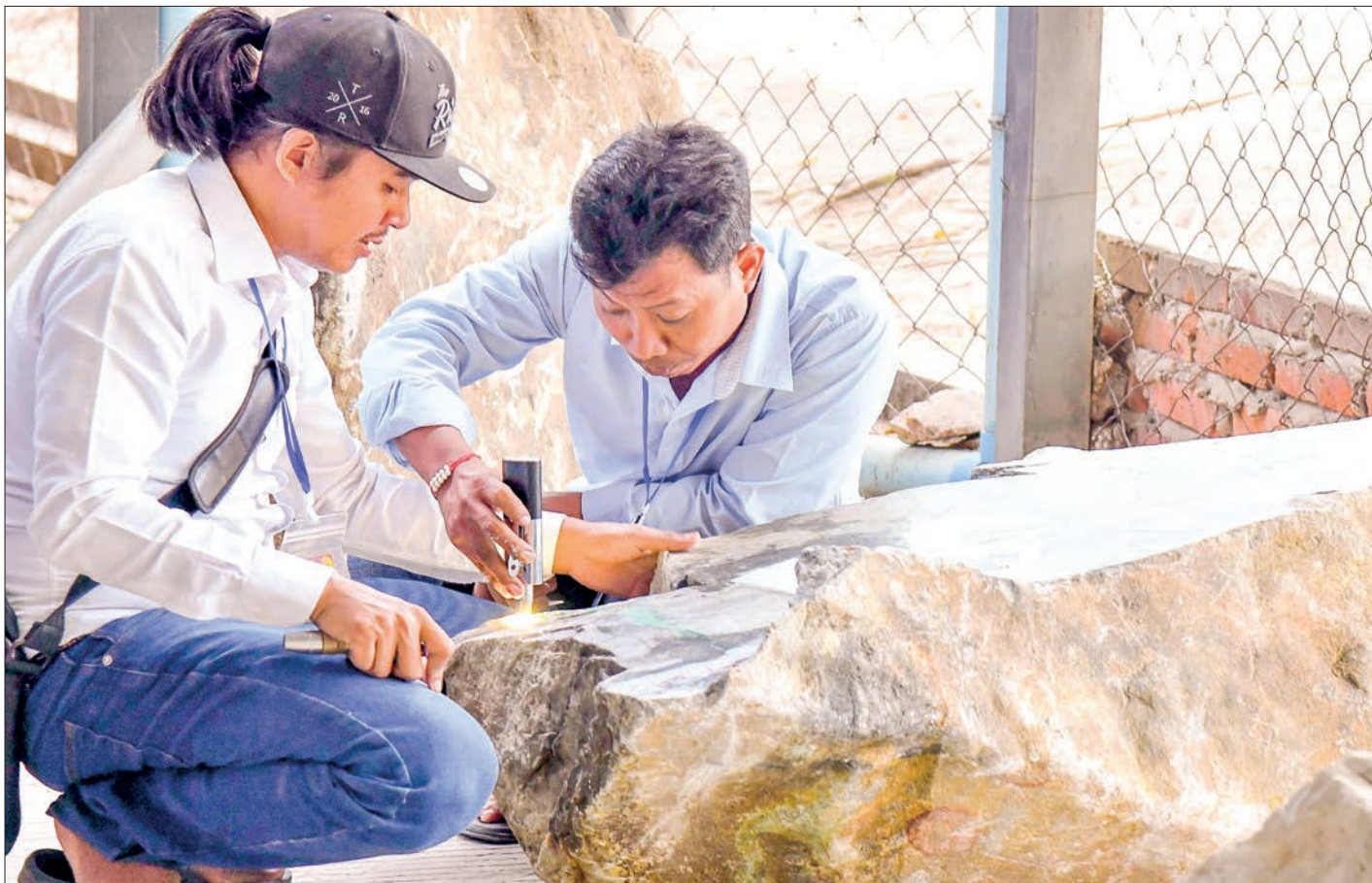
Gem traders keenly evaluate jade stones at the 2024 Mid-Year Gems Emporium.

The 2024 Mid-Year Gems Emporium is being held at the Maniyadana Jade Hall in Nay Pyi Taw from 18 to 27 November.