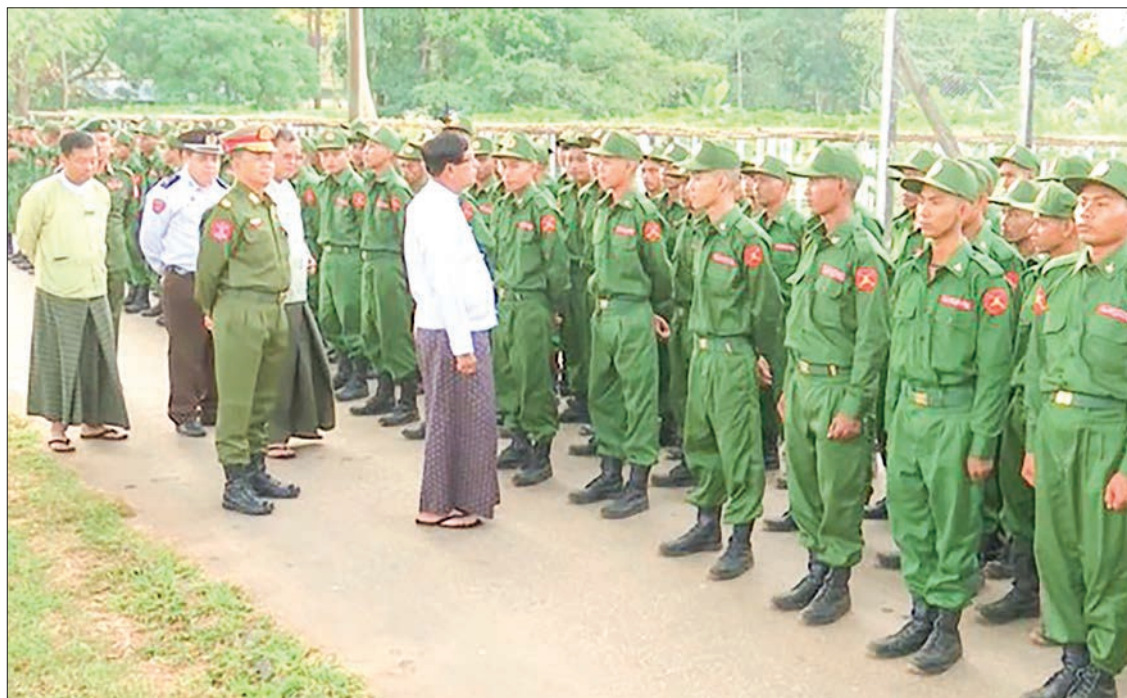
Officials greet the new trainees from Training 7 yesterday.

The People's Military Service Training Course, conducted under the National Defence Service Law, which came into force on 10 February 2024, aims to instil military knowledge and equip citizens with the ability to contribute to national defence and security responsibilities. The first course commenced on 8 April 2024. Graduates from the previous courses are now actively serving in their assigned units and formations, demonstrating unwavering commitment to protecting the nation's sovereignty and security. — MNA/KZL