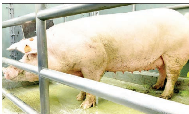
Photo shows a pig pregnant with genetically modified piglets.

A Japanese startup said Monday it will conduct clinical trials of pig kidney transplants to humans at two hospitals as early as 2028, which if successful would likely make them the first of their kind in the country.