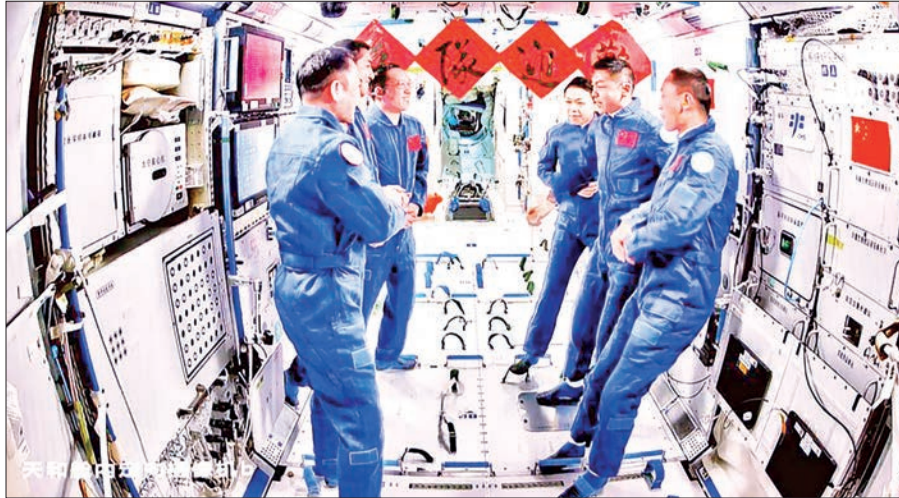
This image captured at Beijing Aerospace Control Centre on 25 May 2026 shows the crew of Shenzhou-21 and Shenzhou-23 spaceships talking with each other.

Over the past week, the crew has maintained a busy and productive