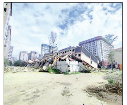
Images show the update following the demolition of the illicit seven-storey building.

controlled explosive demolition. Yesterday, one seven-storey building was demolished as part of the planned operation. So far, 66 illicit structures have been removed, with 11 remaining scheduled for demolition. — MNA/KTZH