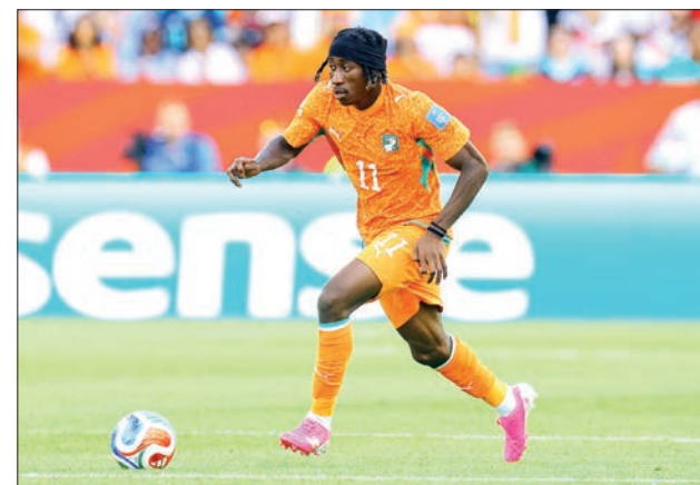
Yan Diomande (11) of Cote d'Ivoire runs with the ball during the FIFA World Cup 2026 Group E match between Germany and Cote D'Ivoire at Toronto Stadium on 20 June 2026 in Toronto, Ontario.

The Ramos deal is estimated at around 74 million euros ($84 million), the source stated, but could rise to 90 million euros with bonuses. The club did not respond when contacted by AFP. — AFP