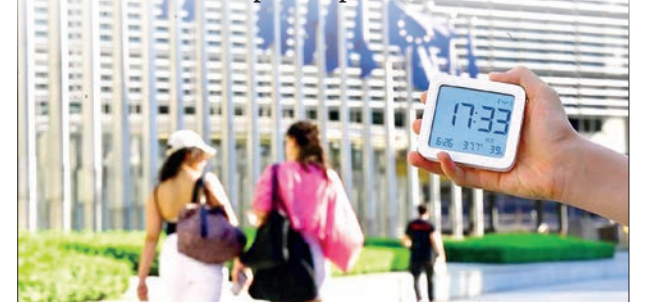
A thermometer shows temperature reaching 37 degrees Celsius outside the European Union headquarters in Brussels, Belgium, 26 June 2026.

To keep homes cool, the WHO advises using night air to cool down homes after dark, closing windows and covering them with blinds during the day when outdoor temperatures are higher than indoors, and turning off as many electrical devices as possible. — Xinhua