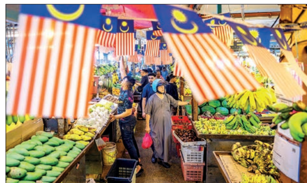
People browse for produce under Malaysian national flags at a fruit market in Kuala Lumpur on 28 April 2026.

Small and medium enterprises (SMEs) have been identified as highly vulnerable due to limited financial buffers, with cash flow pressures expected to intensify as input costs rise sharply, he said, adding that the government is working to ensure the security of essential goods, control the prices of basic goods and improve the efficiency of distribution channels in order to reduce the impact of price increases. — Xinhua