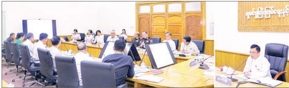
The Central Committee is conducting interviews and evaluations for PR applicants.

The Central Committee met the applicants who had already been verified,