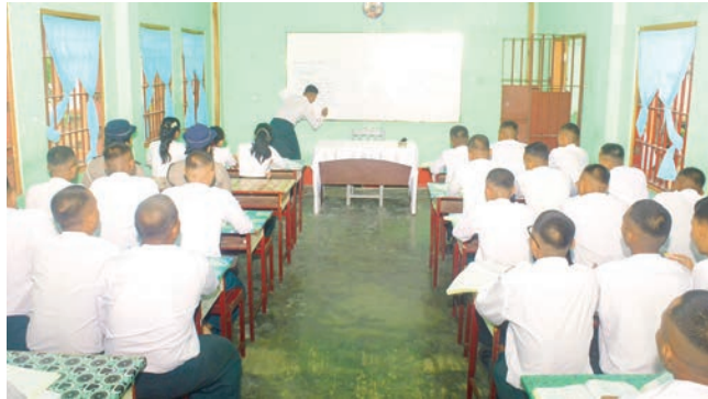
A learning class in the Insein Central Prison.