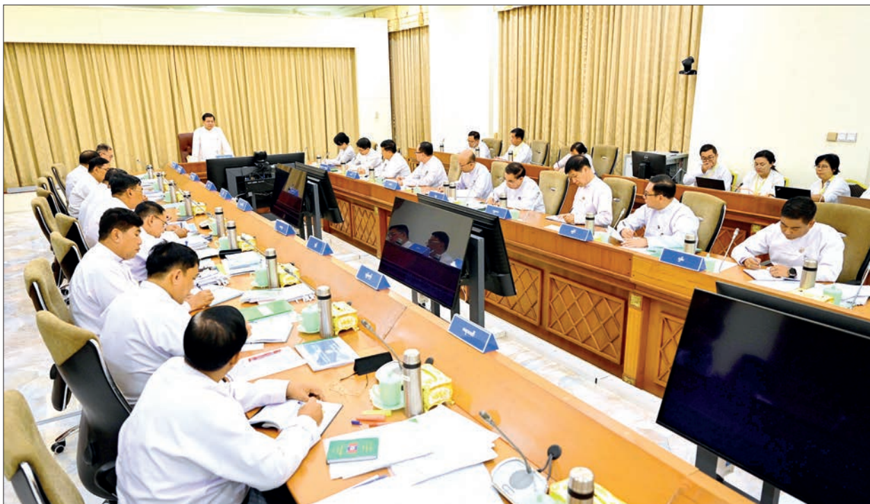
President U Min Aung Hlaing hosts meeting with the Nay Pyi Taw Council chairman, state and region chief ministers in Nay Pyi Taw yesterday.

Administrative bodies face an immediate mandate to crack down on unauthorized developments and restore public order under prevailing rules and regulations.