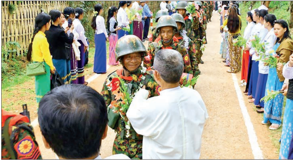
Triumphant Tatmadaw troops are pictured being warmly welcomed back in Shan State (South).

A ceremony was held yesterday at a local battalion in Loilem, Shan State (South) to warmly welcome back Tatmadaw frontline personnel who had successfully carried