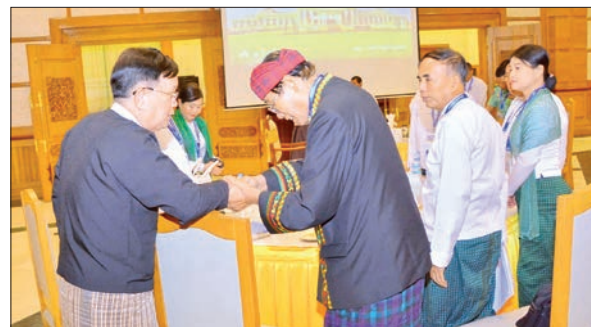
Pyidaungsu Hluttaw and Amyotha Hluttaw Speaker U Aung Lin Dwe meets Amyotha Hluttaw committees' chairpersons and secretaries yesterday.