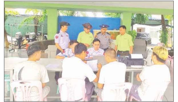
Immigration officials oversee the deportation of undocumented foreign immigrants.

Between 30 January 2025 and 29 June 2026, authorities detained 14,730 foreign nationals who had entered Myawady Township illegally. Of these, 13,553 have been deported via Thailand. Of the remaining 1,177, 662 are being prosecuted under immigration and drug laws, while the other 515 are awaiting transfer to their respective countries.