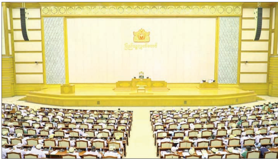
The 15 th -day meeting of the second regular session of the Third Pyithu Hluttaw is underway yesterday, presided over by Speaker U Khin Yi.

During the session, lawmakers also questioned union ministers