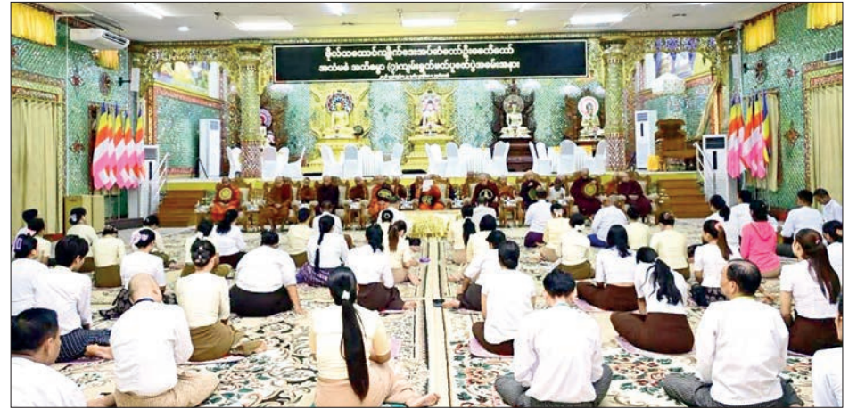
The ceremony of reciting Abhidhamma Pitaka in progress on the first Waso Full Moon Day.

Selected videos will be shown at a ceremony in commemoration of the World Tourism Day to be held on 27 September in Nay Pyi Taw. First prize is K1.5 million, second prize is K1.2 million, third prize is K1 million and each K300,000 will be presented to five consolation prizes. — TWA/ZS