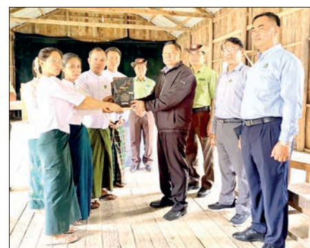
Deputy Minister U Myo Myint is pictured during his inspection tour of Tonzang.

He toured Tonzang by vehicle.