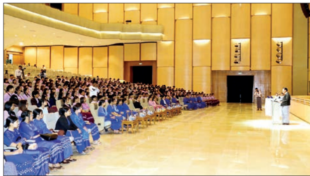
Pyithu Hluttaw Speaker U Khin Yi welcomes the Naypyitaw State Academy teachers and students yesterday.