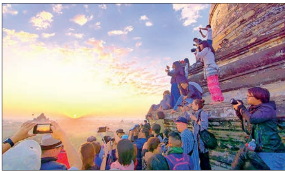
Visitors are seen awaiting to capture sunset in Bagan.

WITH the purpose of promoting Myanmar's tourism destinations and culture and heritage assets, a short video competition under the theme "Tourism Industry and Culture" will be organized, according to the Ministry of Hotels, Tourism and Culture.