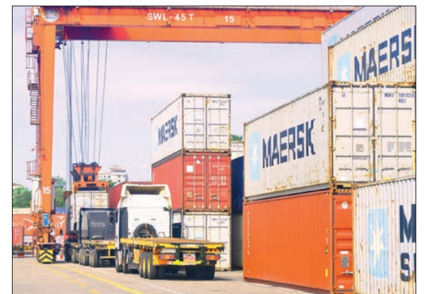
Cargo lorries and shipping containers jam transit lanes at Yangon Port as maritime trade volumes climb.

A total of 347 container vessels arrived at the Yangon Port in the first half of 2026, the Myanmar Port Authority announced.