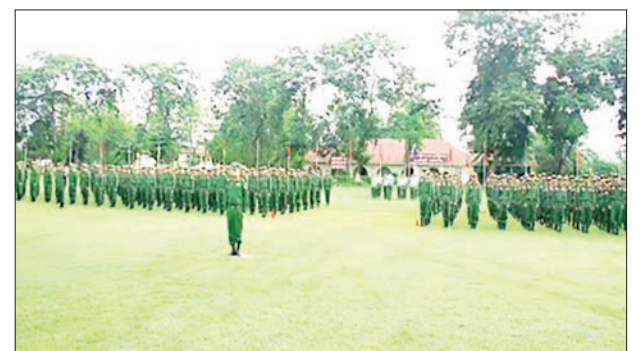
The launching ceremony for the People's Military Service Training 26 is underway in Taikkyi Township.

OPENING ceremonies for People's Military Service Training Batch 26 were held yesterday at training depots across