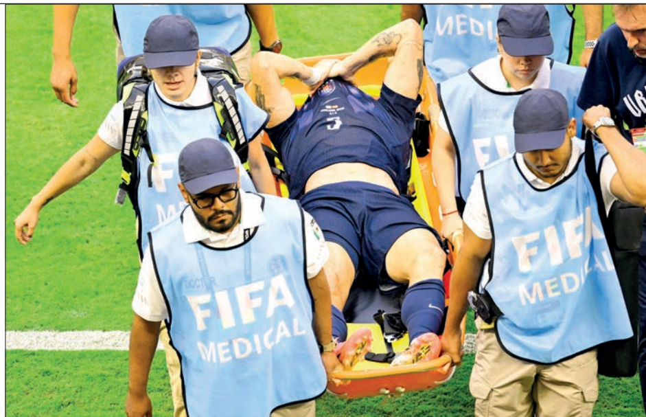
Uruguay's midfielder (5) Manuel Ugarte leaves the pitch after being injured during the 2026 World Cup Group H football match between Uruguay and Spain at the Guadalajara Stadium in Zapopan on 26 June 2026. PHOTO: AFP

Uruguay finished third in Group H behind Spain and Cabo Verde. — Xinhua