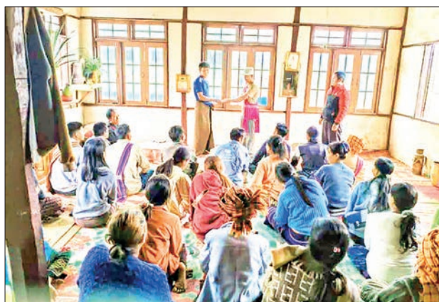
A MSY-fund disbursement ceremony is in progress in Pinlaung Township yesterday.