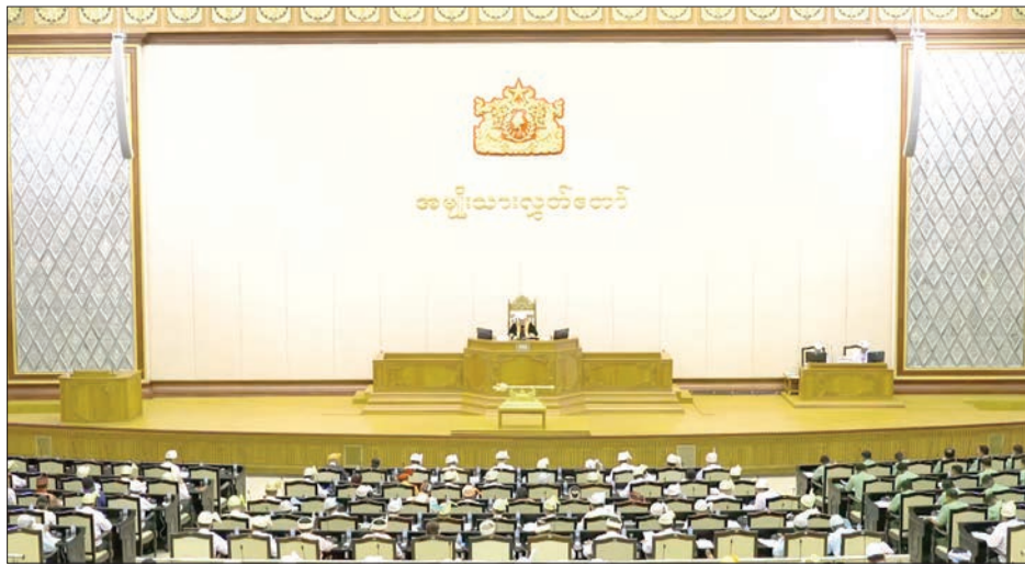
The 11 th -day meeting of the second regular session of the Third Amyotha Hluttaw is in progress yesterday, presided over by Speaker U Aung Lin Dwe.

Deputy Minister for Agriculture, Livestock and Irrigation U Bo Bo Kyaw replied to the questions raised by U Khin Maung Win from the Mandalay Region Constituency 1, saying that the Department of Agricultural Mechanization is selling agricultural machinery to farmers through a cash sales system at prices lower than market prices,