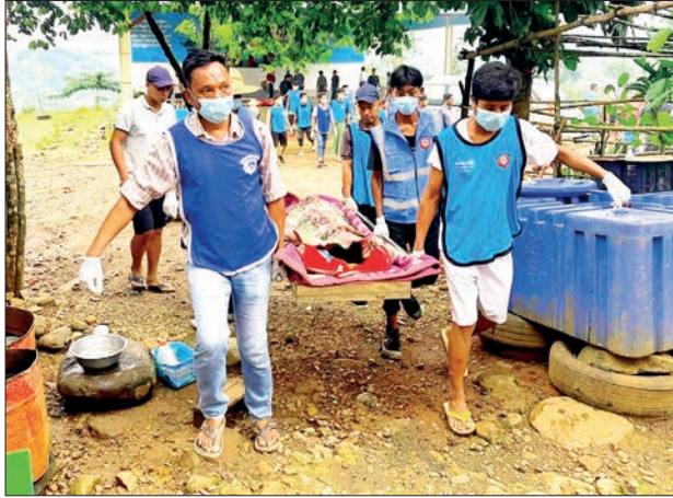
This photo shows bodies of the victims from the Namthmaw waste heap collapse being carried by rescue teams.

At least five people have been confirmed dead, and around 15 remain missing after a waste heap at a disused jade mining site collapsed near Namthmaw village in Hpakant Township, Kachin State, late on the night of 28 June, according to residents and rescue teams.