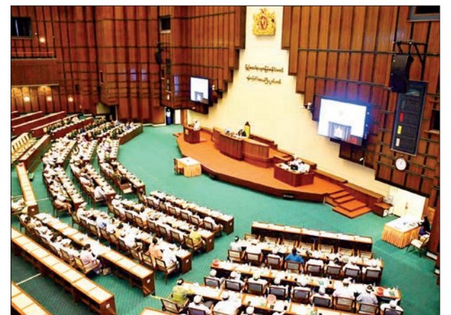
This photo captures the convening of the second regular session of the Third Yangon Region Hluttaw.