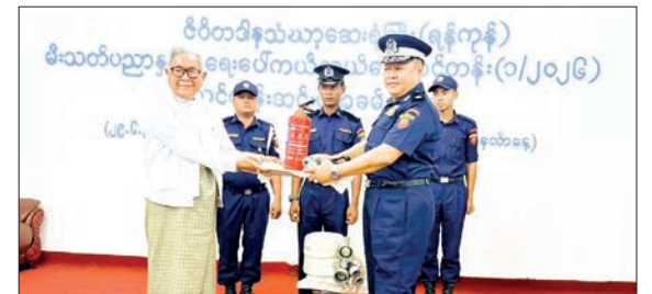
Donations of firefighting equipment are underway yesterday.

THE graduation ceremony for the Pre-Basic Firefighting and Emergency Rescue Training Course 1/2026, together with a donation of firefighting equipment, was held at Jivatadana Sangha Hospital in Bahan Township, Yangon Region, yesterday morning.