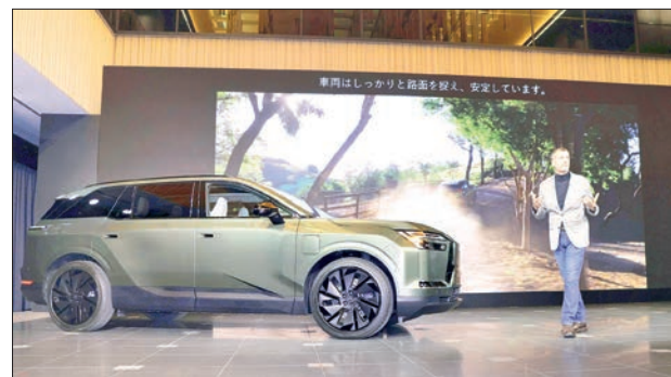
Toyota Motor Corp Chief Branding Officer Simon Humphries speaks during a media event in Toyota on 7 May 2026, unveiling the Lexus TZ all-electric luxury sport utility vehicle to the world.

Toyota's overseas output dropped 9.4 per cent to 514,882 vehicles, the first year-on-year decline in three months, while domestic output increased 3.7 per cent to 250,588 units, marking