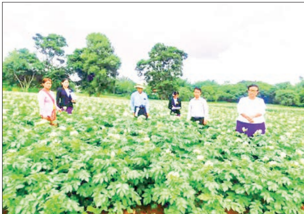
Officials inspect a village project in Pindaya Township.

In Watara Village, a total of K124.9 million in revolving funds has been disbursed to 130 project members engaged in agriculture, livestock breeding, and trading as the 13 th cycle of low-interest revolving loans. The funded activities are being successfully operated with support from the project funds to ensure increased household incomes. — Cho Than Nyunt (Rural)