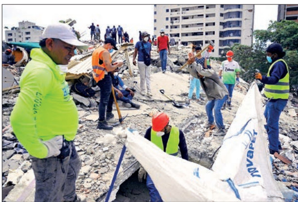
Rescuers and volunteers search for victims in Caraballeda, La Guaira State, Venezuela, on 28 June 2026 following twin earthquakes.

Russian President Vladimir Putin expressed condolences over the tragic aftermath of the devastating earthquake. Moscow said it was ready to provide assistance to Caracas. — SPUTNIK