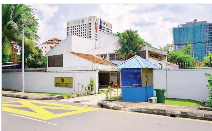
The Myanmar Embassy in Kuala Lumpur, Malaysia.

Detailed information and step-by-step instructions for passport applications can be found on the official Facebook page, "Myanmar Embassy in Kuala Lumpur, Malaysia," and the official website: https://myanmarembassykl.org .