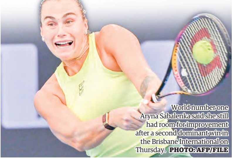
World number one Aryna Sabalenka said she still had room for improvement after a second dominant win in the Brisbane International on Thursday.

ka said she aimed to get better as she targets a third Australian Open title in four years when the first Grand Slam of the year begins in Melbourne on 18 January.