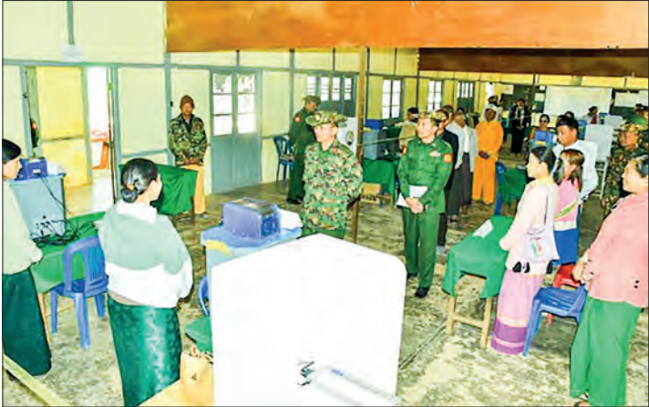
Officials inspect the preparation for the election’s second phase in the Pa-O Self-Administered Zone. for the electoral processes. The commanders and officials inspected the polling stations in Tangyan of Shan State (North), Hsihseng, Bang-

TO ensure the successful holding of Phase II of the 2025 multiparty democratic general election, the coordination meetings were held at the meeting halls of the General Administration Department of Hsihseng in the Pa-O Self-Administered Zone, Maukmai and Kunhing General Administration Departments in Shan State (South) yesterday. The relevant commanders, election subcommission officials, states, districts, townships’ levels election commission members and departmental officials attended the meetings. The commanders made remarks respectively, and the officials reported on their tasks