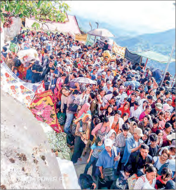
Photos above and right show crowds of pilgrims at the Kyaiktiyo Pagoda during the first week of January.

ACCORDING to the chairman of the Board of Trustees, more than 58,000 pilgrims from across the country visited Kyaiktiyo Pagoda in Mon State during the first week of January.