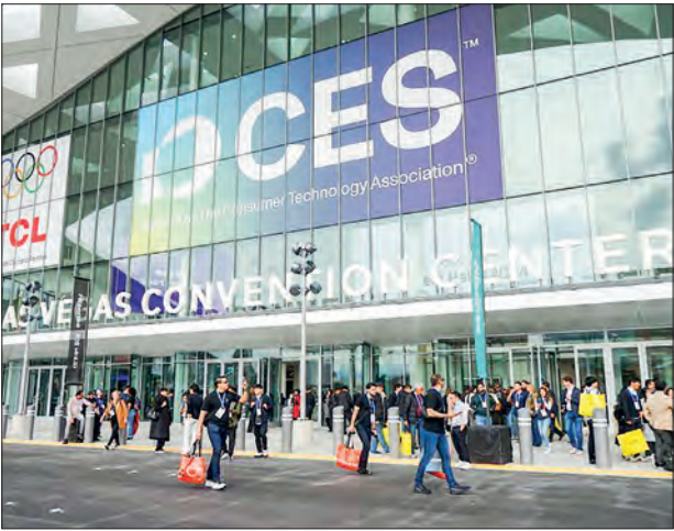
People visit the 2026 Consumer Electronics Show (CES) in Las Vegas, the United States, 6 January 2026.

TECH giants' CEOs and experts gathering here for the 2026 Consumer Electronics Show (CES) focused their discussions on the reliability and safety of artificial intelligence (AI) in a panel session on Monday. While AI is rapidly spreading into daily work and operations, its wider adoption will depend on whether AI systems can be trusted to behave reliably, protect sensitive data and operate within clear guardrails in high-stakes