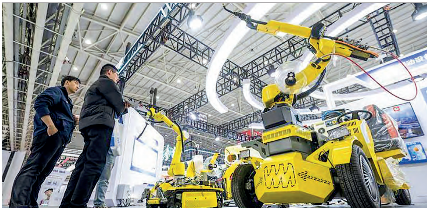
People learn about self-propelled welding robots at the 2025 Wuhan International Industrial Design Expo in Wuhan, Central China's Hubei province, 12 December 2025.

By 2027, the plan aims to integrate three to five general-purpose large AI models into manufacturing, while also developing specialized industry-specific models that cover the full range of applications.