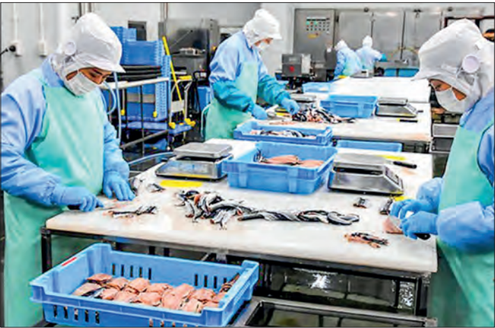
This photo shows Myanmar women workers at a workplace in Japan.

Currently, most job offers are for food manufacturing, restaurants and elderly care centres and skilled workers are much needed, said an official from an overseas employment agency.