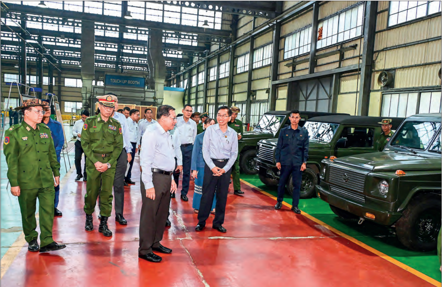
State Security and Peace Commission Chairman and Defence Services Commander-in-Chief Senior General Min Aung Hlaing is pictured during his inspection tour at the Tatmadaw Heavy Industry (Htonbo) in Bago Region yesterday.

In his response to the report, the Senior General said that Myanmar primarily relies on agriculture its main economic activity and it is necessary to take steps to further develop the agricultural sector of the nation. This includes boosting the production of agricultural machinery and equipment, ensuring the availability of skilled workers needed for industry’s operations, and conducting systematic research to ensure that manufactured machinery meets quality standards. It is also essential to provide food, living conditions, and welfare for