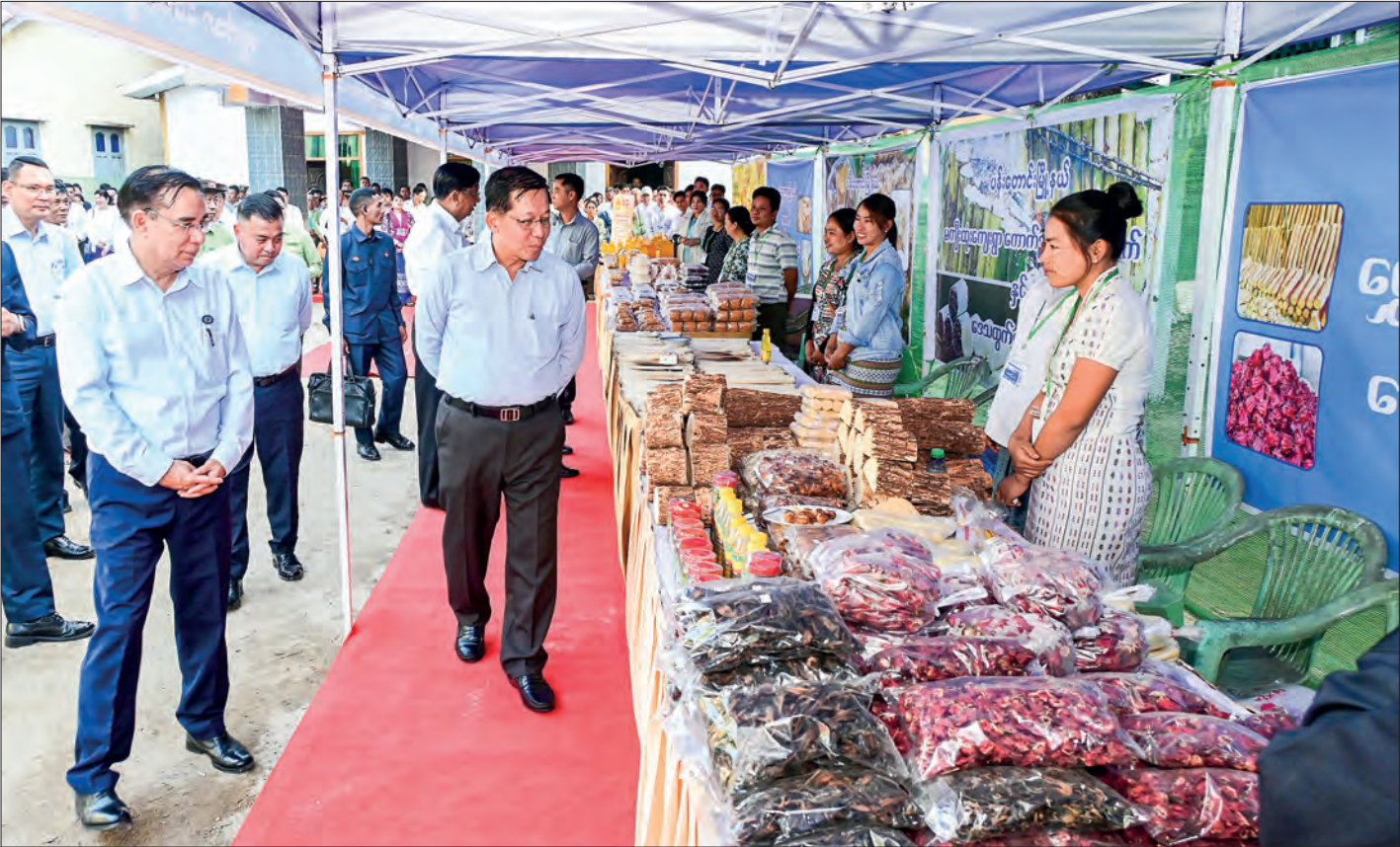
Acting President and State Security and Peace Commission Chairman Senior General Min Aung Hlaing explores the MSME products displayed at yesterday’s event in Padaung Township, Bago Region.

ARMED terrorists have been launching attacks by using residential homes and administrative buildings in towns and villages as cover, where they have forcibly settled. They aim to shield themselves from Tatmadaw counterattacks while also persuading temporarily displaced persons to return to their native areas and recruiting new members. That enables terrorists to use civilians as human shields. Tatmadaw is committed to safeguarding the sovereignty of the State and will respond to these threats based on intelligence and prevailing conditions. Therefore, residents in areas where terrorists have taken control must prioritize their safety and protect themselves from being exploited by these groups. (An excerpt from guidance given by Chairman of the State Administration Council, Prime Minister Senior General Min Aung Hlaing to Shan State cabinet members and state-level departmental officials on 3 September 2024)