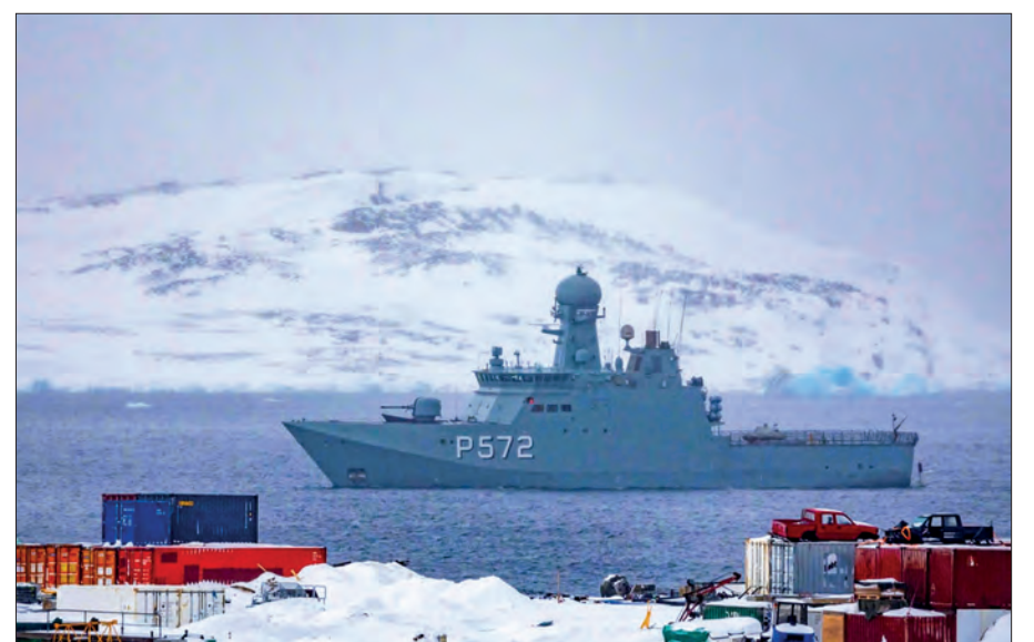
A Danish Navy vessel patrols the waters off Nuuk, the capital of Greenland, last March.

land did not signal an imminent invasion and that the White House's goal is to buy the island from Denmark, according to US media outlets. — Xinhua