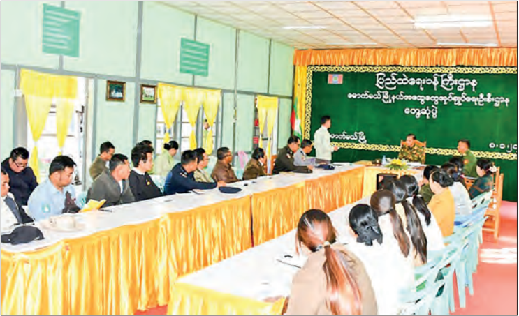
The meeting between the North-East Command commander and members of the People's Militia (local) in northern Shan State underway.

The commander remarked and heard the reports put forward by the members of the people's militia. He then provided foodstuffs and cash prizes to them.