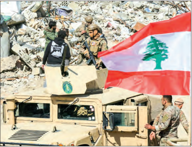
Lebanese army troops patrol the destroyed southern border village of Adaiseh, following the Israeli forces withdrawal on 18 February 2025.

Hezbollah has refused to surrender its weapons. In a statement, Lebanon's army said it had "achieved the objectives of the first phase" of its plan, covering the area south of the Litani River — around 30 kilometres (20 miles) from the Israeli border — with the intention to extend it to the rest of the country. — AFP