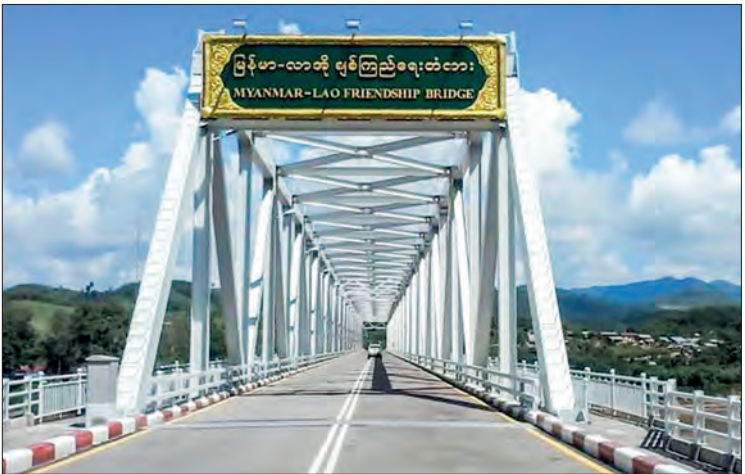
A general view of the Myanmar-Laos Friendship Bridge.

FORECAST FOR YANGON AND NEIGHBOURING AREA FOR 9 January 2026: A few cloud. — DMH