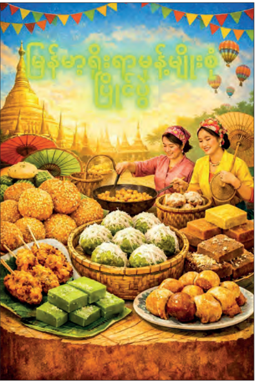
This image illustrates an informative poster regarding the upcoming Traditional Myanmar Snack Competition.

For each snack category, three finalists will be chosen. Following a health screening and