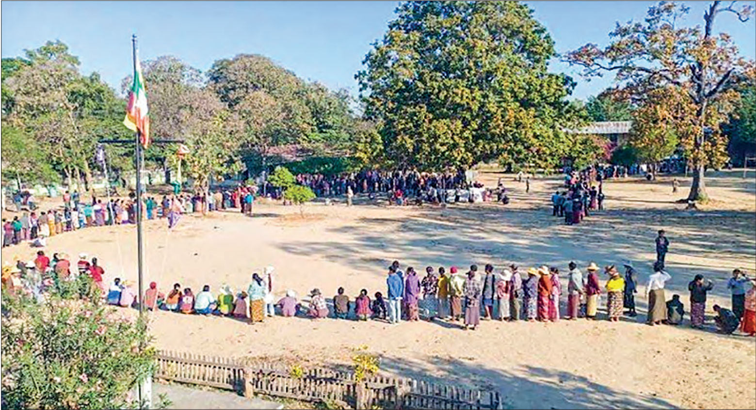
People are seen casting their ballots freely and peacefully.

Phase I of the 2025 Multiparty Democratic General Election began at 6 am on 28 December. As soon as the polling stations