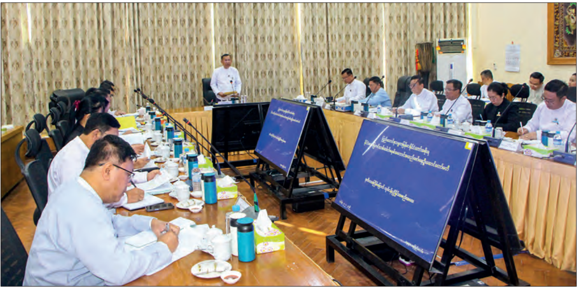
The work coordination meeting of the National Single Window Implementation is in progress yesterday, addressed by Union Minister Dr Kan Zaw.

THE work coordination meeting of the National Single Window Implementation was held yesterday at the Department of Internal Revenue, Office 46, and attended and addressed by Dr Kan Zaw, Committee Chairman, Union Minister for Finance and Revenue. At the meeting, the Union minister highlighted that Myanmar has been implementing the National Single Window to facilitate trade and free flows of goods in inter-ASEAN and globally. He noted that the National Single Window has to be implemented in line with the provisions of the General Annex to the Kyoto Protocol, as revised by the World Customs Organization, Trade Facilitation Agreement of the World Trade Organization, and ASEAN Trade in Goods Agreement. It