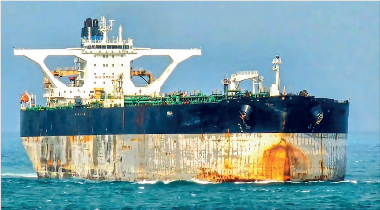
US authorities have repeatedly been informed about the Russian ownership of the Marinera vessel and its peaceful status.