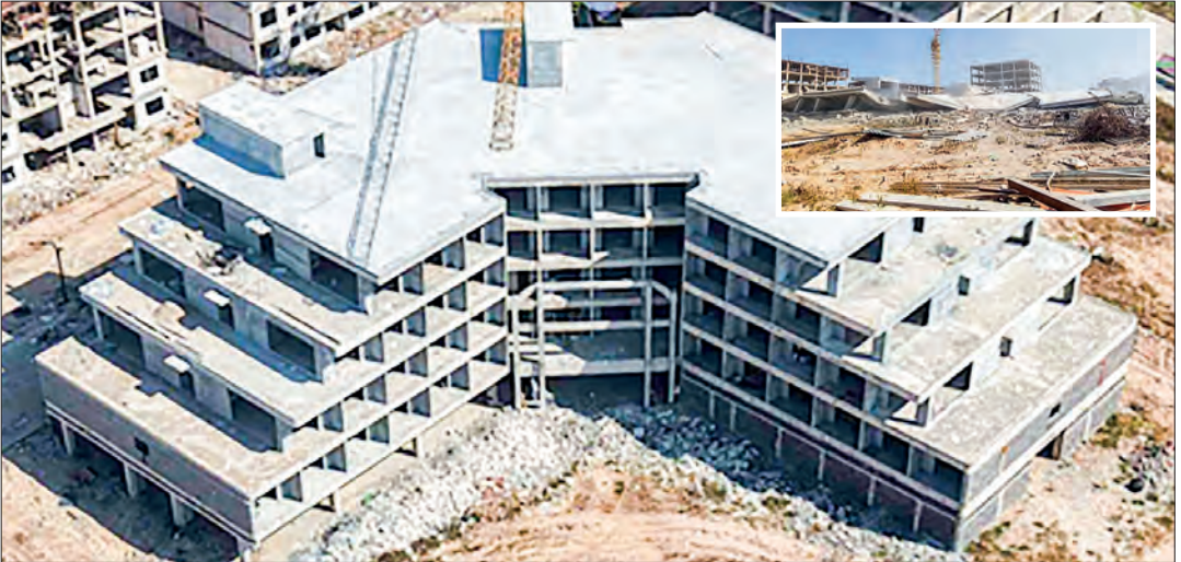
An illegally constructed five-storey flat is seen in the KK Park area Section II.

been destroyed, bringing the total number of demolished buildings in that section to 116. The government considers the eradication of telecom fraud and online gambling crimes a national responsibility and will continue its efforts, in coordination not only with domestic forces but also with the governments of neighbouring countries, to ensure that such activities can no longer operate within Myanmar. — MNA/MKKS