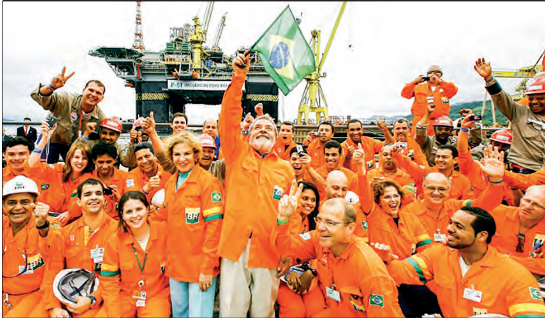
Left-wing president Luiz Inacio Lula da Silva (C) waved a national flag next to his wife Marisa Leticia, enthusiastically backing another oil project from state-owned Petrobras in 2008.