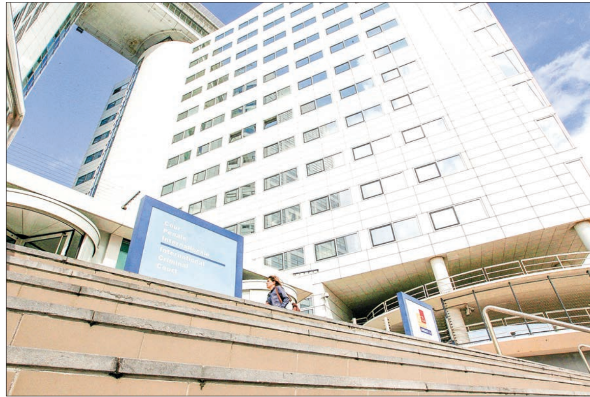
A picture taken on 5 September 2011 shows the International Criminal Court's building (ICC) in The Hague.

PEOPLE should know, and people should note.