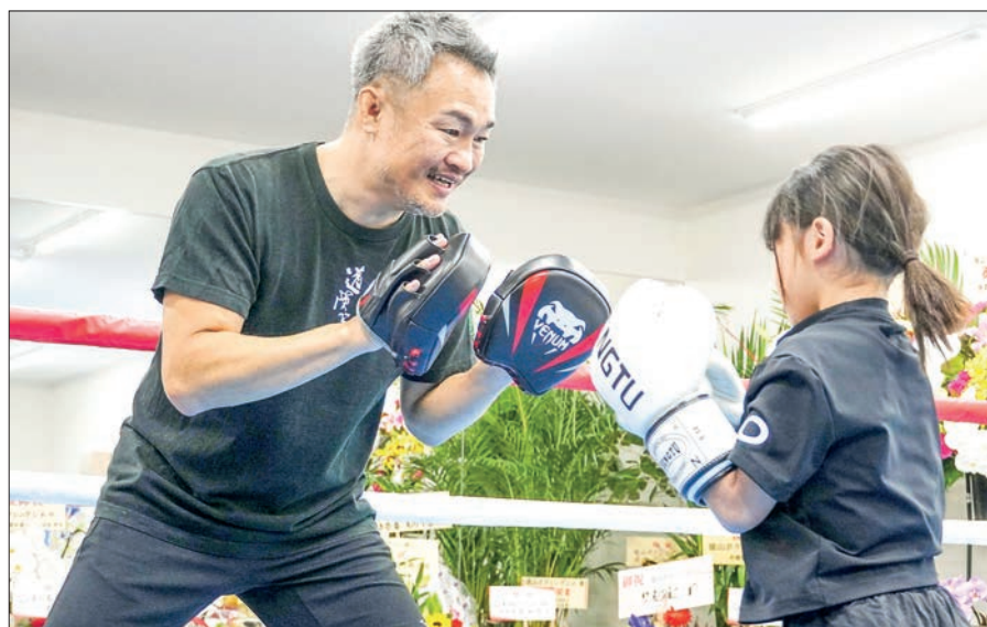
Former WBC super flyweight champion Masamori Tokuyama instructs a child at his boxing gym on 2 December 2024, in Higashiosaka, Osaka Prefecture.

FORMER WBC super flyweight champion Masamori Tokuyama opened a gym Monday in Higashiosaka, Osaka Prefecture, with the aim of developing