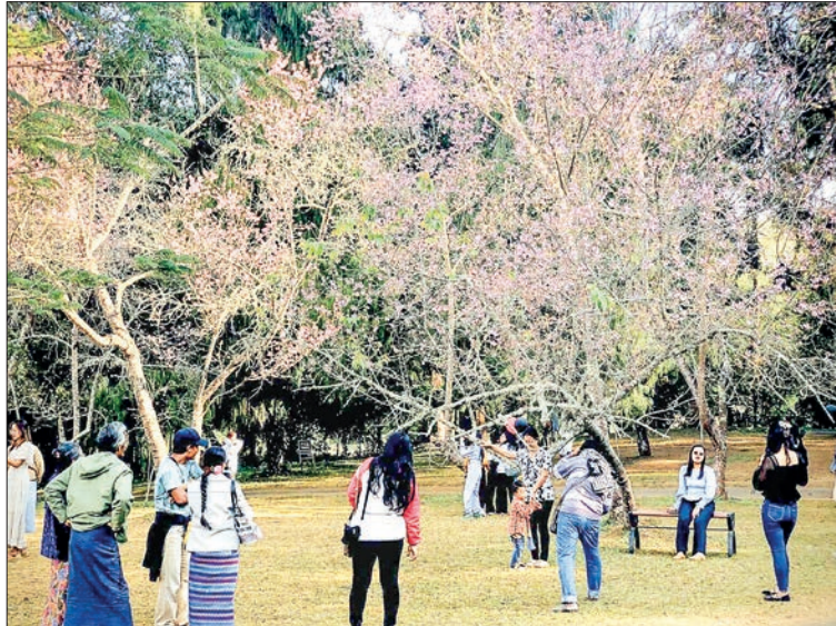
A glimpse of the National Kandawgyi Park, PyinOoLwin, set to hold the 17 th Flower Dreamland Festival.

The festival will feature eight exhibition zones, includ-