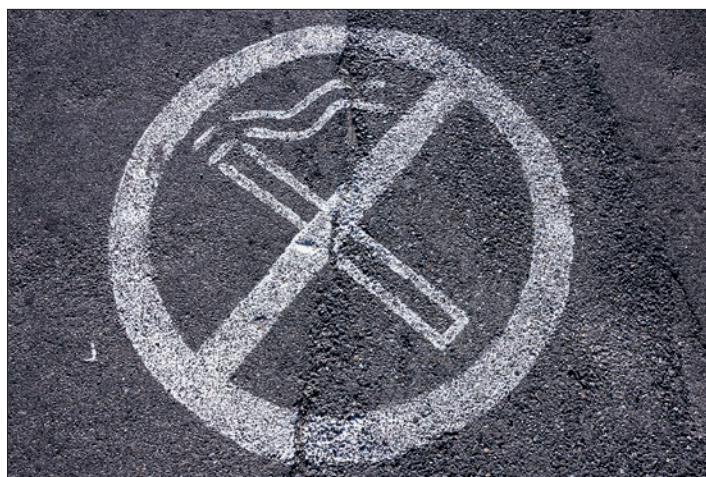
This photograph shows a no smoking sign on a pavement in Manosque, southern France, on 29 September 2024.

The recommendation would be non-binding, as health is a competence of individual mem-