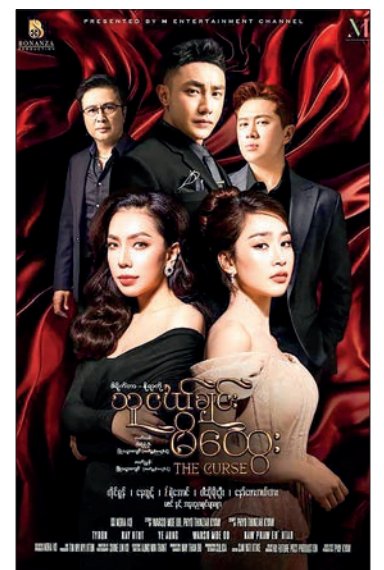
This photo reveals casts of the new TV series 'Thu Nge Chin Mi Htway' (The Curse).

The show will air at 7 pm every Saturday and Sunday on the M Entertainment channel and will also be available for streaming on the M Entertainment YouTube channel. — ASH/TRKM