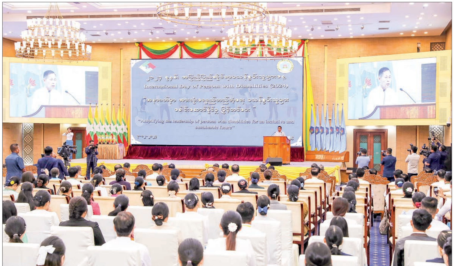
State Administration Council Vice-Chairman Deputy Prime Minister Vice-Senior General Soe Win speaks on the occasion to mark the 2024 International Day of Persons with Disabilities yesterday.

Among 8,200 million of world population, 16 per cent, over 1,300 million, are with disabilities. The 2019 interim census of Myanmar shows 5.9 million representing