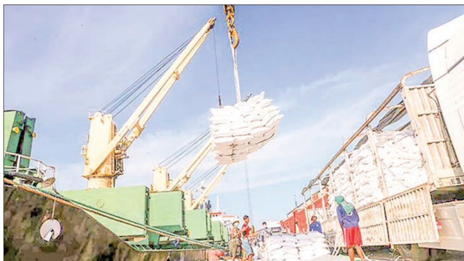
Export rice bags are being loaded onto the overseas-bound merchant vessel.

The Ministry of Commerce has been cooperating with departments and institutions concerned to achieve export targets and beyond, depending on the supply volume of rice, broken rice, puls-