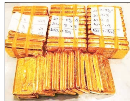
This photo showcases some gold ingots.

At present, gold testing machines will be imported to open a laboratory. Foreign expatriates will also be hired to handle those machines. — ASH/KK