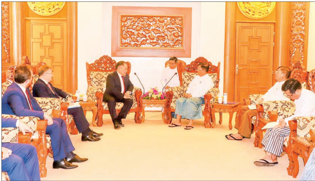
The Russian State Duma delegation calls on Deputy Prime Minister Union Foreign Affairs Minister U Than Swe yesterday.

DEPUTY Prime Minister and Union Minister for Foreign Affairs of the Republic of the Union of Myanmar U Than Swe received the Russian State Duma delegation led by Mr Sholban Kara-Ool, Deputy Chairman of the State Duma,