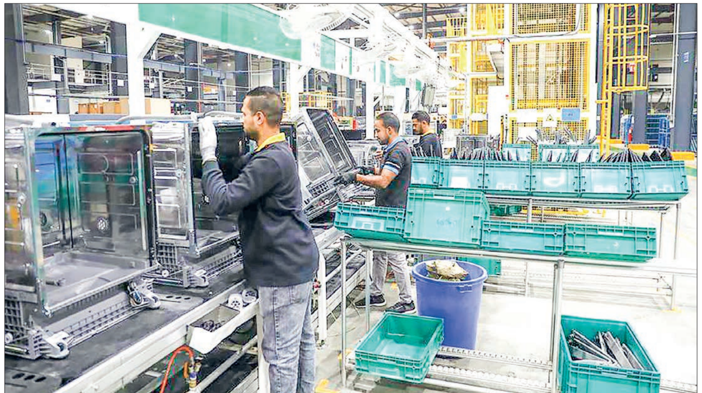
Staff members work on the dishwasher production line at a factory of Chinese home appliance manufacturer Midea at the China-Egypt TEDA Suez Economic and Trade Cooperation Zone in Ain Sokhna district of Suez province, Egypt, 6 November 2024.

Gaballah also highlighted the extensive reach of the initiative, under which over 150 countries and over 30 international organizations have signed cooperation documents with Beijing, and its implementation according to a