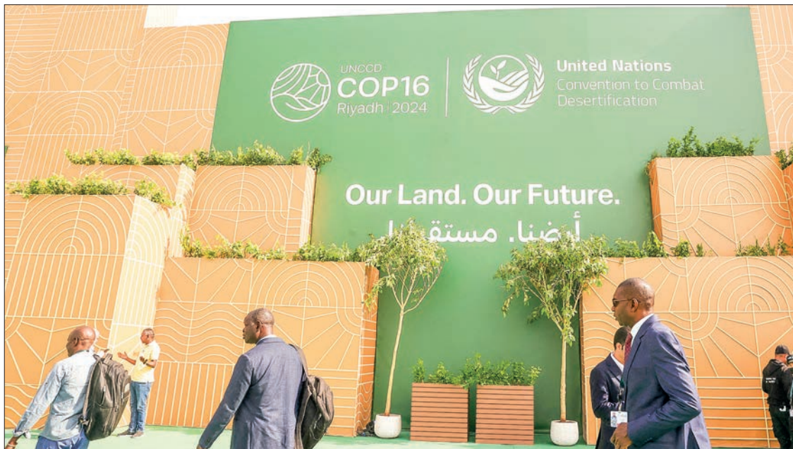
People walk around during the 16 th session of United Nations Convention to Combat Desertification, UNCCD COP16, in the Saudi capital Riyadh on 2 December 2024.

DROUGHT costs the world more than $300 billion each year, the United Nations warned Tuesday in a report published on the second day of international talks on desertification in Saudi Arabia.