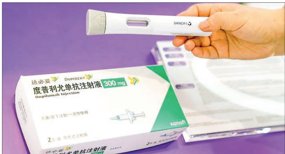
Star product Dupixent of Sanofi is on display during the seventh China International Import Expo (CIIE) in east China's Shanghai, 5 November 2024.

FRENCH pharma giant Sanofi will invest some 1 billion euros (about US$1.05 billion) to establish a new insulin production base in Beijing, according to the Beijing Economic-Technological Development Area (BDA).