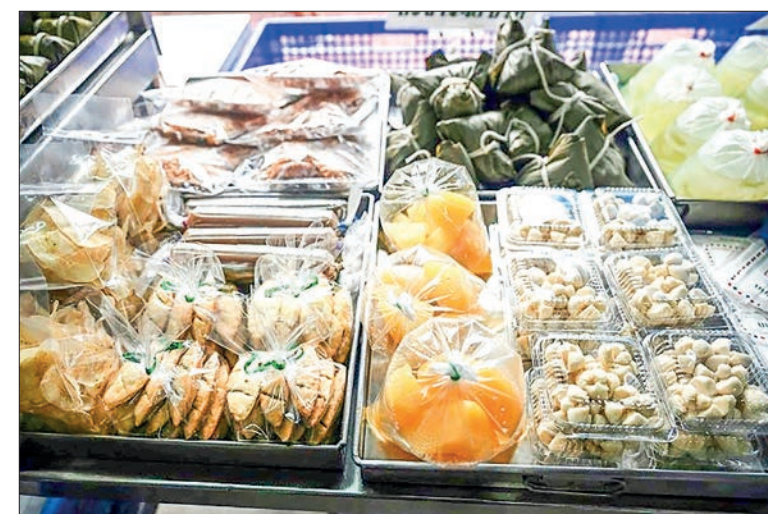
Microplastics and nanoplastics have been found in the human body — including inside lungs, blood and brains.

Near Smith-White's village Sarnia are factories run by industrial giants — Imperial Oil, Shell, Suncor Energy among others — handling chemicals needed to