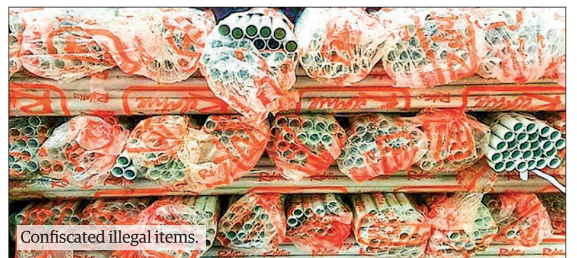
Confiscated illegal items.

Additionally, the combined teams conducted inspections and seized an unregistered Toyota Wish (worth approximately K15 million) at the Yadanabon bridge combined checkpoint in Sagaing Township, unregistered Toyota Crown and Toyota Alphard (estimated value of K22.5 million) in Kyaikmaraw Township, a Yutong bus (estimated value of 65 million) carrying