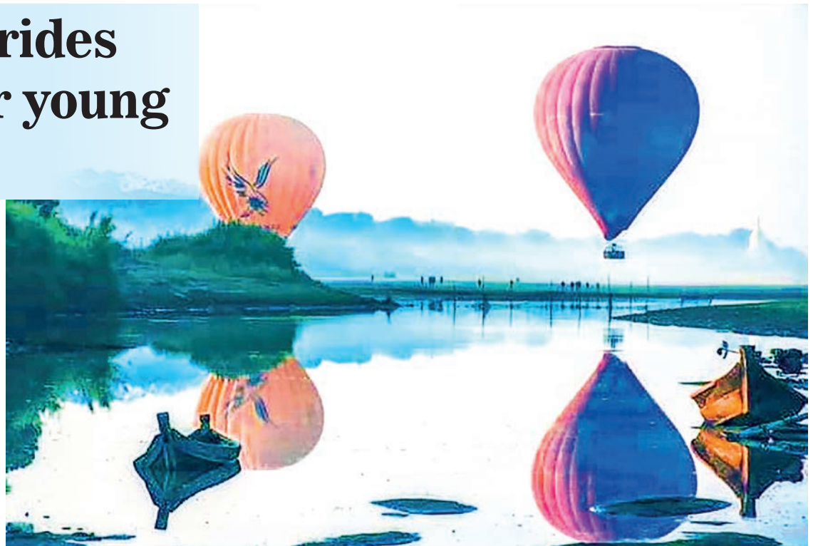
Photos showcase hot-air balloons in action at the Bagan Ancient Cultural Heritage Zone.

Hot-air ballooning is a major tourism attraction in many European and Asian countries, offering unique views of cities, mountains, gardens, and cultural heritage sites. These services significantly boost tourism rev-