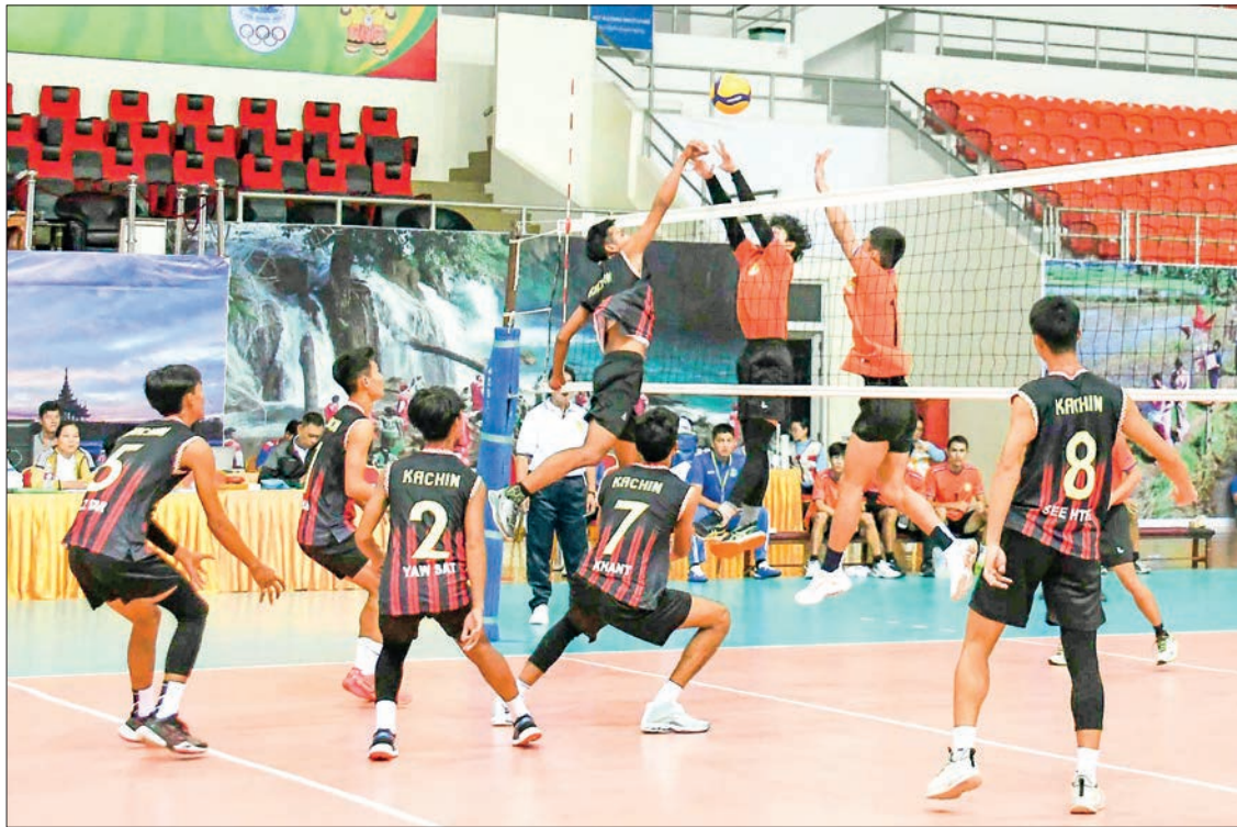
The group match of the Inter-State and Region Volleyball Tourney in action yesterday.

Similarly, men's futsal matches were held at Wunna Theikdi Futsal Stadium, where Shan State defeated Mon State 2-1. Sagaing Region and Magway Region each scored three goals in their respective matches, and Yangon Region overcame Nay Pyi Taw 4-0. Mandalay Region claimed a dominant 9-0 victory over Chin State, Kachin State defeated Kayah State 6-0, and Taninthayi Region edged Ayeyawady Region 3-1.