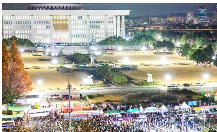
People gather outside the National Assembly in Seoul on 4 December 2024 after South Korea President Yoon Suk Yeol declared martial law.

“Just a moment ago, there was a demand from the National Assembly to lift the state of