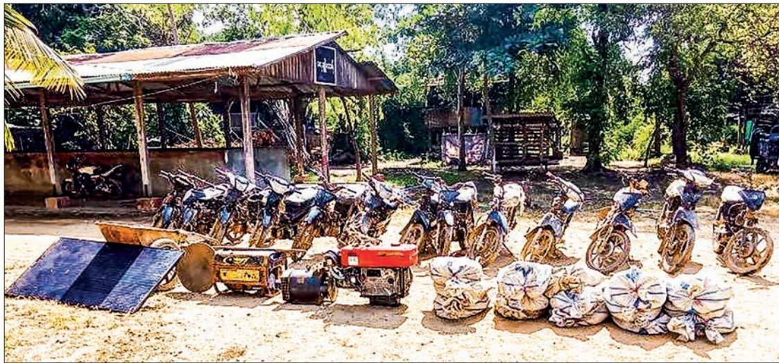
This photo reveals machines, motorbikes, and related items used by illicit gold miners being confiscated alongside arrestees in Moehti-Moemi near Thabyaybin village in Yamethin Township, Mandalay Region.

On 27 November 2024, a task force conducted an operation at Beckhoe Hill near Thabyaybin Village in the Moehti-Moemi area. The team discovered illegal gold mining operations and apprehended six individuals — U Zaw (son of U Htun Kyi), aged 52, from Kyu Taw Wa Village, Pyawbwe Township, and five others from Thabyaybin Village in Yamethin Township: Lwin Ko Naing (son of U Aye), aged