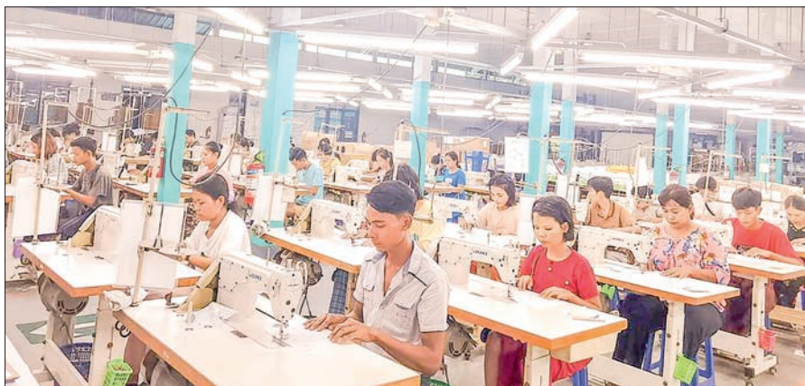
Trainees practising basic sewing machine operation in previous training.

Those who wish to attend the training can enrol through the contact num-