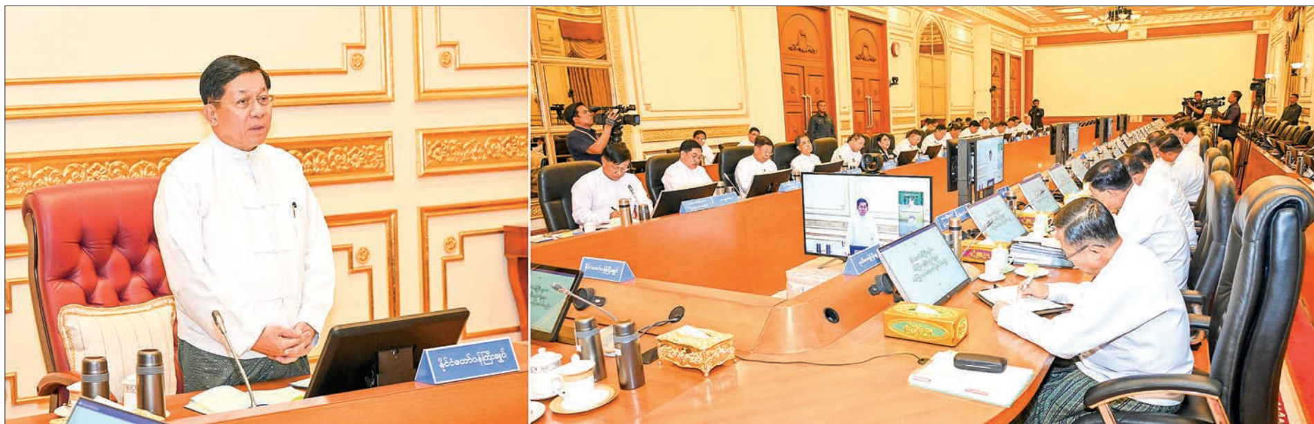
State Administration Council Chairman Prime Minister Senior General Min Aung Hlaing addresses the Union government meeting in Nay Pyi Taw yesterday.

The industries which cannot bring profit for the State may be halted through reviews and State-owned industries must be cost-effective.