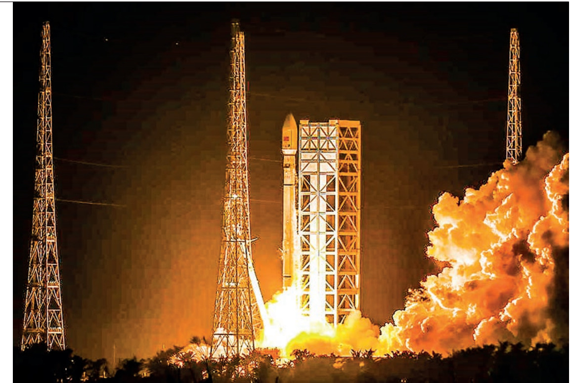
A Long March-12 carrier rocket carrying two experimental satellites blasts off from the Hainan commercial spacecraft launch site in the southern island province of Hainan, 30 November 2024.