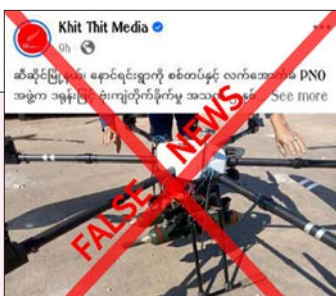
This screenshot reveals misinformation.