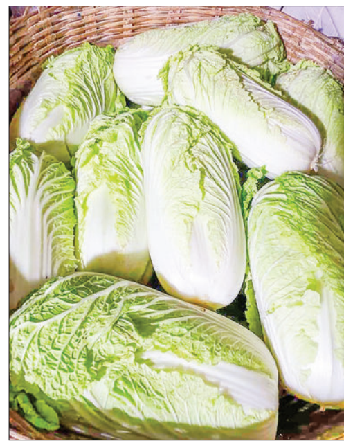
Chinese cabbages are displayed for sales at a market.

Although Chinese cabbage can be grown anywhere, it is primarily planted in areas with moderate climates. It is included in cabbage species and likes cold weather. Chinese cabbage is grown throughout the year in areas with moderate rain levels. — Thit Taw/ZS