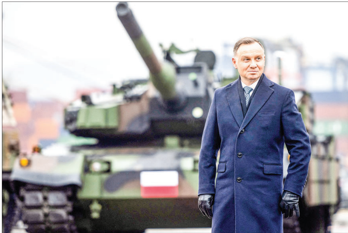
(FILES) Polish President Andrzej Duda attends the acceptance of the first South Korean K2 battle tanks and South Korean K9 howitzers for Poland in 6 December 2022 at the Baltic Container Terminal in Gdynia.

Duda spoke to the Polish media after a visit to New York, where he held meetings at the UN and discussed the war in