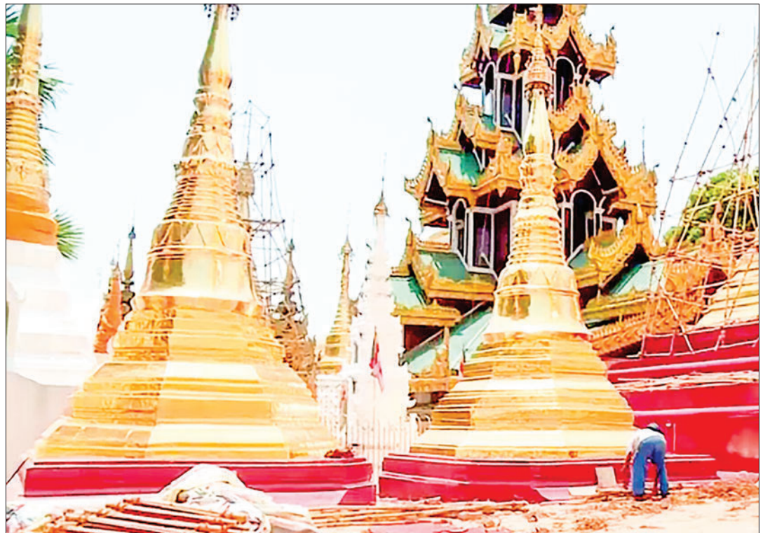
The photo shows maintenance works at Shwedagon Pagoda.