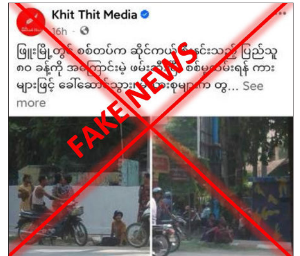
The screenshot validates false claims.

tions in towns and villages across Bago Region. Efforts are underway to raise awareness through State-owned media channels and newspapers in order to counteract the spread of fear and panic resulting from misinformation. — MNA/TKO