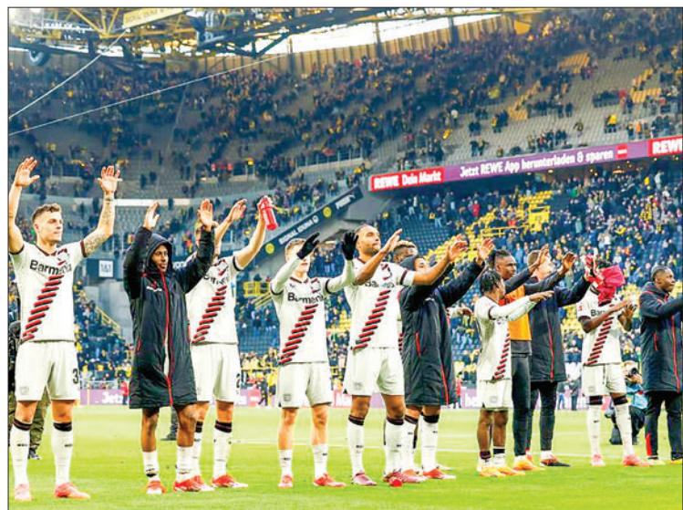
Players of Bayer 04 Leverkusen greet the spectators after the first division of Bundesliga football match between Borussia Dortmund and Bayer 04 Leverkusen in Dortmund, Germany, 21 April 2024.

Barcelona struck first after six minutes when Andriy Lunin flapped at a corner and Christensen outjumped Toni Kroos to make it 1-0. — Xinhua