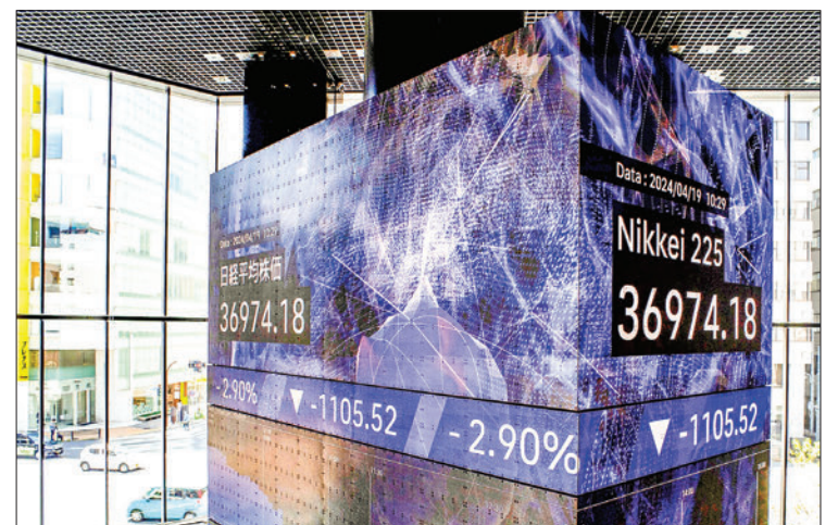
An electronic board displays a share price of the Nikkei index of the Tokyo Stock Exchange in Tokyo on 19 April 2024.

Investors are setting their sights on the personal consumption expenditures (PCE) index, the Federal Reserve's preferred gauge of inflation, which is due Friday. — AFP