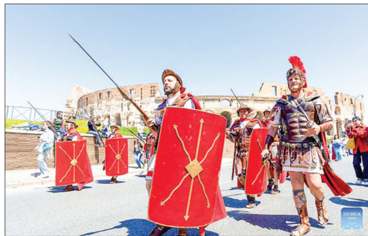
People take part in a parade to celebrate the 2,777 th birthday of Rome in Rome, capital of Italy, 21 April 2024. The city of Rome celebrated its 2,777 th birthday on Sunday with a weekend of historical re-enactments of ancient Roman rituals.

49-year-old project manager from Florida, the United States, said that discovering the day's festivities was a happy coincidence while on vacation in the city.