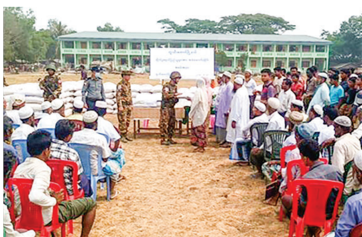
Temporarily displaced people seen receiving provision of rice on 12 April 2024.