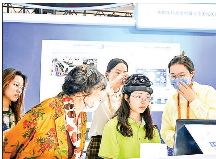
A visitor experiences domestic brain-computer interface system at the booth of Beijing Tiantan Hospital during the 2023 China International Fair for Trade in Services (CIFTIS) at Shougang Park in Beijing, capital of China, 5 September 2023.

The summit involves education officials, heads of teacher unions and teacher leaders from 18 delegations across Asia, Europe, North America and Oceania. The delegates will visit Singapore's primary and secondary schools, institutes of higher learning and other training institutions during the event. — Xinhua