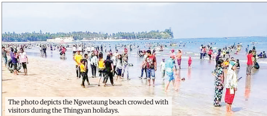
The photo depicts the Ngwetaung beach crowded with visitors during the Thingyan holidays.