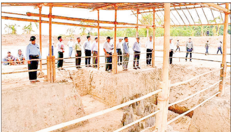
Officials inspect the site where the ancient elephant enclosure of the Hanthawady era was unearthed.

Moreover, he also suggested the creation of trips for the public to visit this destination after coordinating with the Directorate of Hotels and Tourism.