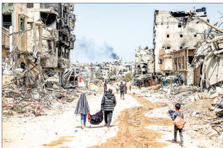
People walk with salvaged items past destroyed buildings in Khan Yunis in the southern Gaza Strip on 22 April 2024 amid the ongoing conflict in the Palestinian territory between Israel and the militant group Hamas.

ISRAEL'S military intelligence chief has resigned after taking responsibility for failures leading to the Hamas attack on 7 October, the military said on Monday, as Israel carried out more shelling in war-battered Gaza overnight.