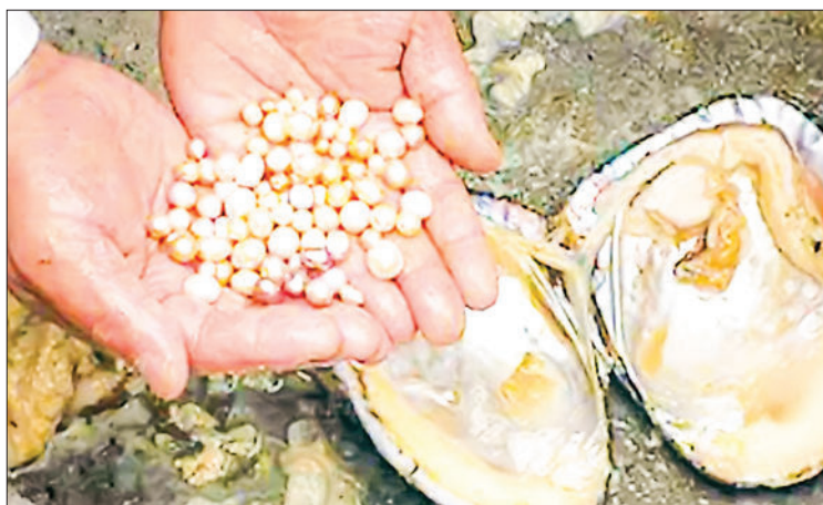
A glimpse of Myanmar's pearls.