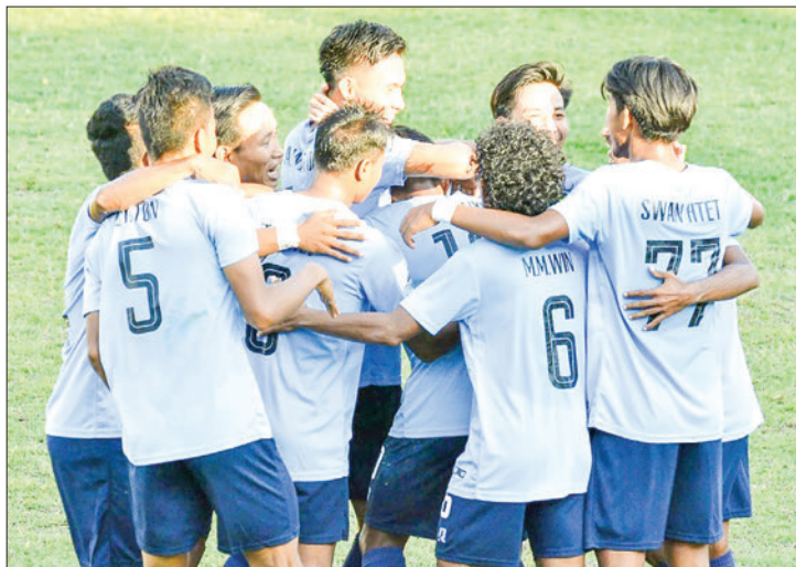
The photo depicts players from Dagon Star United, which leads Group-C of the MNL Cup 2024 with four wins.

On 26 April, Rainbow FC will meet with Shan United at Padonma Stadium and Rakhine United will play with Glory Goal FC at Thuwunna Stadium.