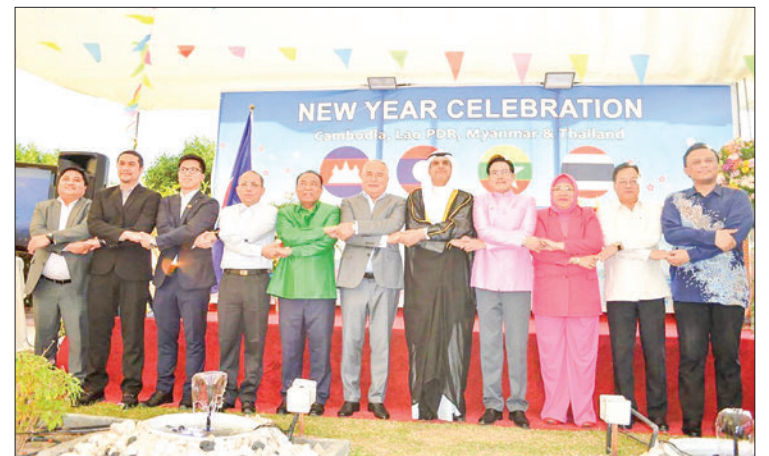
Guests attending the New Year Maha Thingyan Festival organized and held by four countries in Kuwait.