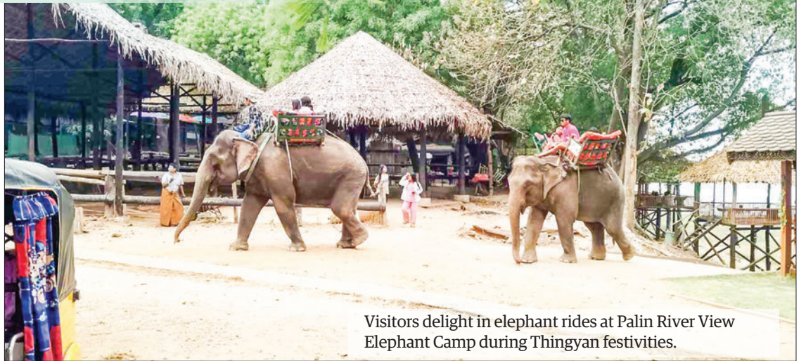
Visitors delight in elephant rides at Palin River View Elephant Camp during Thingyan festivities.

Of the visitors during Thingyan, 1,320 were either clergy members or children under the age of ten who could enjoy the camp's attractions free of charge.