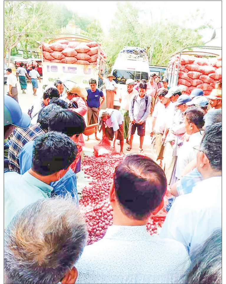
The photo shows the Pakokku onion market on 22 April.

Onions are arriving in the market in large numbers after the Thingyan Festival, and prices in Yangon and other cities and towns are higher than in previous years. — TWA/TMT