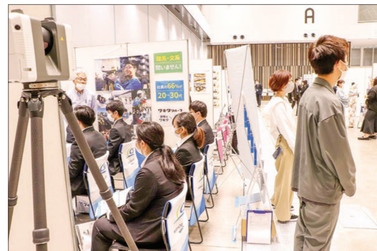
Job fairs are held across Japan, kicking off the job-hunting season for students graduating from universities.