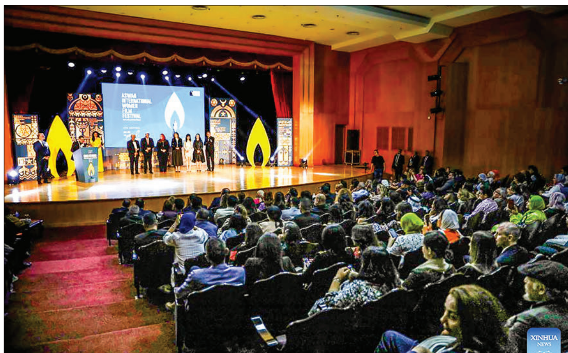
Guests attend the opening ceremony of the eighth edition of the Aswan International Women Film Festival (AIWFF) in Aswan, Egypt, 20 April 2024. The eighth edition of AIWFF opened Saturday night in Egypt's city of Aswan by the Nile River with a red-carpet ceremony.

"The AIWFF is the first festival with a specialized programme of filmmaking workshops for the youth in the region, led by industry profes-