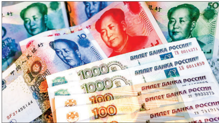
Rubles and yuans.

“Russian-Chinese trade and economic cooperation is actively developing, and this is despite the persistent attempts of the states of the collective West to put sticks