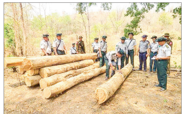
Officials inspect confiscated teak logs in Bago Region.

The Illegal Trade Eradication Steering Committee reported seven arrests made on 22 April, with an estimated value of K84.318 million. — MNA/MKKS