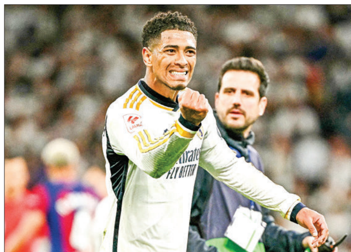
Real Madrid's English midfielder (5) Jude Bellingham celebrates victory at the end of the Spanish league football match between Real Madrid CF and FC Barcelona at the Santiago Bernabeu stadium in Madrid on 21 April 2024. Real Madrid won 3-2.

Inoue won his fourth last July, knocking out American Stephen Fulton for the WBC and WBO super bantamweight titles. — Kyodo