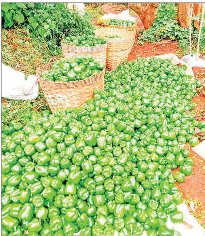
Harvested bell peppers from the fields in Pindaya Township.

Primarily grown as a vegetable mixed with another in multiple cropping and locally called paprika or sweet pep-