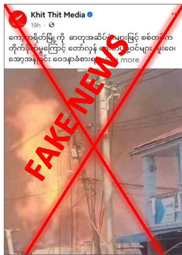
The screenshot validates misinformation.

Subversive media outlets spread fake news on social media to impose threats among the public and mislead the people about Tatmadaw. — MNA/KTZH