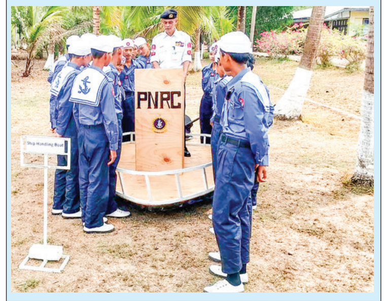
Photos (from above and right from top to down) showcase course learning, documentary photo, and activities for basic and advanced maritime youth trainees yesterday.