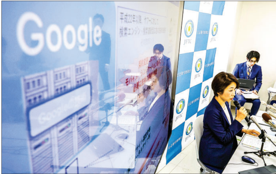
An official of the Japan Fair Trade Commission holds a press briefing in Tokyo on 22 April 2024.

JAPAN'S antitrust watchdog said Monday it has asked Google LLC to voluntarily reform its business practices after finding that it imposed unfair restrictions in its search advertising agreement