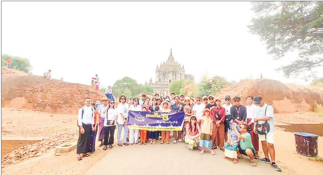
The photo shows some travellers visiting Bagan and Mount Popa in Thingyan.

A massive influx of visitors to Bagan was seen in Thingyan, and the number seemed larger than last year, according to residents and some visitors.