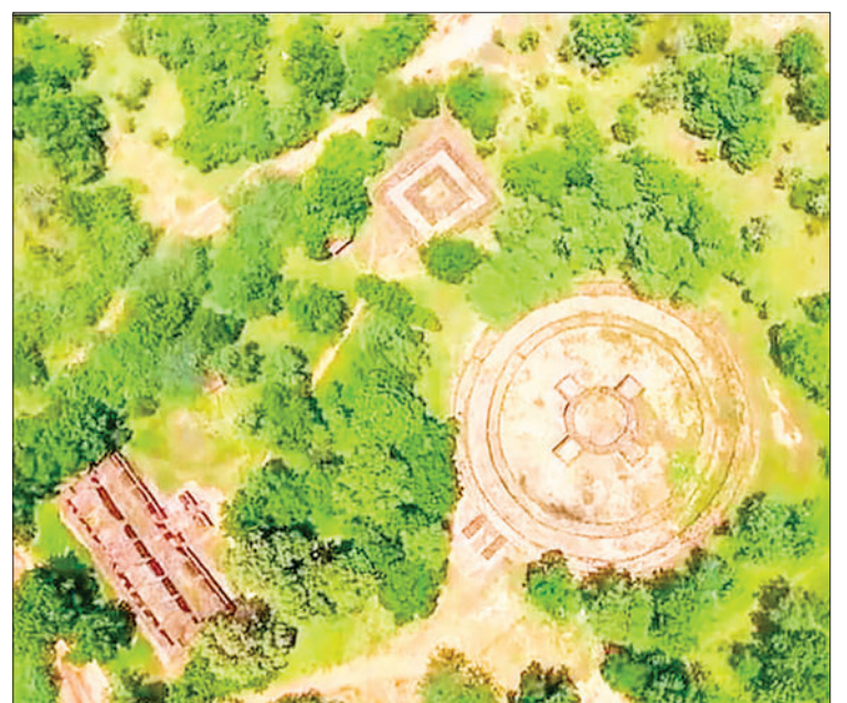
Parts of the unearthing project of Beikthano.

A gate at the northern wall of Beikthano was also discovered, and new technologies have shown that there was a lake that is believed to be larger many times than the existing one at the west of the city, he said. — MT/ZS