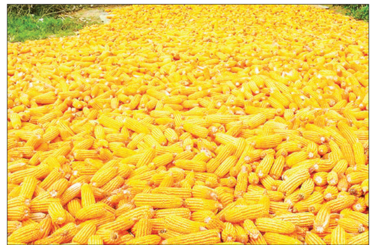
High quality of Myanmar's corn.

Myanmar's corn is typically exported to India, the Philippines, Viet Nam, Bangladesh, and various African countries. Thailand, Viet Nam, and Laos are frequent buyers of Myan-