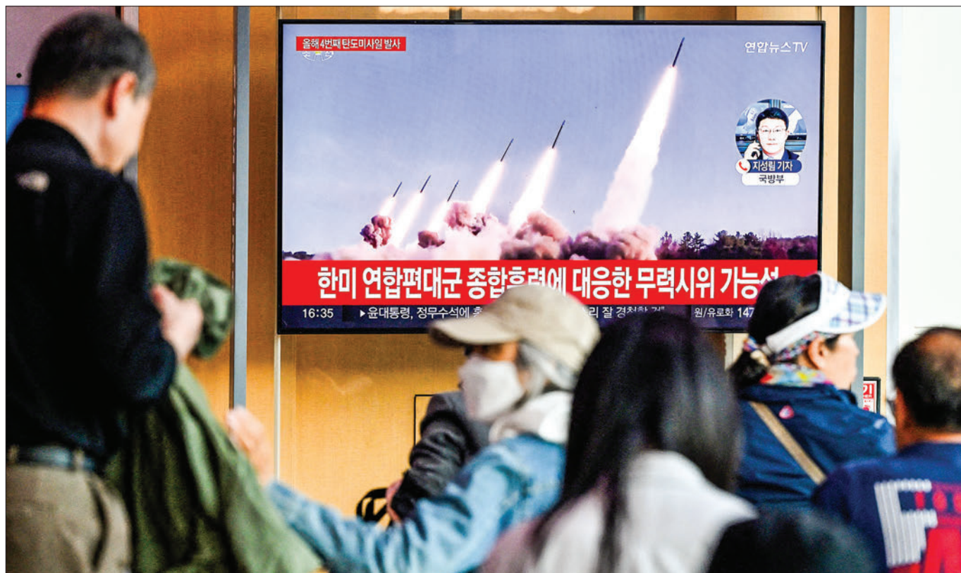
People watch a television screen showing a news broadcast with file footage of a North Korean missile test, at a railway station in Seoul on 22 April 2024.

NORTH Korea has fired several short-range ballistic missiles, Seoul's military said on Monday, the latest in a volley of tests by Pyongyang this year.