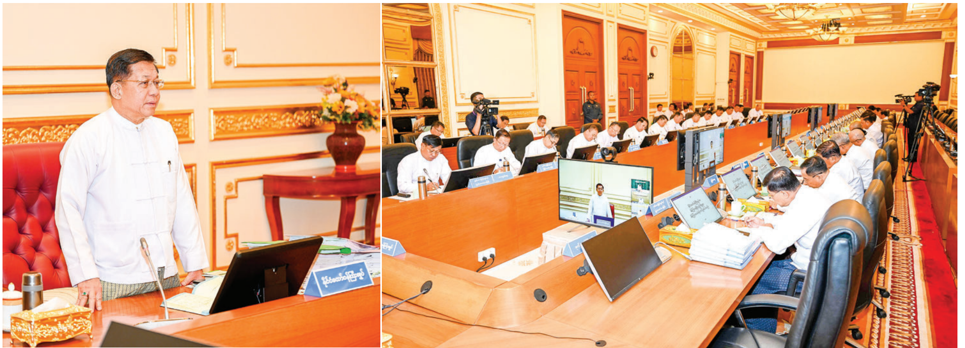
State Administration Council Chairman Prime Minister Senior General Min Aung Hlaing addresses the Union government meeting 4/2024 yesterday in Nay Pyi Taw.

I f people can overcome difficulties in commodity flow due to economic sanctions and committing lack of peace and stability, State economy will improve with a better trade process, increasing the value of national currency, said Senior General Min Aung Hlaing.