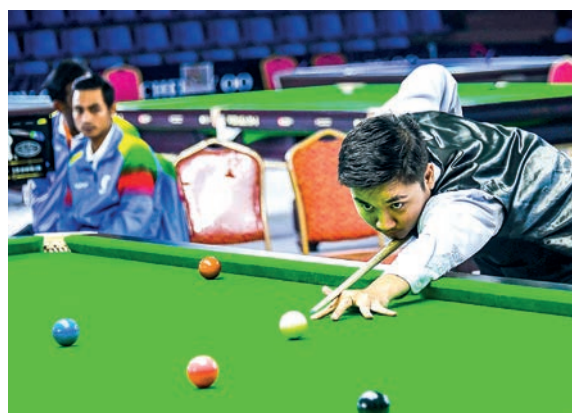
Photos showcase various sports at the National Sports Festival, including Karate, traditional Myanmar Chinlone, Wushu, and billiards-snooker.