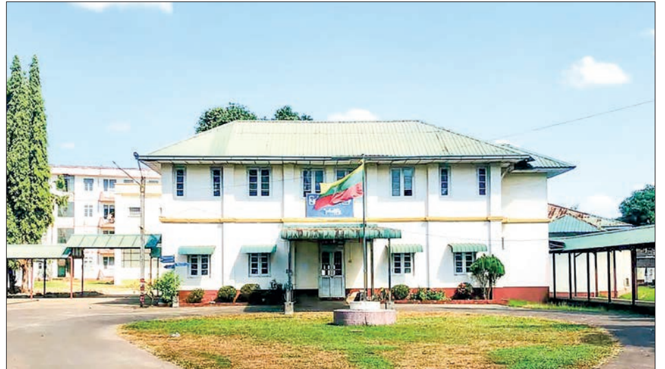
The facade view of the Kyaikto Public Health Department.

Hepatitis C can be cured by regular medication, it said. Medical costs for Hepatitis C are very expensive and not all patients can afford it. However, those infected but were unlisted and have financial difficulty to gain access medicines can come to register at the department during office hours, it added. — MT/ZS