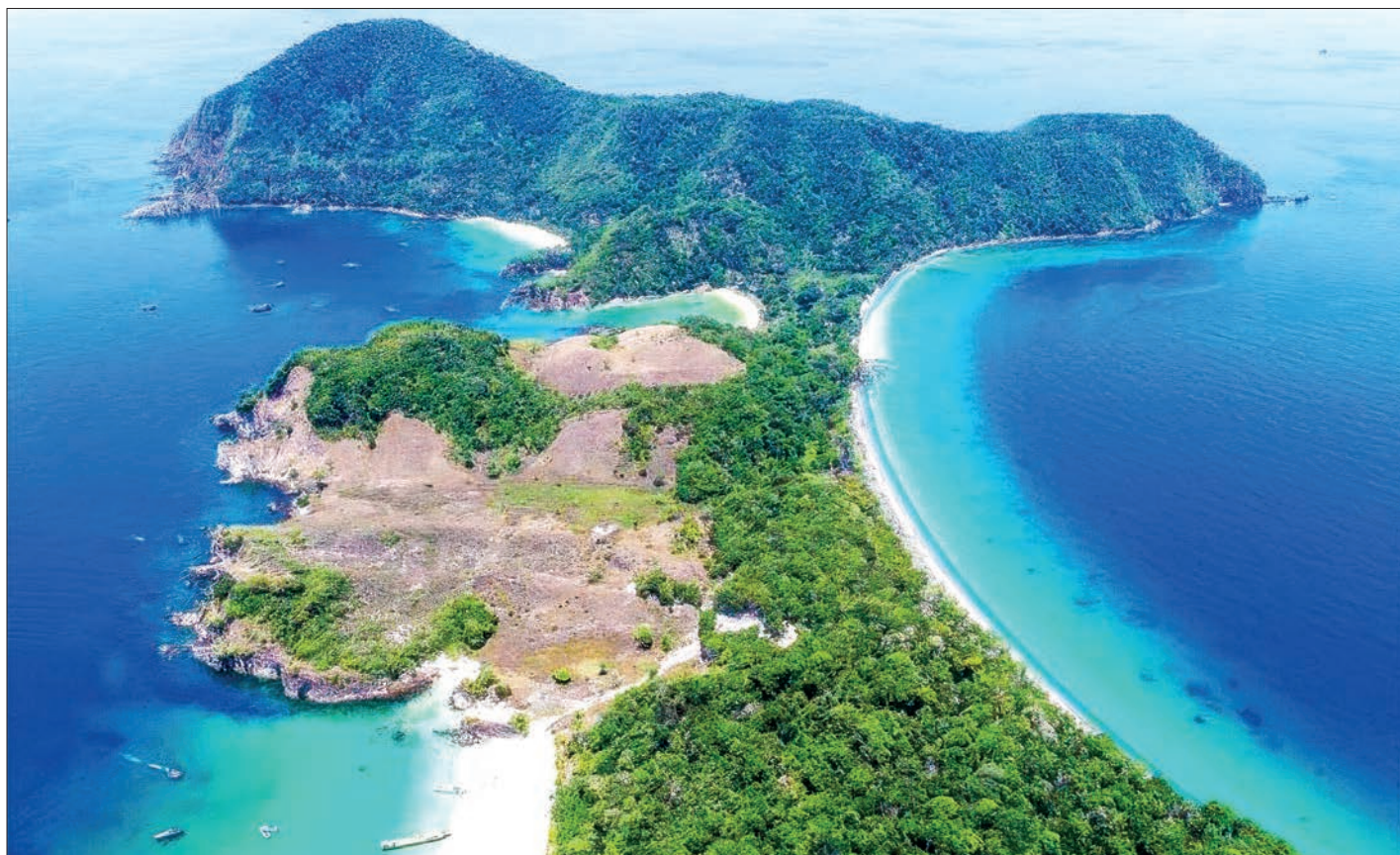
This aerial photo showcases one of the tour destinations in Taninthayi Region.

Efforts are also focused on enhancing tourism services in specific areas: Dawei for domestic travellers, Myeik for both domestic and Thai tourists, and Kawthoung for international visitors