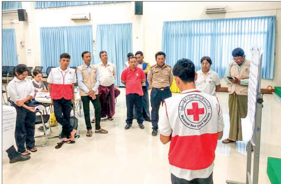
This image shows the opening of the operational communication training.

This training is part of a series previously held in Yangon, Magway, Northern Shan State, Kachin State, Mon State, Kayin State, Eastern