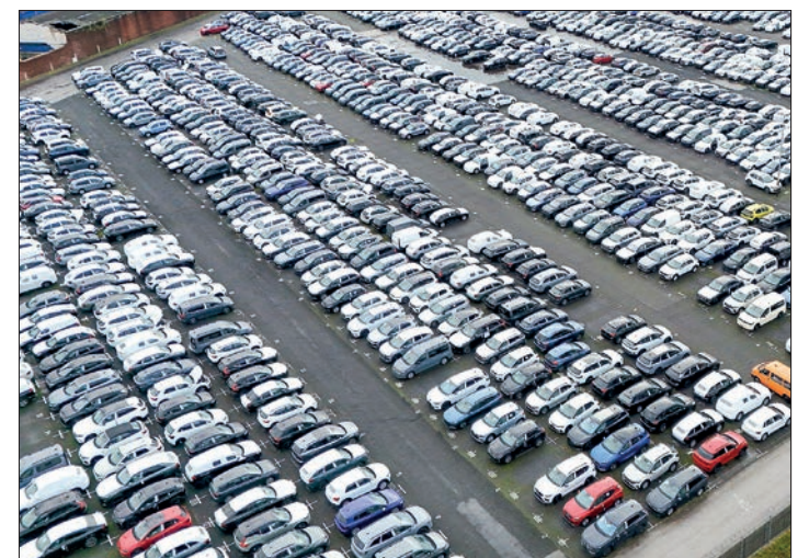
Aerial view shows new cars of various brands that are parked ready for sale at a car logistics terminal in Essen, western Germany, on 22 November 2024.

Manufacturers "lack a light at the end of the tunnel, which is why the years-long downward trend in production is now increasingly leading to job cuts", said Philipp Scheuermeyer, analyst at the public lender KfW. — AFP