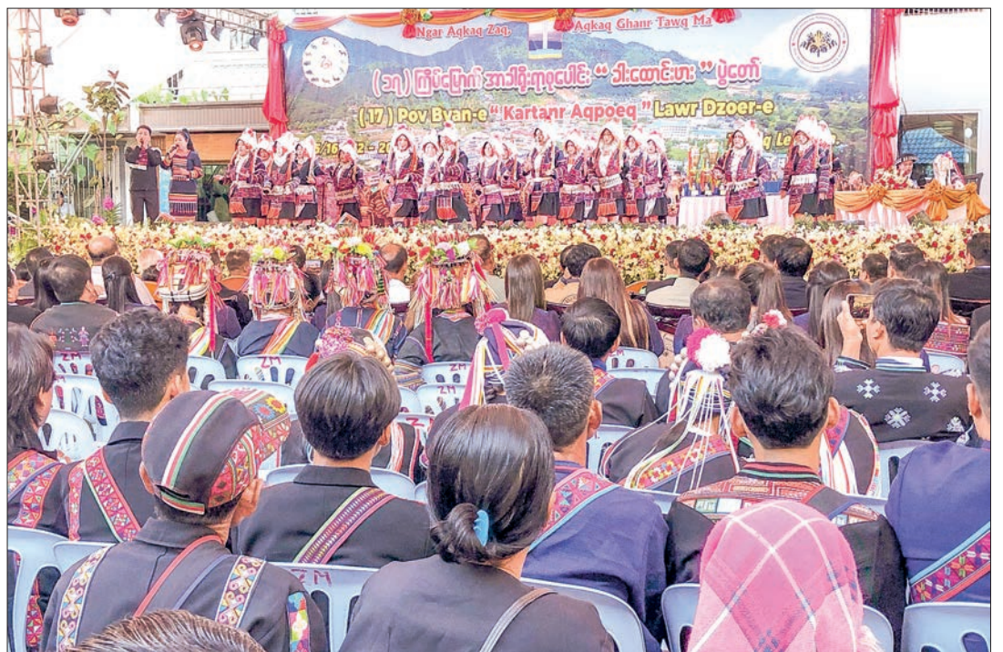
The 17 th Akha traditional collective festival in progress on 16 December.

THE price of one tical (16.329325 grammes) of gold with a density of 19.25 grammes per cubic centimetre and above is K5,360,000, as established by the Mineral (Gold) Reference Price Determination Committee.