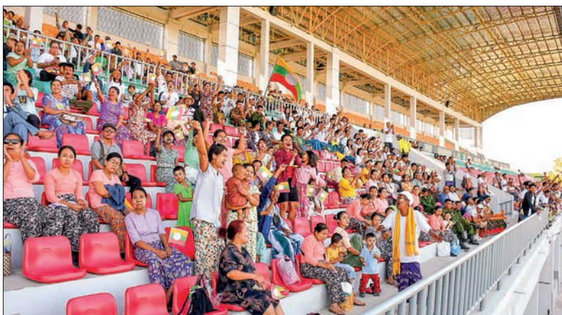
Enthusiastic football fans cheer the final match of the Inter-State and Region U-25 Women's Football Tournament.