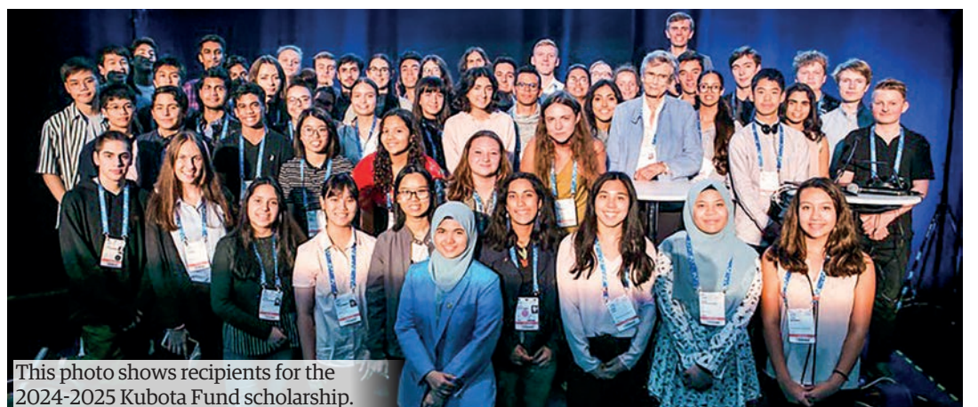
This photo shows recipients for the 2024-2025 Kubota Fund scholarship.

The deadline for applications to https://mypage.3050.iwebs.jp/kbt2023/ is 17 January 2025, and applicants can visit http://www.kubota-fund.org/ for more information, the embassy said. — MT/ZN