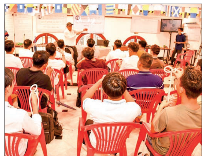
This photo reveals the basic practical training underway for safety onboard.

"If their travel documents or certificates of completion of the training course are not real, it is difficult to solve when they get into trouble onboard and the employer will deny his responsibilities," he said. — MT/ZS