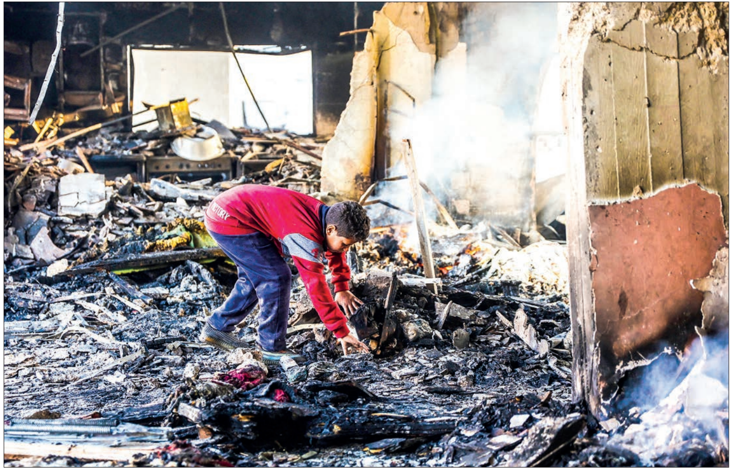
A Palestinian boy inspects the damage at the site of an Israeli airstrike on a building in Gaza City's Daraj neighbourhood on 17 December 2024, amid the ongoing war between Israel and Hamas militants.