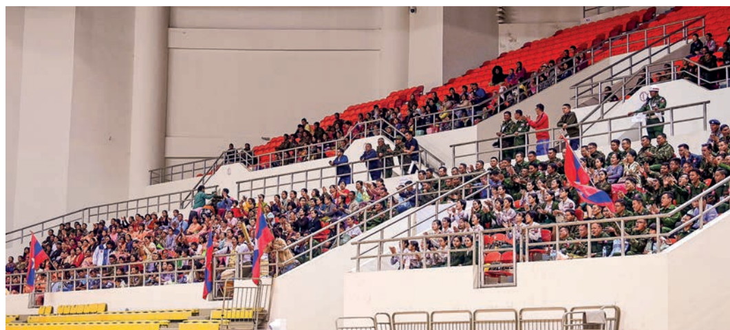
Enthusiastic spectators watch the ISR women's volleyball match.

team with a 3-0 victory. In the women's volleyball competition, the Ministry of Home Affairs team triumphed over the Ministry of Sports and Youth Affairs team with a 3-1 score, while the Ministry of Defence team won against the Ministry of Transport and Communications team with a 3-0 score.