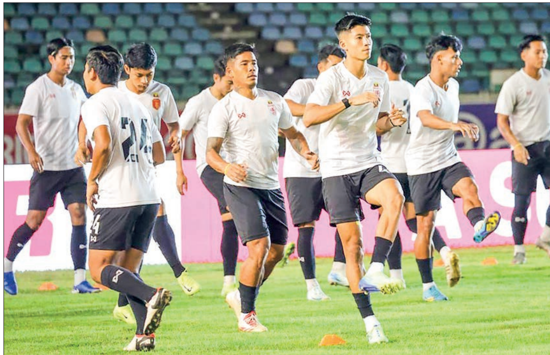
This photo depicts the Myanmar team during a training session.

THE Group B fixture of the 2024 ASEAN Cup continues today, with Myanmar set to host Laos. The match will take place at 5 pm at the Thuwunna Youth Training Centre in Yangon. Special ticket prices are set at K5,000, while regular tickets will cost K2,000. Shuttle buses will be provided for fans to ensure easy transportation.