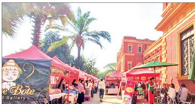
This photo depicts the Secretariat Yangon that will host the New Year's Market Fair.

THE Yangon Downtown Lifestyle Shopping Festival, a New Year's Eve market fair, will be held at the Secretariat Yangon in Botahtaung Township, Yangon Region, according to Dora Entertainment, the event organizer.