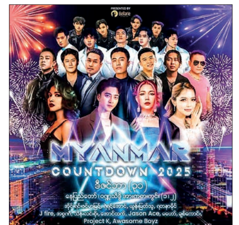
This photo showcases a billboard for the Myanmar Countdown 2025.