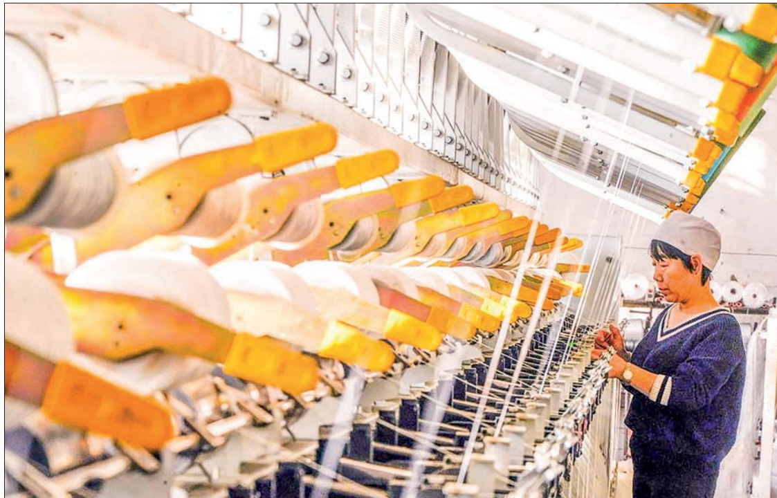
An employee works at a workshop of a textile enterprise at Manzu Township of Zunhua City, north China's Hebei Province, 16 December 2024.

said that value-added industrial output, an important economic indicator, expanded 5.4 per cent year on year in November, showing steady growth, driven by the large-scale equipment upgrades and consumer goods trade-in programmes. The equipment manufacturing sector's output climbed 7.6 per cent from a year ago in November, one percentage point higher than the previous month, contributing nearly half of the overall industrial output growth, the NBS data showed. The purchasing managers' index for the manufacturing sector came in at 50.3 last month, up 0.2 percentage points from the previous month and surpassing the boom-or-bust line of 50 for the second time since it returned to expansion in October after five consecutive months of contraction. — Xinhua