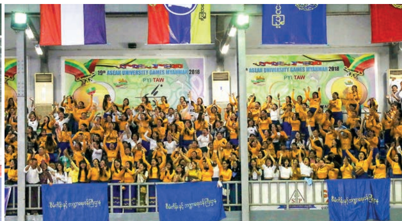
Spectators cheer during the futsal match between MoHA and MoPE at the Fifth National Sports Festival.