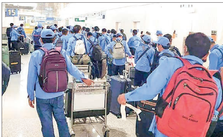
This photo shows some officials and Myanmar migrant workers at the airport in 2023.

ACCORDING to a statement issued by the Myanmar Embassy in Japan on 16 December, more than 400 Japanese companies will employ up to 1,100 Myanmar workers.