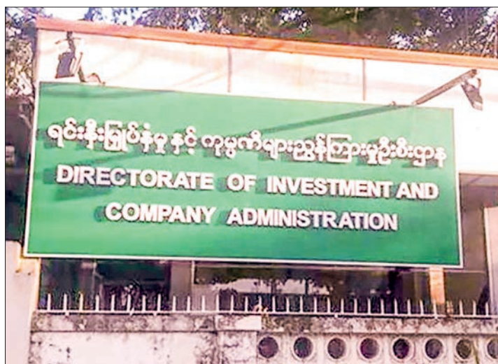
The signage of the Directorate of Investment and Company Administration (DICA) office.

A total of 6,400 companies also failed to submit the AR in 2023. The company registration on the MyCO website commenced on 1 August 2018