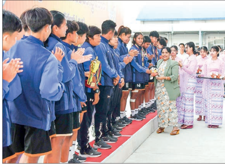
Union Minister Dr Thida Oo awards the first prize to the Mandalay Region women's football team.

Tin Oo Lwin, Union Minister for Cooperatives and Rural Development U Hla Moe, Union Minister for Electric Power U Nyan Htun, Union Minister for Sports and Youth Affairs U Min Thein Zan, along with the Deputy Ministers, officials from the Myanmar Olympic Committee, and the team managers, coaches, and athletes of the participating teams. Union Ministers and officials bestowed the awards, afterwards.