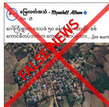
This screenshot reveals false reports.

MALICIOUS media intentionally spread false news, claiming that security forces detained 50 locals of Gawgyi