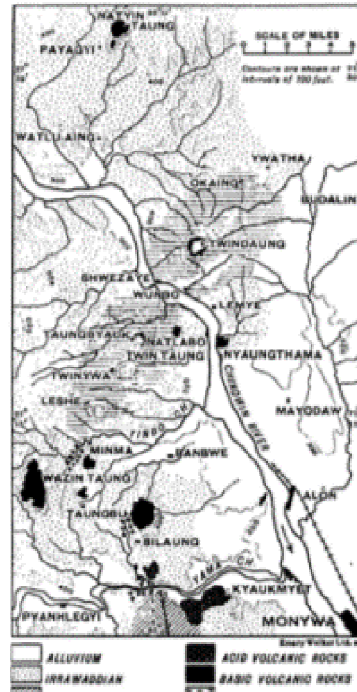
Map showing the explosion craters of the Lower Chindwin and the geology of the neighbourhood. (After E. S. Pinfold and A. E. Day.)

The igneous rocks form a well-defined series, with certain characteristics which indicate that they belong to the Pacific suite. The volcanic rocks range from rhyolites, in which secondary changes are most marked, through andesites to basalts, among which the most characteristic and interesting members are very basic olivine-basalts (picrite-basalts) approaching basanites but apparently without feldspathoids. The hypabyssal rocks include both acid and intermediate types. Some of the basic basalts as well as many of the acid ones, should perhaps be classed rather as hypabyssal rocks, occurring, as they do, as plugs or necks. Some of the hypabyssal rocks are coarse-grained and might be classed as plutonic rocks, but it is the ejected blocks from the explosion craters that afford the most interesting examples of plutonic development - more especially a remarkable series of ultrabasic types.