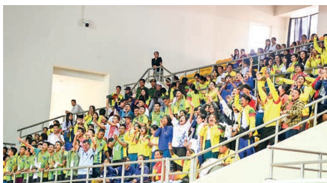
Enthusiastic sports fans cheer on the players in the ISR Sepak Takraw tournament.