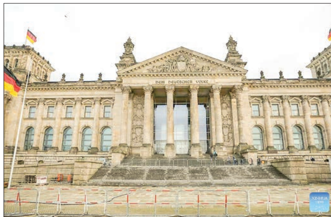
This photo taken on 16 December 2024 shows the German Bundestag in Berlin, Germany. German Chancellor Olaf Scholz lost in a vote of confidence in the Bundestag, the lower house of parliament, on Monday.

Concerns had arisen that Scholz could unexpectedly win the vote. This scenario could have materialized if members of Scholz's SPD and the Greens voted in favour, while the AfD voted to support him to create chaos.