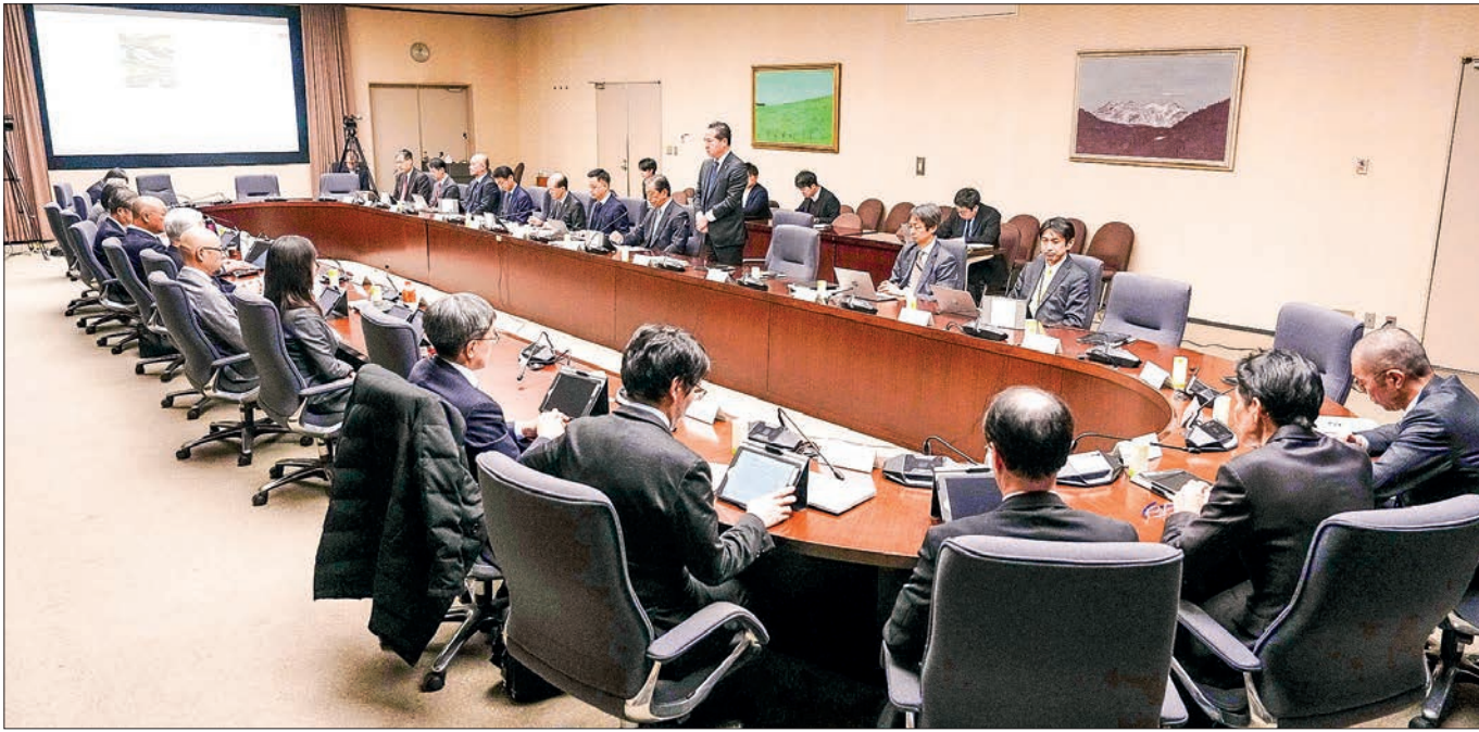
A meeting of experts on Japan's energy policies is held at the Ministry of Economy, Trade and Industry in Tokyo on 17 December 2024.

JAPAN will utilize nuclear power as much as possible along with renewable energy, a draft government plan showed Tuesday, departing from its earlier resolve to minimize dependence on atomic energy following the 2011 Fukushima crisis.