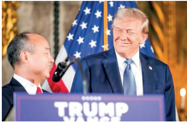
US President-elect Donald Trump (R) and SoftBank Group Corp CEO Masayoshi Son hold a joint press conference at Trump's Mar-a-Lago estate in Palm Beach, Florida, on 16 December 2024.

"My confidence level to the economy of the United States has tremendously increased with his