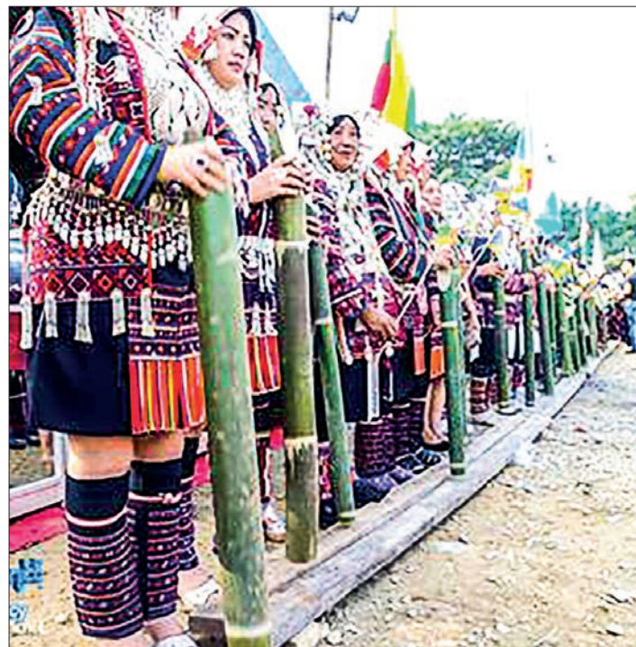
Akha women in traditional attire participate in the festival.