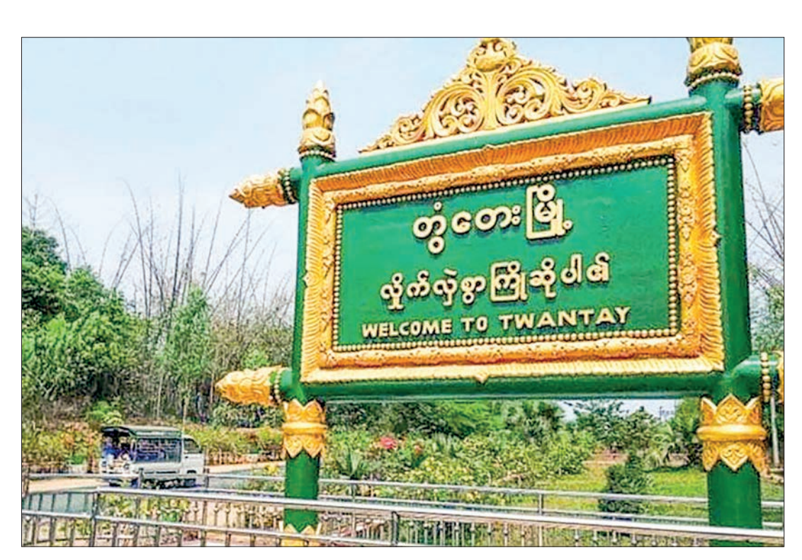
The photo shows the entrance to Twantay Township in Yangon Region.

The Illegal Trade Eradication Steering Committee reported 24 arrests on 23, 25 to 26 August, resulting in the seizure