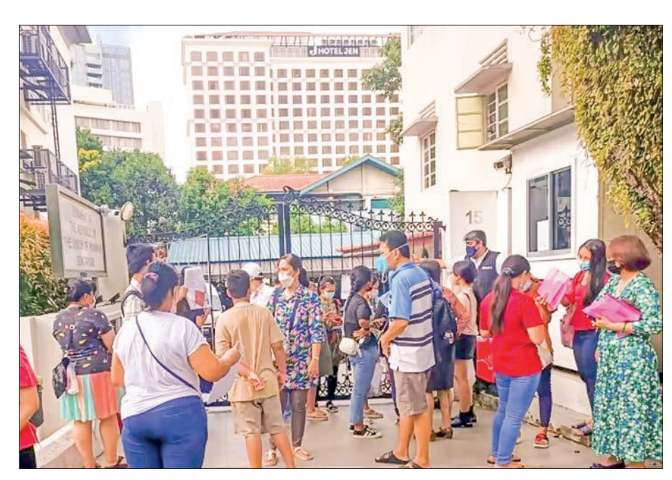
The photo shows Myanmar nationals seeking passport extensions at the Myanmar Embassy in Singapore in 2023.