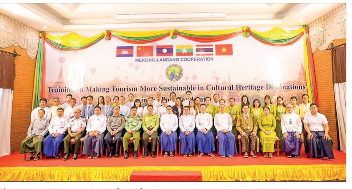
The commemorative group picture taken at the opening event in Bagan on 26 August 2024.

Deputy Minister U Phyo Zaw Soe explained that training was opened based on the outcome of the Seminar on Making Tourism More Sustainable in Cultural Heritage Destinations in the Post-Pandemic held on 23 August in Bagan, with the presence of representatives and experts from Mekong-Lancang member states. Myanmar's hotel and tourism sector saw four projects operated under the 2021-2023 Mekong-Lancang Cooperation Special Fund: The establishment of the Tourism Research Centre