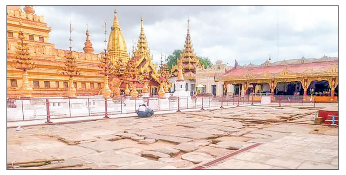
Maintenance works of ancient sandstone slabs in progress on the platform of the Shwezigon Pagoda.

THE Department of Archaeology and National Museum is overseeing the repairs to the platform of Shwezigon Pagoda to improve drainage and the maintenance of the ancient sandstone slabs, according to the Bagan Archaeology Branch.