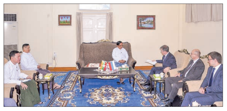
Union Industry Minister Dr Charlie Than receives Mr Iskander Azizov, Ambassador of the Russian Federation yesterday.

Both sides cordially discussed and exchanged views on the soonest complete operation of the No 2 Steel Factory (Pangpet) project by the Ministry of Industry and TPE Co Ltd of the Russian Federation, installation of the melting furnace, equipment in oxygen workshops for conducting test runs, the provision of technical support for the operation of the factory, signing the contract framework after the two parties have completed the final discussion and negotiation, and further collaboration with stronger friendship between the two countries. — MNA/TS