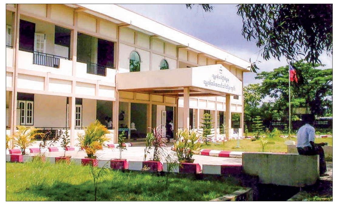
The School for the Adults with Disabilities (Yangon).

A second three-month vocational training course for the 2024-2025 academic year will commence on 9 September at the School for Adults with Disabilities (Yangon), according to the Department of Social Welfare.