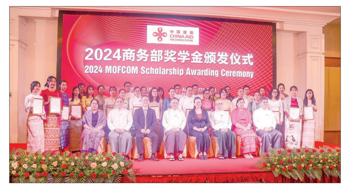
The commemorative group picture taken at yesterday's event in Nay Pyi Taw.