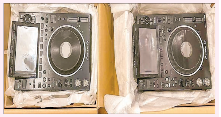
Confiscated illegal items in different states and regions.

THE second batch of the EPS-TOPIK exam for the manufacturing sector will be continued on 26 September 2024, according to the Public Overseas Employment Agency (POEA-EPS).