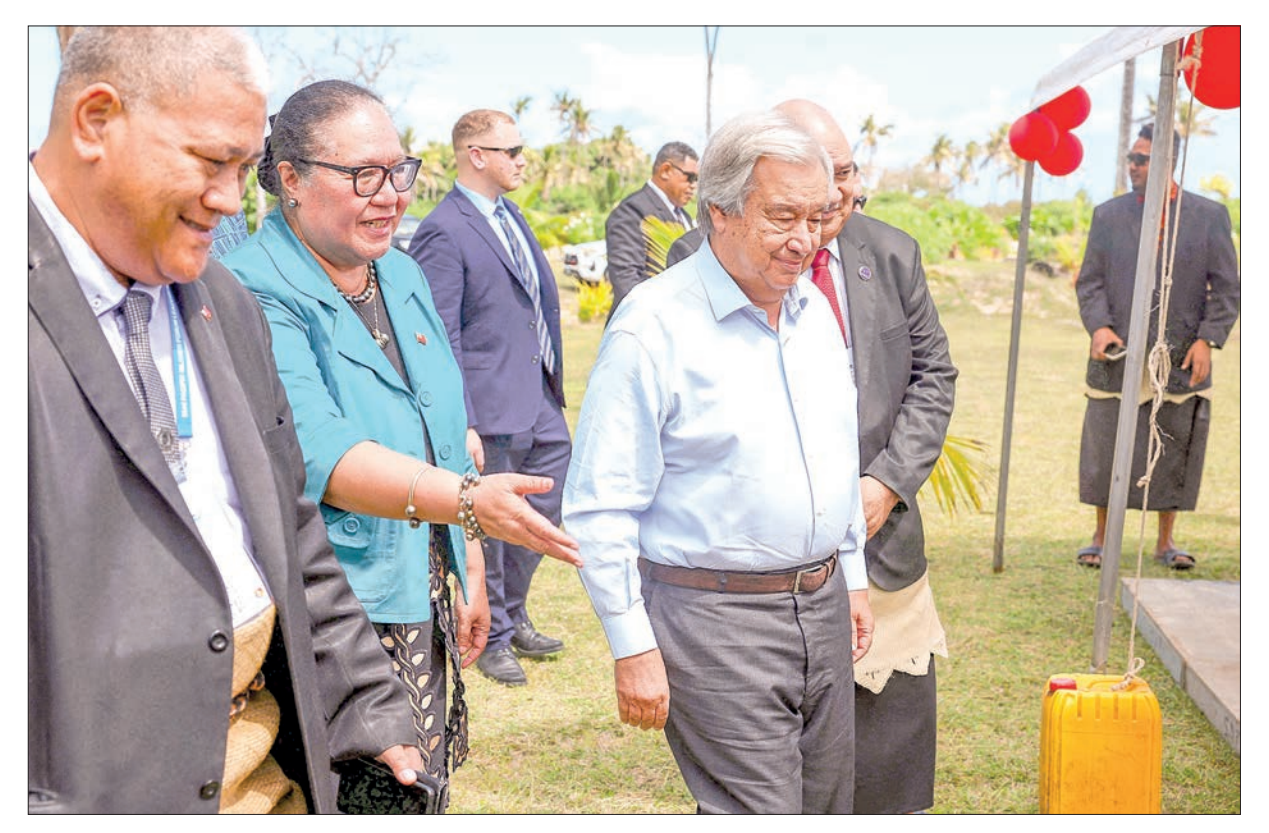
United Nations Secretary-General Antonio Guterres (2<sup>nd</sup> R) visits the Ha'atafu Beach, an area affected by the volcanic eruption and tsunami in 2022, in Tongatapu on 27 August 2024.

UNITED Nations Secretary-General Antonio Guterres issued a "global SOS" in Tonga on Tuesday, urging governments to step up climate action to "save our seas", as two new reports revealed how rising sea levels are threatening the vulnerable Pacific region and beyond.