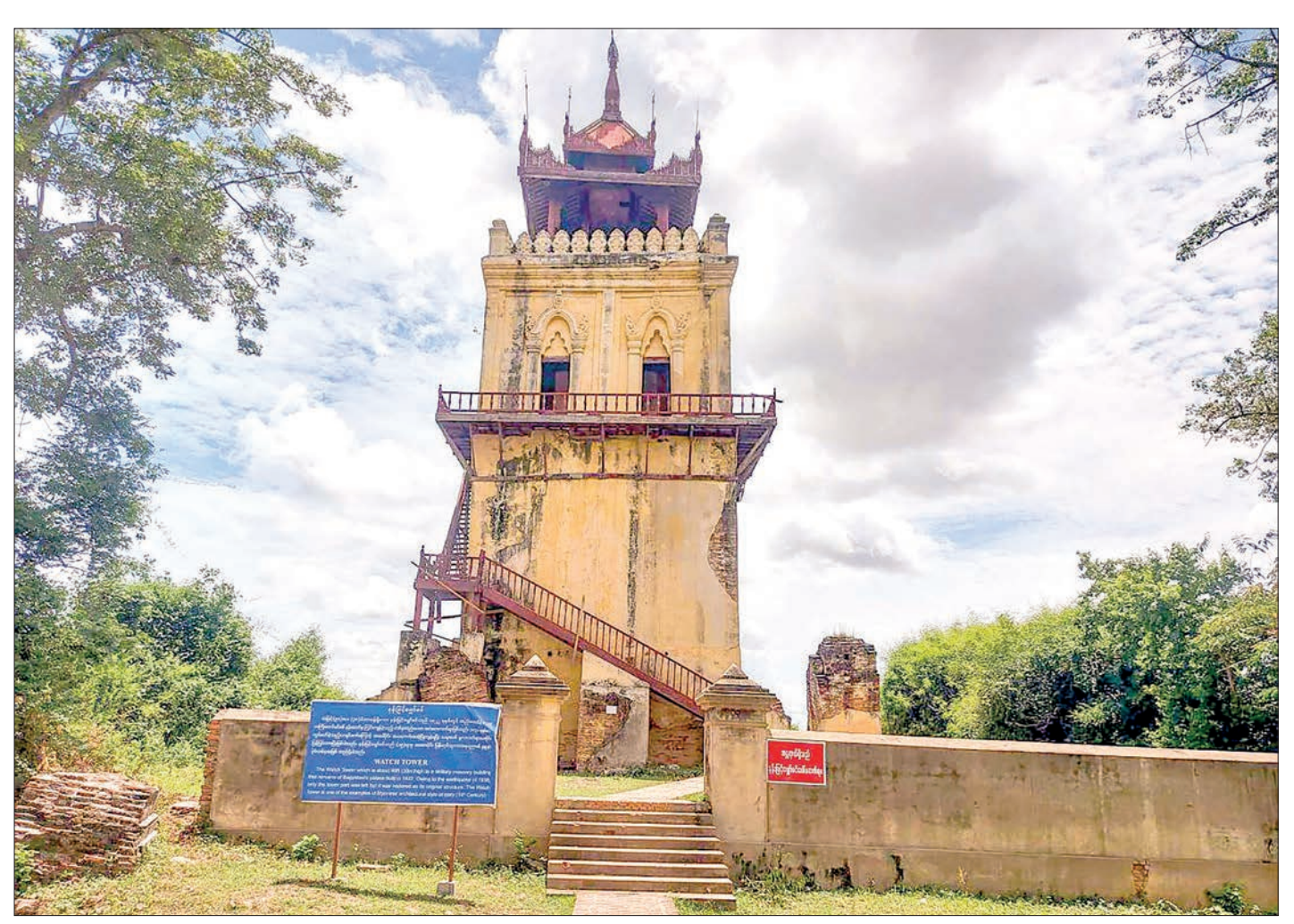
This photo depicts a general view of the Inwa palace tower in ancient Amarapura-era style.