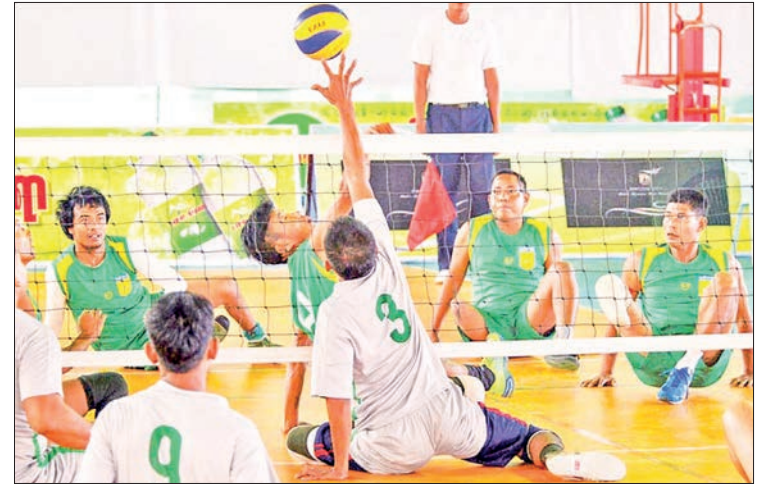
The sitting volleyball.

The sports festival will include 25 sports disciplines, such as athletics, swimming, football, chess, table tennis, and sitting volleyball. The first National Sports Festival was held in 1992, followed by the second in 1994 and the third in 1997, all in Yangon. The fourth National Sports Festival was held in Nay Pyi Taw in 2015. — TWA/MKKS