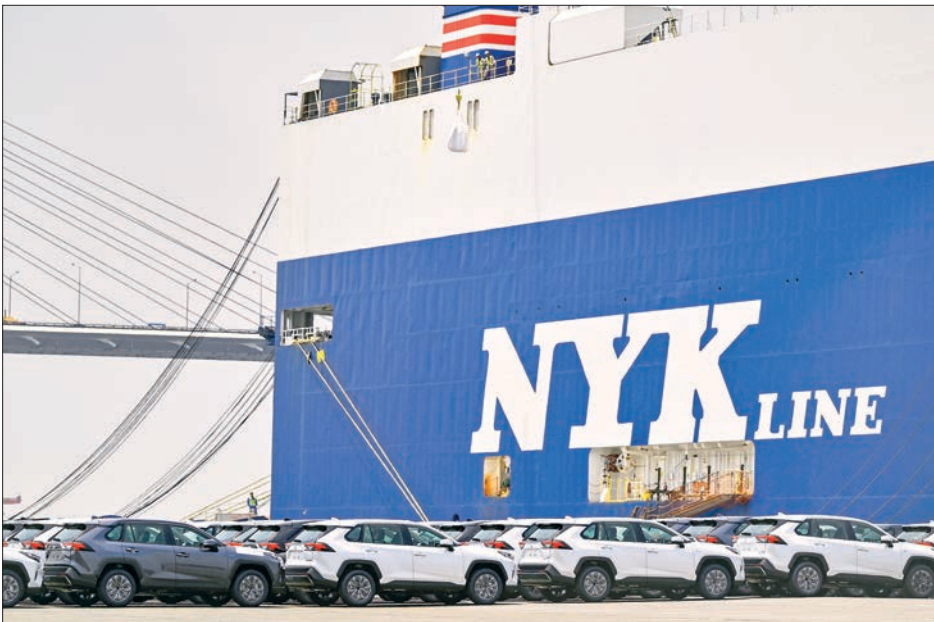
Vehicles sit lined up on a lot near the docks next to a container ship at the Port of Nagoya, in Tokai, Aichi prefecture, suburban Nagoya on 2 June 2025.

Nonmanufacturers reported a 17.6 per cent increase in pretax profits