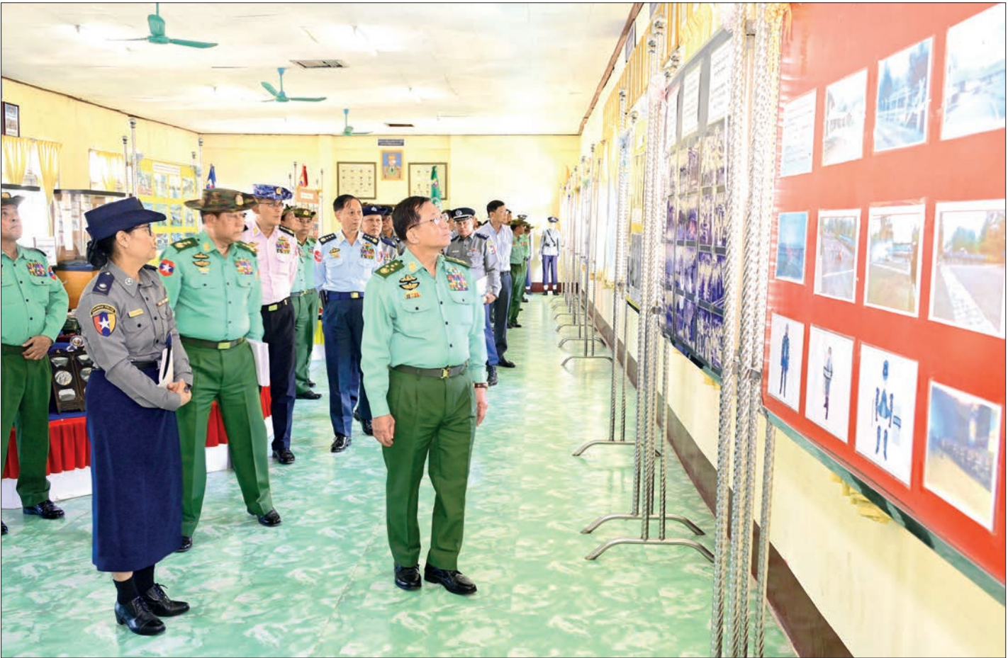
Acting President and State Security and Peace Commission Chairman Senior General Min Aung Hlaing looks around the exhibits at yesterday's event in PyinOoLwin, Mandalay Region.

Training programme seeks to boost civil servants' discipline, efficiency and teamwork.