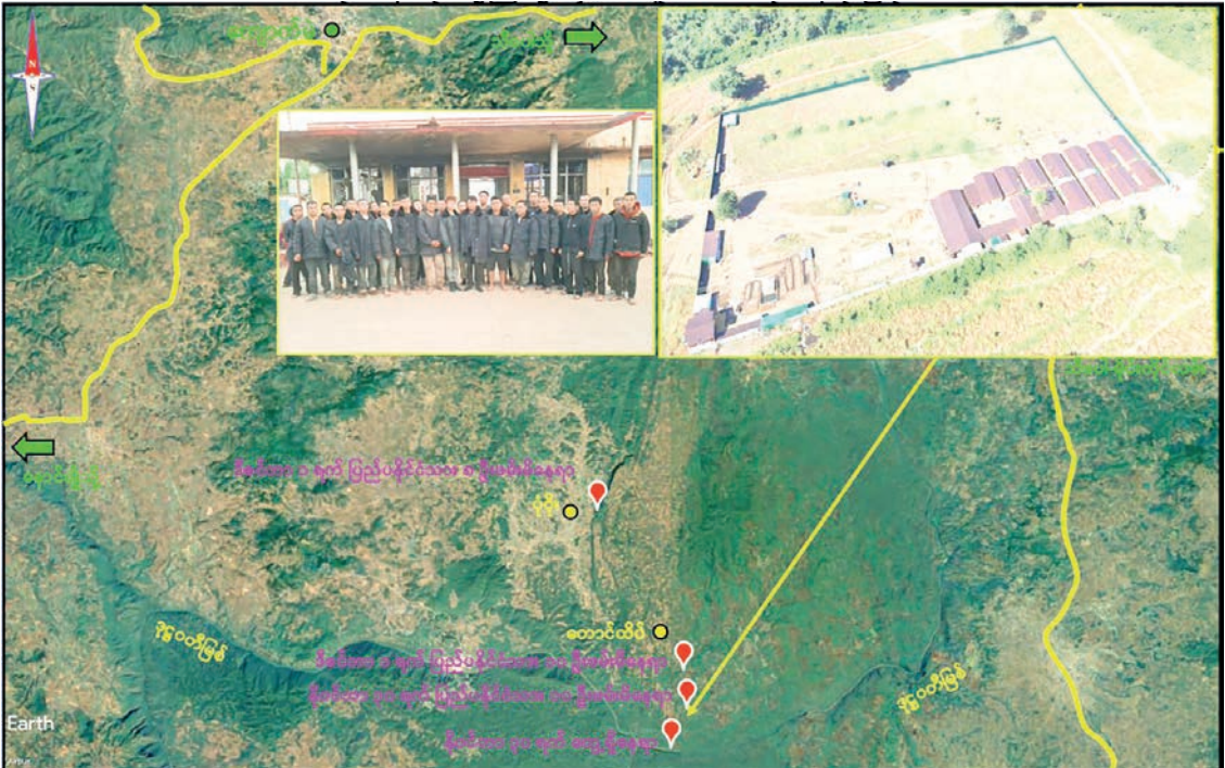
The location map, arrestees and seized scam-related items.

Security forces serving security duties in Kyaukme Township raided suspicious buildings near the Dokhtawady River, south of Taunghteik Village of Kyaukme Township on 30 November and found the site used for operating telecom fraud and online gambling activities. No participants in the aforesaid activities were found but the security forces confiscated six 60 feet by 30 feet hostels, five 60 feet by 30