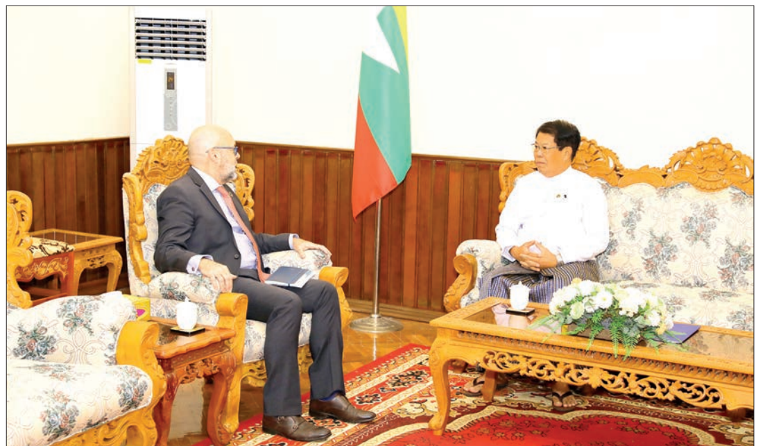
The Representative of the United Nations Population Fund (UNFPA) to Myanmar calls on Union Minister U Than Swe yesterday.

U Than Swe, Union Minister for Foreign Affairs, received the Representative of the United Nations Population Fund (UNFPA) to Myanmar at the Min-