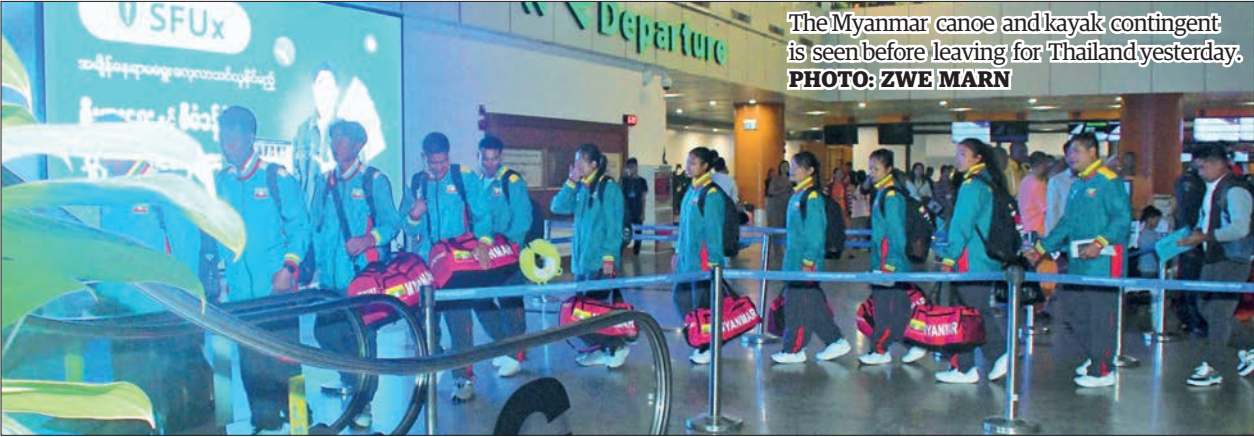
The Myanmar canoe and kayak contingent is seen before leaving for Thailand yesterday.

MYANMAR’S canoe and kayak athletes will represent the country at the 33 rd Southeast Asian Games, which will be held in Thailand from 9 to 20 December 2025. The team’s managers, coaches and athletes departed for Thailand by air yesterday. “Our athletes are highly motivated to achieve good results. By travelling ahead of schedule, we will be able to begin training in Thailand from 3 December, which will help us become familiar with the competition environment. Since we will be competing in canoe and kayak events, the boats we will use have already arrived in Thailand in advance by container,” said