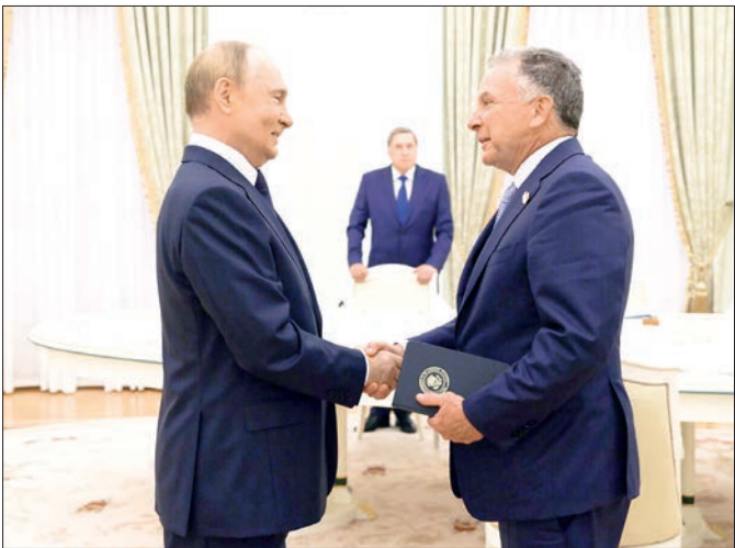
Russian President Vladimir Putin and US Special Envoy for the Middle East Steve Witkoff shake hands before a meeting at the Kremlin in Moscow, Russia, on 6 August 2025.

"We have already said that for the process to be success-