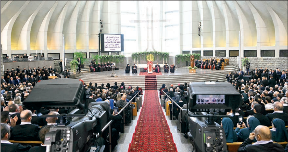
Pope Leo XIV addresses the crowd during a meeting with bishops, priests consecrated persons and personal workers at the shrine of Our Lady of Lebanon in Harissa, northeast of the capital Beirut, on 1 December 2025. Levant," the pope said from deep inside the candle-lit stone monastery. Saint Charbel, who was canonized in 1977, enjoys broad popularity in Lebanon beyond the Christian community, with depictions of the white-bearded saint found in homes, vehicles and workplaces. The pontiff then visited Harissa, also north of Beirut

POPE Leo XIV prayed for peace in Lebanon and the region on Monday on day two of his trip to the multi-confessional country, with joyful Lebanese welcoming the pontiff at two famous pilgrimage sites. Thousands of people cheered, ululated and threw rice in celebration as the pope travelled in the popemobile to a monastery in Annaya in the mountains north of Beirut which hosts the tomb of Saint Charbel, AFP photographers said. Pope Leo arrived from Türkiye on Sunday on his inaugural visit abroad as pontiff and brought a message of hope, particularly to young people in Lebanon whose faith in their crisis-hit country has dwindled. "For the world, we ask for peace. We especially implore it for Lebanon and for the entire