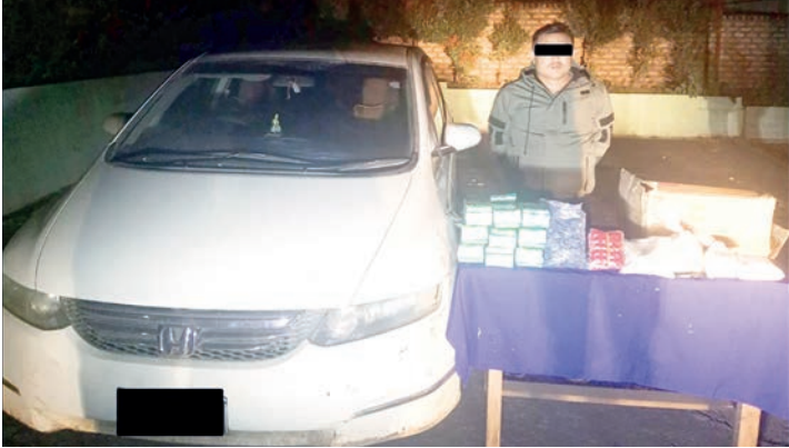
An arrestee is seen together with confiscated drugs and a vehicle.

ACCORDING to the Myanmar Police Force, psychotropic drugs worth K249.9 million were seized in Tangyan Township, and psychotropic drugs worth K224 million were seized in Loilem and Lashio. The first incident occurred at 11:10 am on 28 November, when a joint team comprising members of members of the Anti-Drug Police Force intercepted and searched a Honda Odyssey driven by Sai Nyi Nyi Oo (aka) Sai Shwe Aung, aged 36, a resident of Tachilek, near Namhuloika Village in Tangyan Township. The search uncovered 13.5 kilogrammes of ketamine (valued locally at K 175.5 million), 0.17 litre of “Happy Water” liquid (valued locally at K 51 million), and 2,600 Erimin-5 tablets (valued locally at K23.4 million). Action has been taken against Sai Nyi Nyi Oo (aka) Sai Shwe Aung under the Narcotic Drugs and Psychotropic Substances Law. In addition, at 8 am on 28 November, a joint team comprising members of the Anti-Drug Police Force, acting on information received,