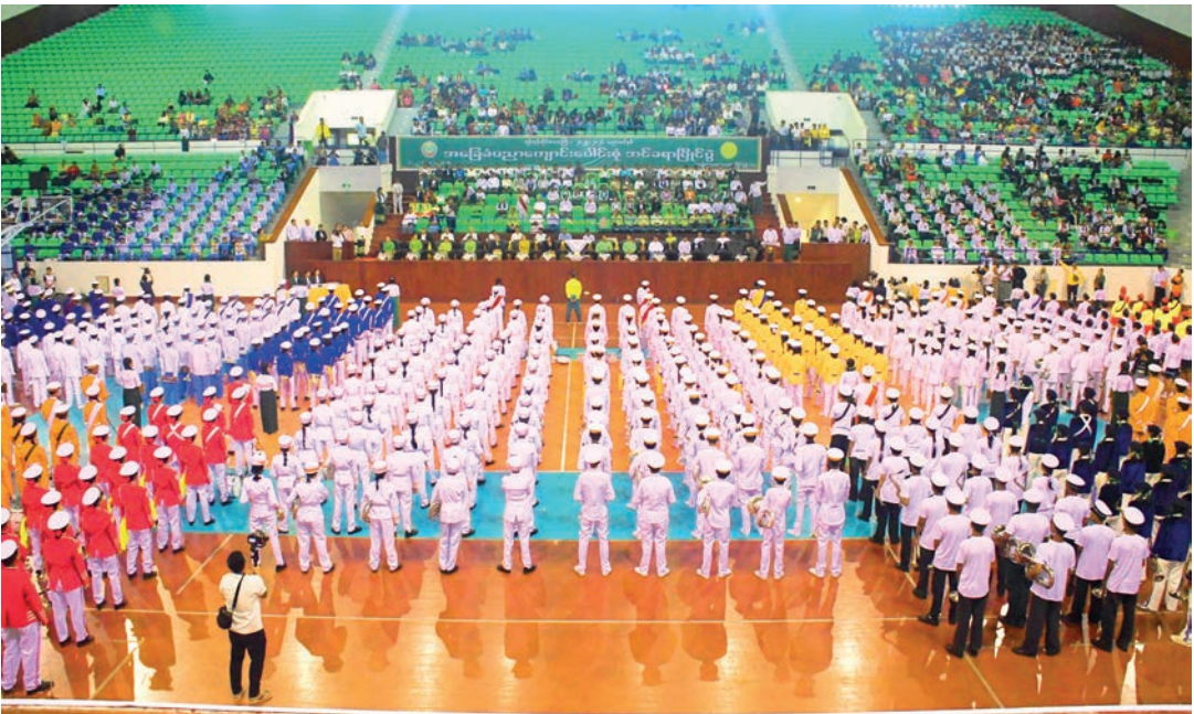
The Inter-School Band Contest for the 2025-2026 AC underway in Yangon yesterday.

THE Inter-School Band Competition for the 2025-2026 academic year was organized at the National Indoor Stadium I in Yangon yesterday.