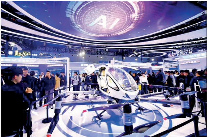
Visitors learn about a manned aircraft during the China International Digital Economy Expo 2025 in Shijiazhuang, north China's Hebei Province, 17 October 2025.

CHINA'S transition toward high-quality development not only reflects its internal economic upgrading but also creates "a new platform of global cooperation," offering shared opportunities for Portuguese-speaking countries, a business leader has said. In a recent interview with Xinhua, Bernardo Mencia, secretary-general of the Portugal-China Chamber of Commerce and Industry, said China's stable economic growth in the third quarter shows that the world's second-largest economy "is consolidating its transformation while navigating successfully through a complex global environment." "A stable China means a stable trading environment for us all. It is a reliable partner and a major engine for global growth," he said. "China is clearly moving from quantity to quality, from being the 'world's factory' to becoming an innovation-driven, sustainable and consumption-based economy," he said,