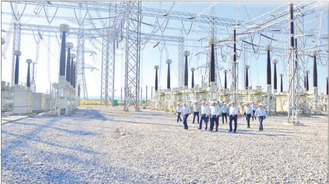
Union Minister U Nyan Tun and officials are pictured during their inspection tours in the construction site of the Sapakyew (Toungoo) substation.

earthquake, ensure the occupational safety, security and timely completion. He also inspected the control building and installation of transformers, Shunt Reactor and Hybrid Gas Insulated Switch-gear (HGIS) in Switch Yard. The 500 kV Sapakywe (Toungoo) substation project has completed 81.07 per cent, and efforts are being made to complete the whole project as quickly as possible. — MNA/KTZH