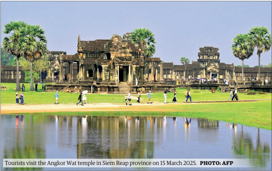
Tourists visit the Angkor Wat temple in Siem Reap province on 15 March 2025.

CAMBODIA'S famed Angkor Archaeological Park attracted a total of 867,195 international visitors in the first 11 months of 2025, a year-on-year drop of 3.47 per cent, said a press release on Monday. The UNESCO-listed world heritage site made US$40.48 million in revenue from ticket sales during the January-November period this year, also down 3.41 per cent, said the press release from the state-owned Angkor Enterprise. In November this year, the park received 101,677 foreign tourists, generating $4.9 million, down 18 per cent and 17 per cent, respectively, compared to the same month last year, it added.