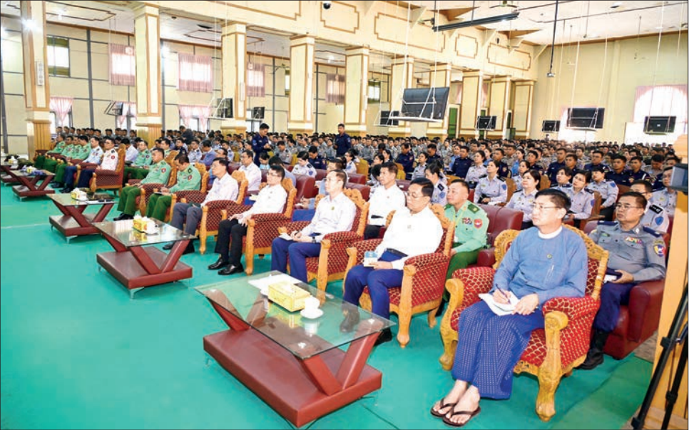
Acting President and State Security and Peace Commission Chairman Senior General Min Aung Hlaing addresses the meeting at Zeebingyi in PyinOoLwin, Mandalay Region.

SENIOR General Min Aung Hlaing highlighted that while political leadership within the government may change, civil servants continue to carry out their duties according to their responsibilities.