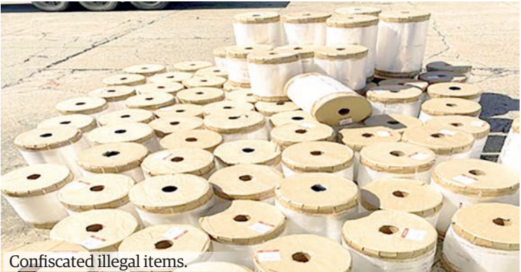
Confiscated illegal items.