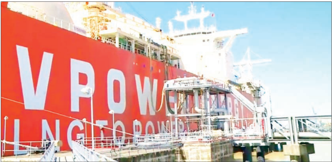
Test operations underway using LNG supplied from the LNG vessel at Thilawa Port in Thanlyin Township.

ACCORDING to the Ministry of Electric power, the power plants in Thanlyin and Thakayta townships of Yangon Region have begun test operations using liquefied natural gas (LNG) supplied from an LNG vessel docked at Thilawa Port in Thanlyin Township.