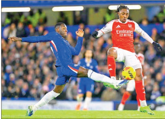
Eberechi Eze (R) of Arsenal vies with Moises Caicedo of Chelsea during the English Premier League match between Arsenal FC and Chelsea FC in London, Britain, on 30 November 2025.

PREMIER League leader Arsenal was held to a 1-1 draw by 10-man Chelsea at Stamford Bridge on Sunday. Moises Caicedo was sent off in the 38 th minute for a studs-up challenge on Mikel Merino, but Chelsea went ahead 10 minutes later when Trevoh Chalobah glanced in Reece James’ corner. Arsenal levelled after the break as Merino powered in a header from Bukayo Saka’s cross, and Chelsea held on for the final half-hour in a bad-tempered match. Manchester United came from behind to win 2-1 at Crystal Palace, ending a five-year wait for a league victory at Selhurst Park. Jean-Philippe Mateta put Palace ahead with a twice-taken first-half penalty, before Joshua Zirkzee equalized and Mason Mount struck the winner. Liverpool won 2-0 at West Ham as coach Arne Slot left Mohamed Salah on the bench for the first time in a league match under his tenure. Alexander Isak broke the deadlock in the 60 th minute, and Cody Gakpo sealed the points in stoppage time after Lucas Paqueta was sent off in the 84 th . — Xinhua