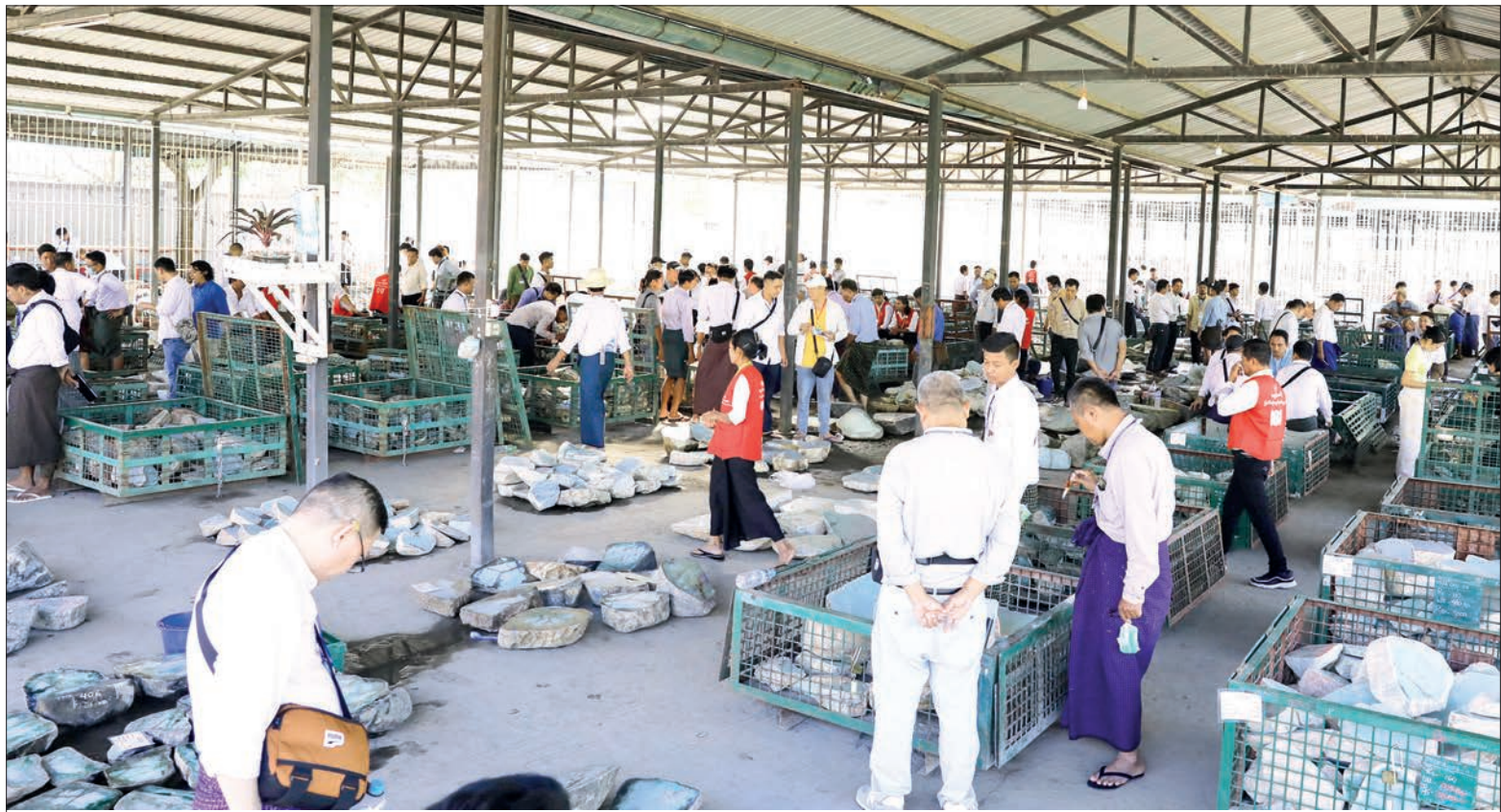
Gem traders carefully examine gemstones and jade during the 60 th Myanmar Gems Emporium.

for its remarkable translucence, vibrant green colouration, and high economic value.