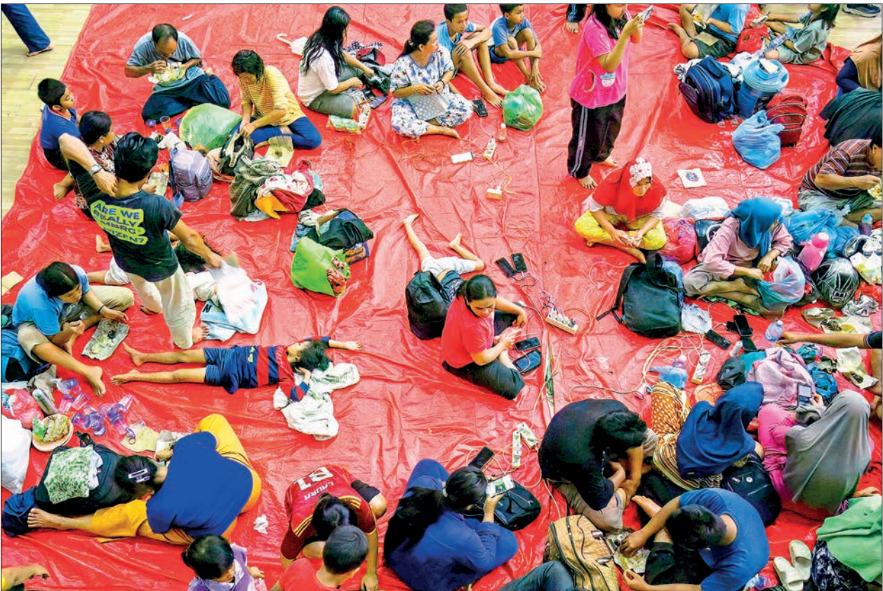
Displaced residents rest in a shelter following flash floods and landslides in Pandan in Central Tapanuli, Indonesia's North Sumatra province on 30 November 2025.

"Everything in the house was destroyed because it