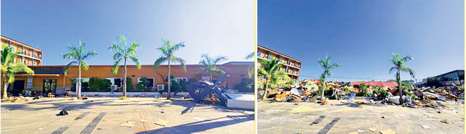
Images show the one-storey flat before and after the demolition in the KK Park area.

Yesterday, the authorities deported 131 Chinese nationals and 30 Pakistanis, totalling 161 individuals, through the Myanmar-Thailand Friendship Bridge II. From 30 January to 1 December 2025, a total of 12,945 foreign nationals who had entered Myanmar illegally were detained. Of these, 10,190 individuals were screened to be expelled and were systematically repatriated to their respective countries through Thailand in accordance with legal procedures. The remaining 2,755 foreign nationals are now ready