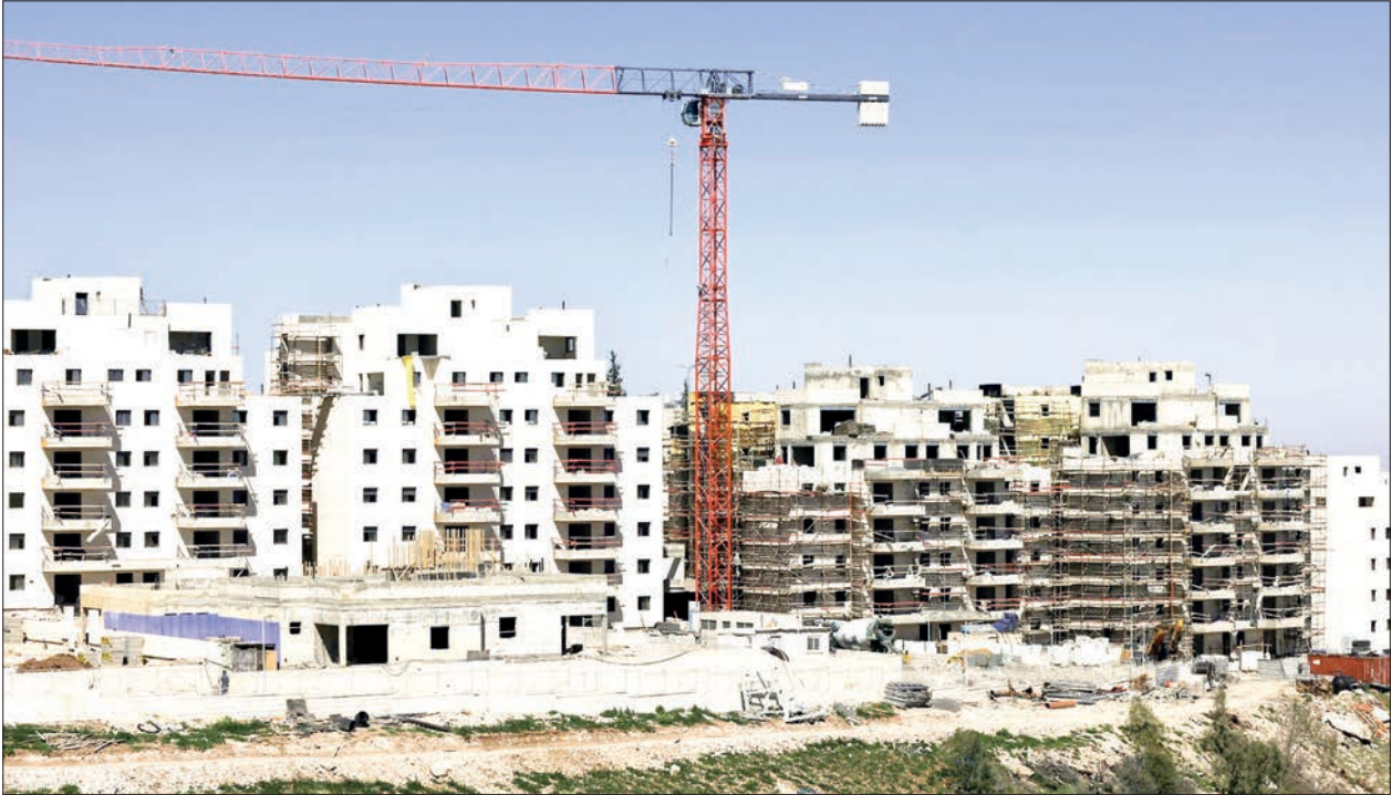
Israel’s security cabinet approved the establishment of 19 new settlements in the occupied West Bank.