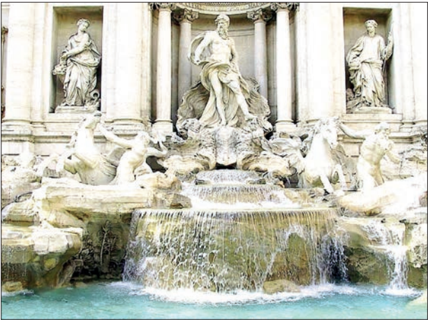
Tourists will have to pay a two-euro entrance fee from February to get close to Rome’s Trevi Fountain, officials said Friday, in a bid to tackle overtourism.

TOURISTS will have to pay a two-euro entrance fee from February to get close to Rome’s Trevi Fountain, officials said Friday, in a bid to tackle overtourism. The Baroque masterpiece, located in a public square, will remain viewable from a distance for free, but closer access will be exclusively for ticket holders. “From 1 February we are introducing a paid ticket for six sites” in the Italian capital, including the Trevi Fountain, Mayor Roberto Gualtieri told a press conference. — AFP