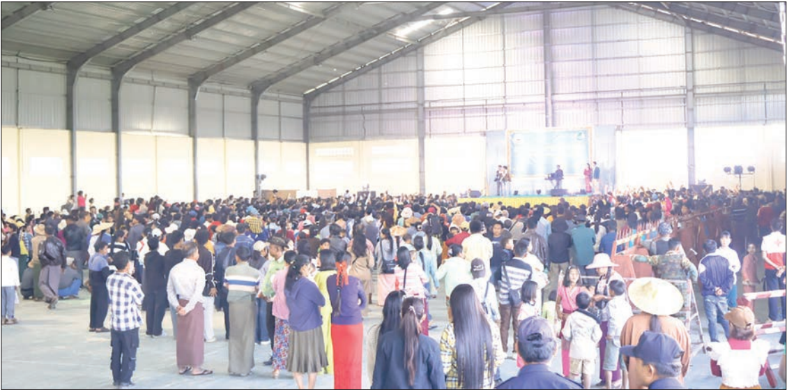
This photo shows the venue packed with local spectators at an entertainment programme in Nawngkhio yesterday, attended by Union Minister U Maung Maung Ohn.

In his speech, Union Minister U Maung Maung Ohn ex-