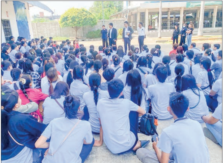
Officials from the Labour Attaché Office conducting a field mission to protect the rights of Myanmar migrant workers.

The office sent an initial formal letter to the Thai Department of Employment to request co-ordination and ensure that the workers were not unfairly terminated. On 19 December, the Labour Attaché visited the Asia Hats and Garment factory and held a coordination meeting with Thai officials, the affected workers, the broker, and the factory's HR Manager, resulting a satisfactory resolution. The Labor Attaché Office issued a statement to contact their branches during office hours if the workers' rights are violated: call centre – 020030015; Bangkok -0618108454, 0626890119, 0652206952; Mae Sot-0652206953; Chiang Mai – 0945866607; and Ranong-0634818121.