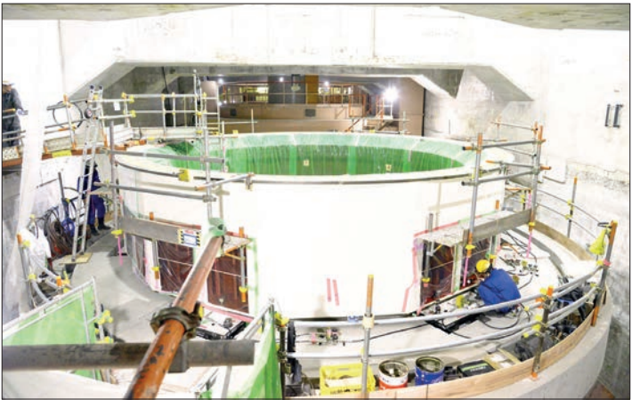
Equipment at a hydropower unit operated by Kansai Electric Power Co is being upgraded at the Kasagi power plant in Ena, Gifu Prefecture, in August 2025.

costs and offers stable output that is less affected by weather conditions. Many of the country's hydro plants were built during the period of rapid economic growth through the 1990s, with their equipment aging. Of the 187 upgrade projects planned by nine major utilities and Electric Power Development Co, 111 have been completed. Repowering allows for a quicker increase in generation capacity compared to new construction, which typically requires a decade or more to complete. — Kyodo