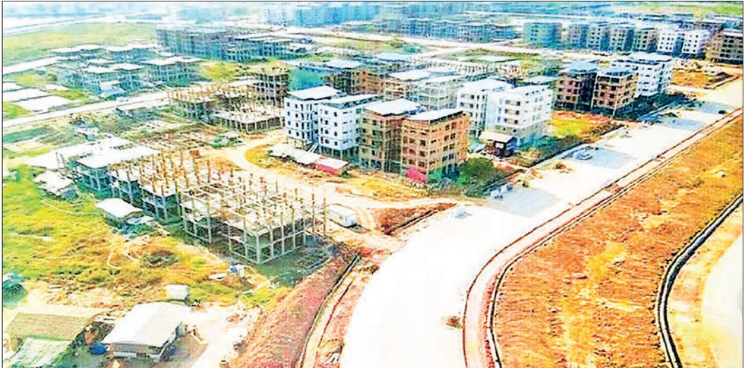
Initial phase of a public rental housing project includes 10,000 units at Dagon Myothit (South) Township was under implementation.

FOR 24 housing construction projects, interested Myanmar citizen-owned companies have been invited to submit application for open tender, announced by the Tender Acceptance and Evaluation Committee. These housing projects will be implemented by the