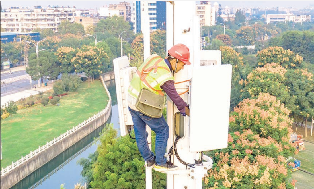
The image shows a technician performing maintenance on a cellular base station.

THE Department of Telecommunications (DoT) closed 2025 on a high note, registering landmark achievements in connectivity, digital infrastructure, and telecom self-reliance. A Year-End Review statement released by the Ministry of Communications highlighted unprecedented growth in internet and mobile penetration, rapid nationwide rollout of 5G services, and major strides in indigenous technology development. One of the most significant milestones of the year was the launch of the National Broadband Mission (NBM) 2.0 in January 2025, aimed at accelerating India's digital transformation. The mission envisions extending high-speed broadband to villages, schools, health centres and other anchor insti-