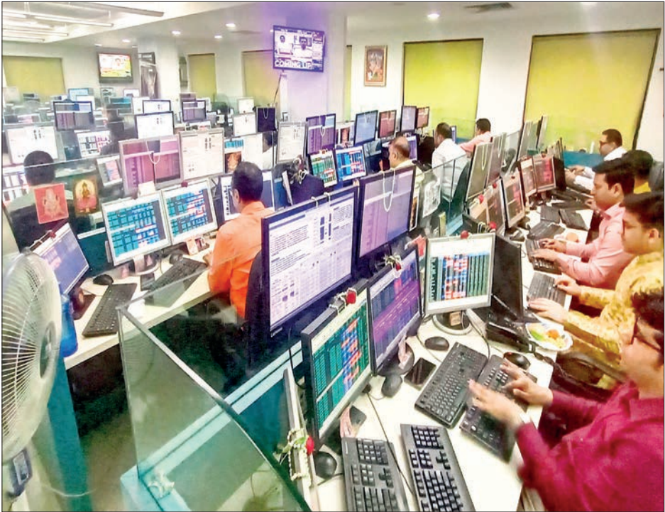
Private equity (PE) investment activity in India slowed in 2025.

be the slowest year for PE investment since 2019 and the slowest for deal volume since 2020,” the report read. The report attributed the slowdown largely to uncertainty around US tariff policies and geopolitical tensions, which have increased difficulty in forecasting risks and returns. — ANI