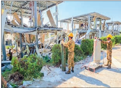
These photos reveal the illegally built two-storey flats destroyed in the KK Park Section 3, Myawady Township, Kayin State.