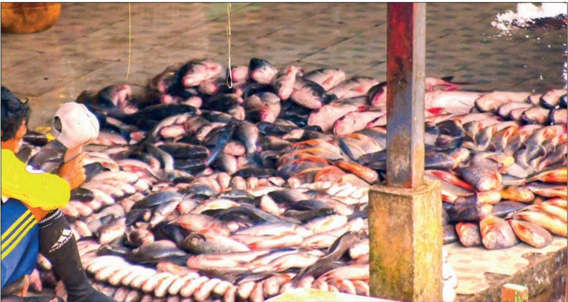
A vender sells rohu fish at the Shwe Padauk fish market in Hline, Yangon.

“In recent months, the inflow of freshwater products had been low, but since early November, imports have stabilized. This month, inflows have reached nearly 250,000 to 300,000 viss per day. As it is the season, fish farms are supplying more fish, and a steady inflow is expected to continue until April. After Yangon, freshwa-