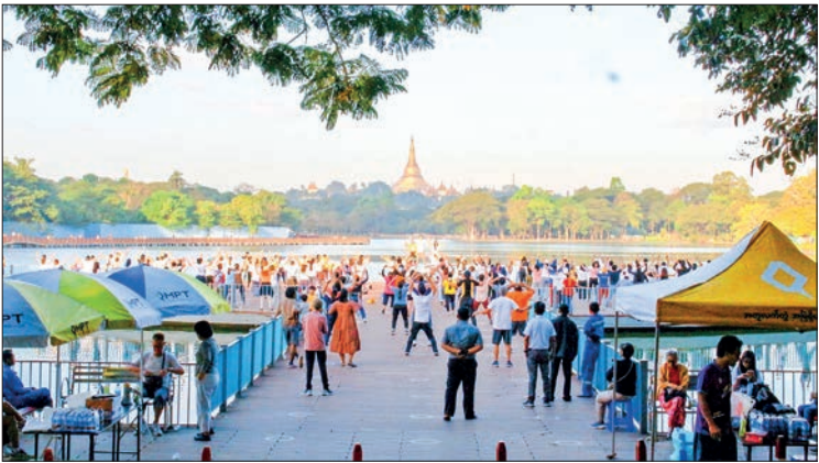
MPT employees and their family members take part in the 'TeamFit: Unite and Move' initiative organized by MPT yesterday.

In the modern technological era, increased reliance on electronic devices has reduced levels of physical activity, adversely affecting people's health and life expectancy. Walking helps address physical inactivity that can impact both community and family life. It strengthens the cardiovascular system, improves bone strength and effectively reduces stress. Zumba training, meanwhile, provides an intensive full-body workout that enhances balance, flexibility and overall physical fitness. Walking also improves blood circulation, helps prevent obesity and supports heart health. For these reasons, MPT employees regularly take part in walking,