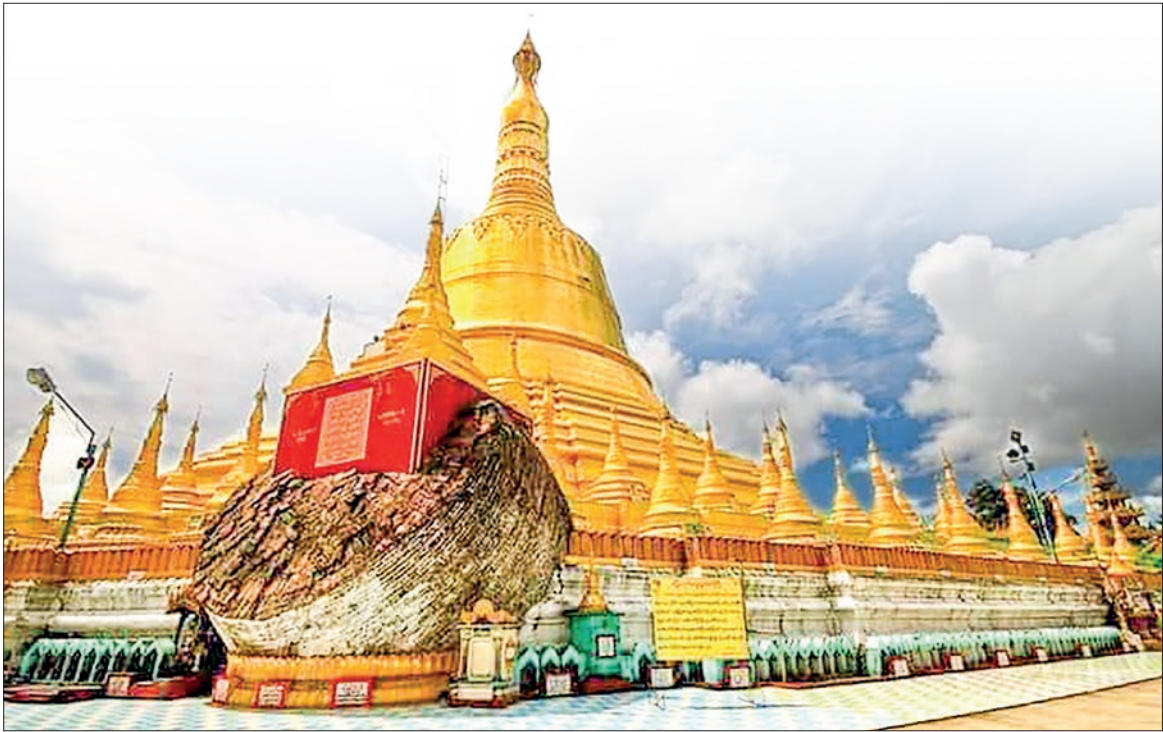
The Shwemawdaw Pagoda, one of the famous pagodas in Myanmar.