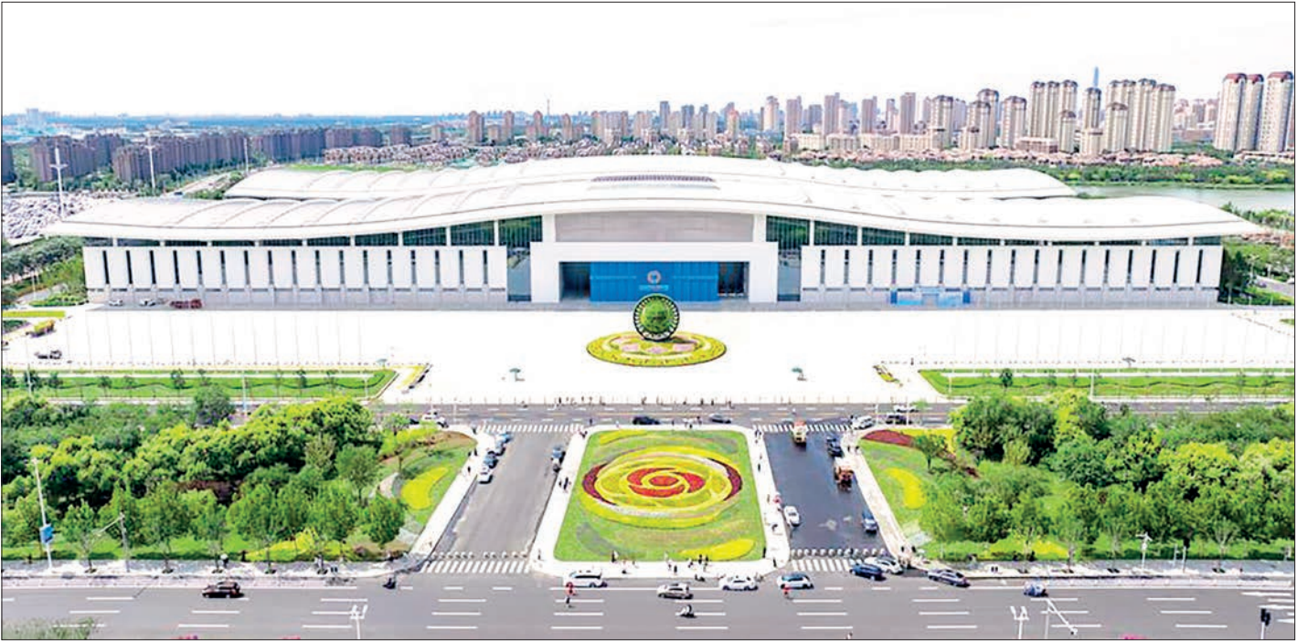
An aerial drone photo taken on 28 August 2025 shows an exterior view of the main venue of the Shanghai Cooperation Organization (SCO) Summit 2025 in north China's Tianjin.

The Global Governance Initiative calls for adhering to sovereign equality, directly targeting the shortcomings of a system in which “a few countries call the shots.”