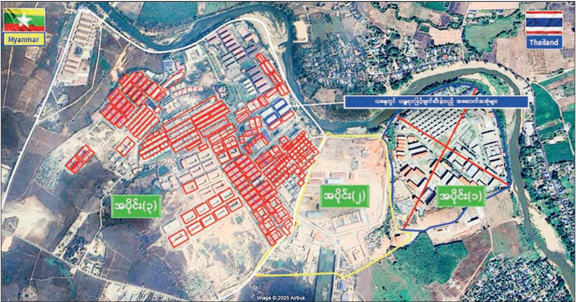
This map shows ongoing demolition measures in the KK Park Section 3.

Yesterday, the authorities demolished three four-storey illegal buildings in Section 3 of KK Park, and a total of 485 buildings out of 635 illegal buildings have so far been demolished in the KK Park area. The combined team conducted searching operations in Myawady and its vicinity area starting 8 December, and found further 12 illegal buildings used for online gambling and sealed four buildings among them yesterday.