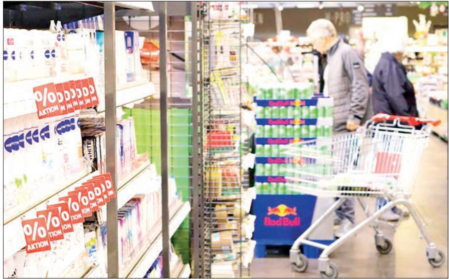
Local authorities are scaling back seasonal spending due to inflation and strained city budgets. People shop at a supermarket in Berlin, capital of Germany, 3 April 2024.

abandon traditional lighting, Russian Foreign Ministry spokeswoman Maria Zakharova said.