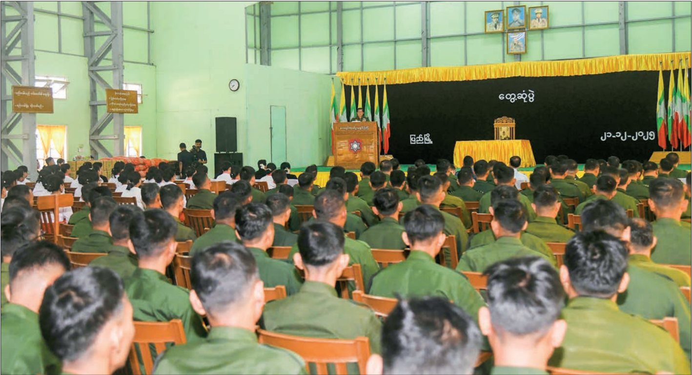
Chairman of the State Security and Peace Commission Commander-in-Chief of Defence Services Senior General Min Aung Hlaing delivers the speech at the meeting with officers, other ranks, and family members of the Pyay Station in Pyay yesterday.

He noted that courage is essential in combat. Tatmadaw members must apply the military skills they have been