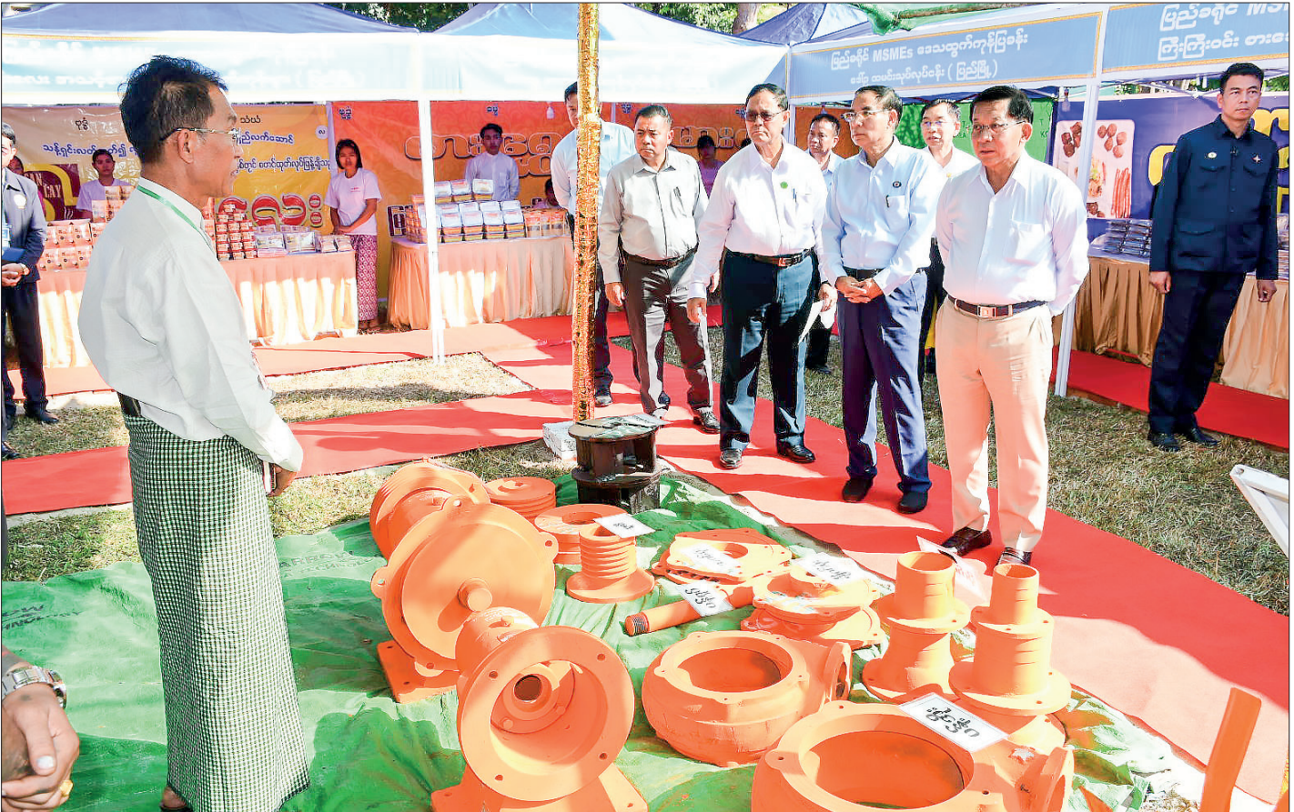
Acting President of the Republic of the Union of Myanmar and State Security and Peace Commission Chairman Senior General Min Aung Hlaing views the products manufactured by MSME businesses and agricultural machinery at the Thiri Khittaya Yadana City Hall in Pyay yesterday.

Efforts are being made to help all eligible voters cast their votes and to prevent any irregularities of voting.