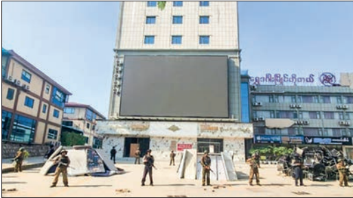
Images depict scam related materials and items being razed by fire in Shwe Kokko areas in Myawady Township, Kayin State.

no longer operate within Myanmar, will continue its efforts in coordination not only with domestic forces but also with the governments of neighbouring countries. — MNA/KZL