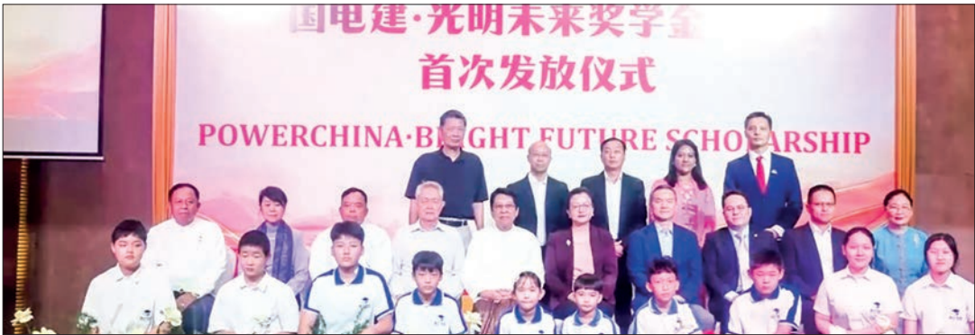
The inaugural award ceremony for the 'Bright Future' scholarships.

or stressful. Doing something we enjoy keeps our mind occupied and reduces emotional eating. Even simple routines help us stay connected to our goals. What truly makes cutting sugar sustainable is patience. Gradually reducing sugar works better than cutting it all at once. Sudden changes often feel shocking to the body and mind, leading to frustration. Slow changes feel gentler and more respectful. Everyone's experience is different. Some people find the transition easy, especially if they never liked sweet food very much. Others need time, adjustments, and self-kindness. In the end, cutting sugar is not about following a strict rule or chasing perfection. It's about awareness. It's about noticing how we feel when sugar no longer controls our energy, mood, and appetite. When we remember that anything taken too much can be harmful, we naturally move toward balance. And that balance, built slowly and kindly, becomes something we can truly live with.