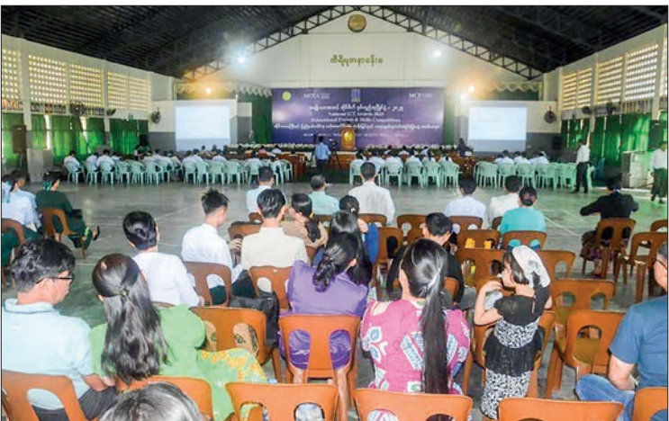
This photo shows the National ICT Award 2025 (Educational Project and Skills Competition) in progress.

in teaching and learning, and nurturing professionals capable of competing in international competitions. The Myanmar Computer Federation is organizing competitions to support outstanding and talented youths in thinking, technology, and management, and to promote the implementation of the Digital Economy Development, MSMEs, legal infrastructure, e-Education, and e-Government initiatives. The ceremony is scheduled for 22 December. — ASH/TH