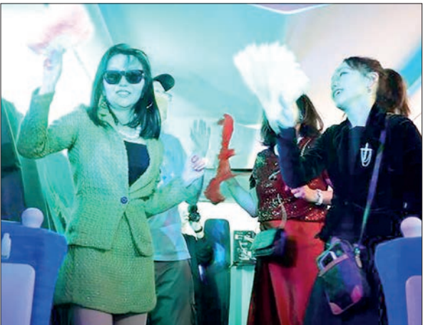
Passengers, along with a DJ from Maharaja Roppongi — a symbol of the disco boom during Japan’s bubble economy in the late 1980s — enjoyed nostalgic disco hits.

run between Tokyo and Shin-Osaka stations. Some 32 passengers, along with a DJ from Maharaja Roppongi — a symbol of the disco boom during Japan’s bubble economy in the late 1980s — enjoyed nostalgic disco hits. The event recreates the 1988 “event car” disco once held on the same line. Organizers chartered a Shinkansen car. — Kyodo